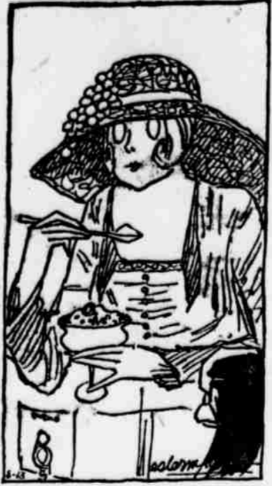
The Young Lady Across the Way

We asked the young lady across the way if she favored prohibition as a war measure and she said it certainly did seem, with so much cotton needed in the manufacture of high explosives, as if no more of it ought to be given for the present.