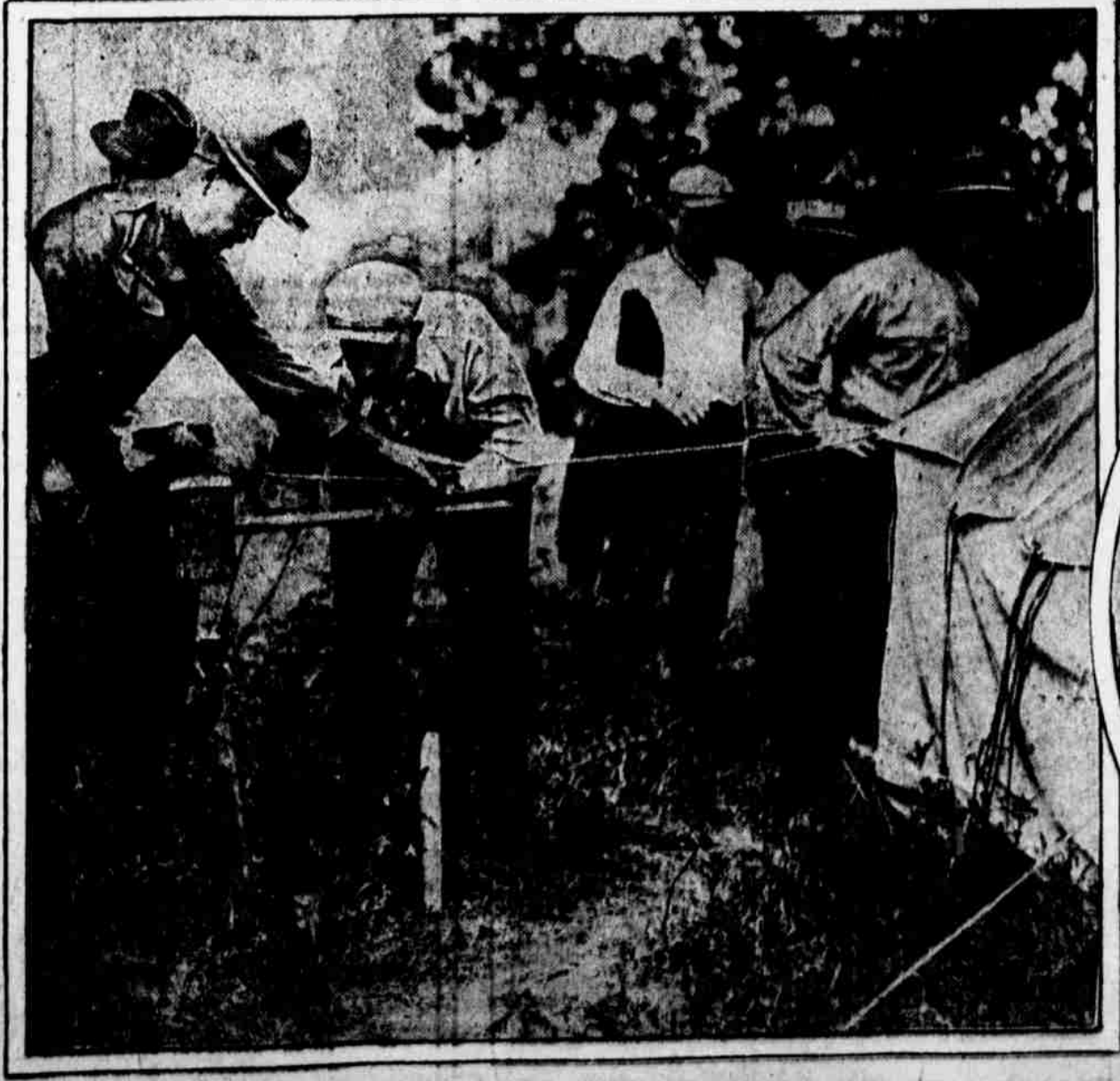
PHILADELPHIA "COPS" LEARN THE MYSTERIES OF WAR Captain Croft, commander of the training camp for military police at Mount Gretna, showing raw recruits how to make a tent roof.