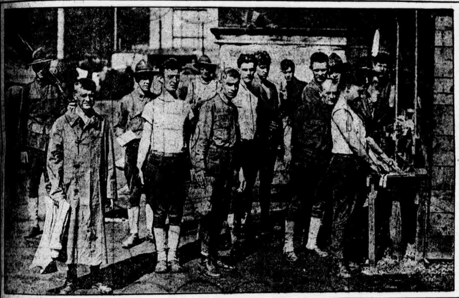
"OH! FOR THE COMFORTS OF HOME!" Members of the Nineteenth Regiment Railway Engineers, stationed at the Commercial Museum, Thirty-fourth and Spruce streets, are becoming adepts at the use of makeshifts. The community washbowl and washtub and the little hand mirror are made to perform the functions of a well-appointed bathroom and laundry.