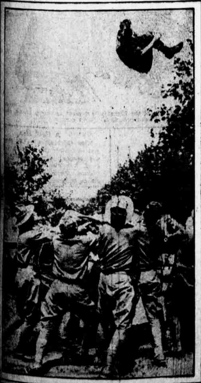
"THEN IT'S UP SHE GOES!" "Socks" has to be tossed in a blanket before