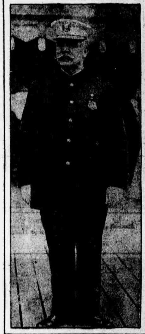
ATLANTIC CITY'S BOARDWALK "FINEST" APPEAR IN WARM-WEATHER UNIFORMS