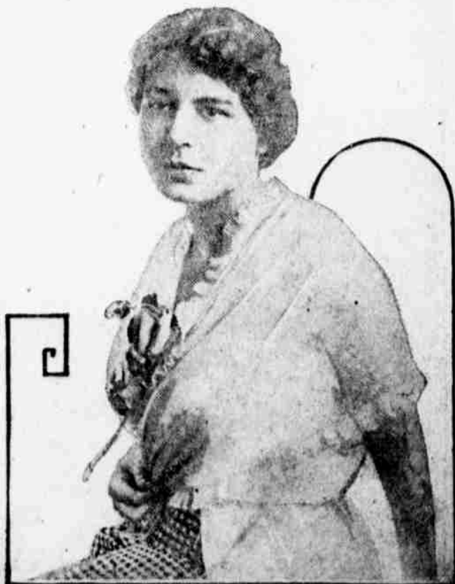
DESERTS CAREER FOR FLAG

This pathetic picture shows two Tommies paying their last respects to the graves of their friends on leaving the front line for a rest in the supports. They erected the cross markers near the graves in far-away Salonica.