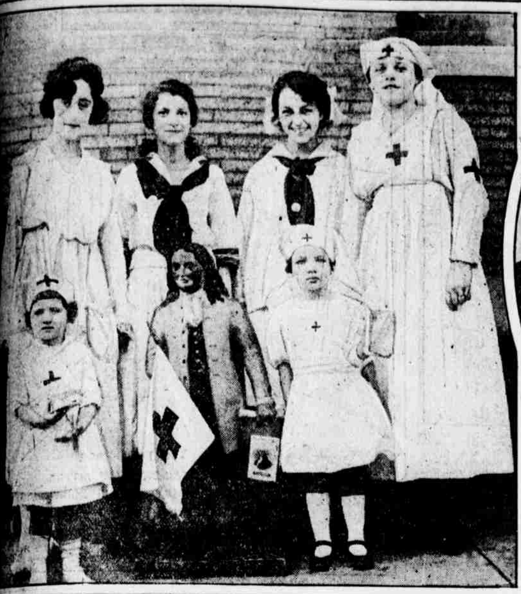
BOOSTERS FOR RED CROSS WORK