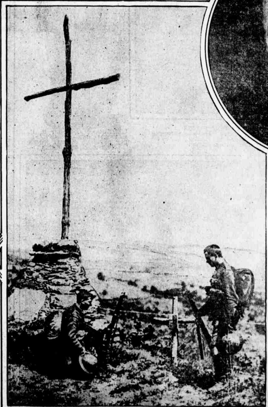
PAYING LAST HONORS TO GRAVES OF COMRADES

This official British photograph shows the transport of a Newfoundland regiment passing through a village where they were billeted. It is one of the latest from the western war zone.