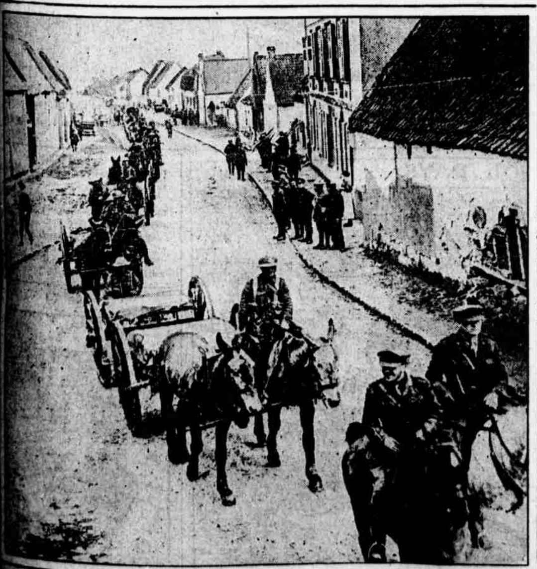
NEWFOUNDLANDERS PASS THROUGH FRENCH TOWN

This official British photograph shows the transport of a Newfoundland regiment passing through a village where they were billeted. It is one of the latest from the western war zone.