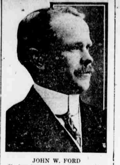
He has been elected Supreme Dictator of the Loyal Order of Moose.