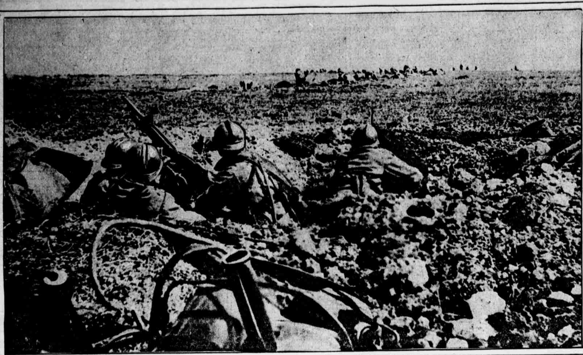
REMARKABLE ACTION PICTURE OF A BATTLE IN PROGRESS ON THE AISNE French troops advancing in the region of Juvincourt pause to dig in after having attained their initial objectives.