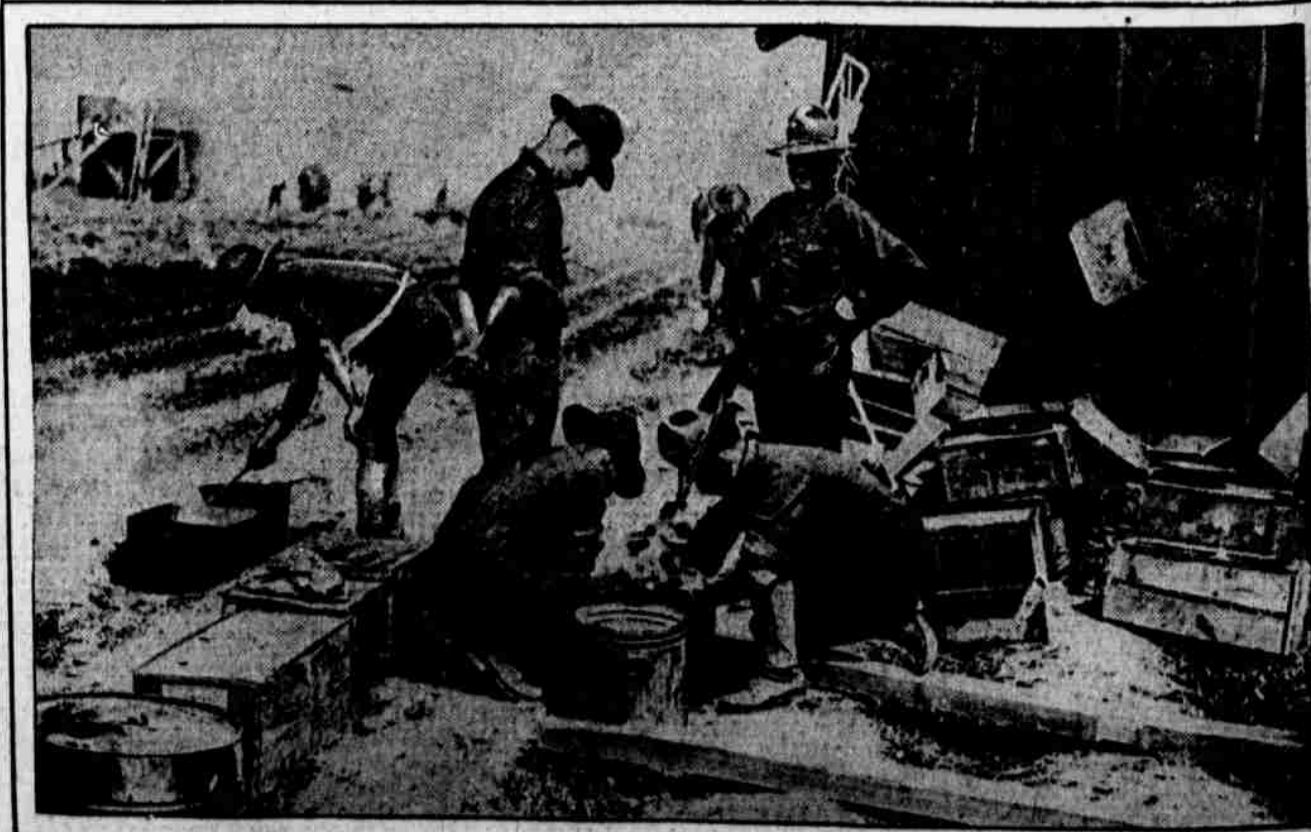
SAMMEES PREPARING A BIT OF "CHOW" AT THEIR TRAINING CAMP BEHIND THE BATTLE LINE IN NORTHERN FRANCE.