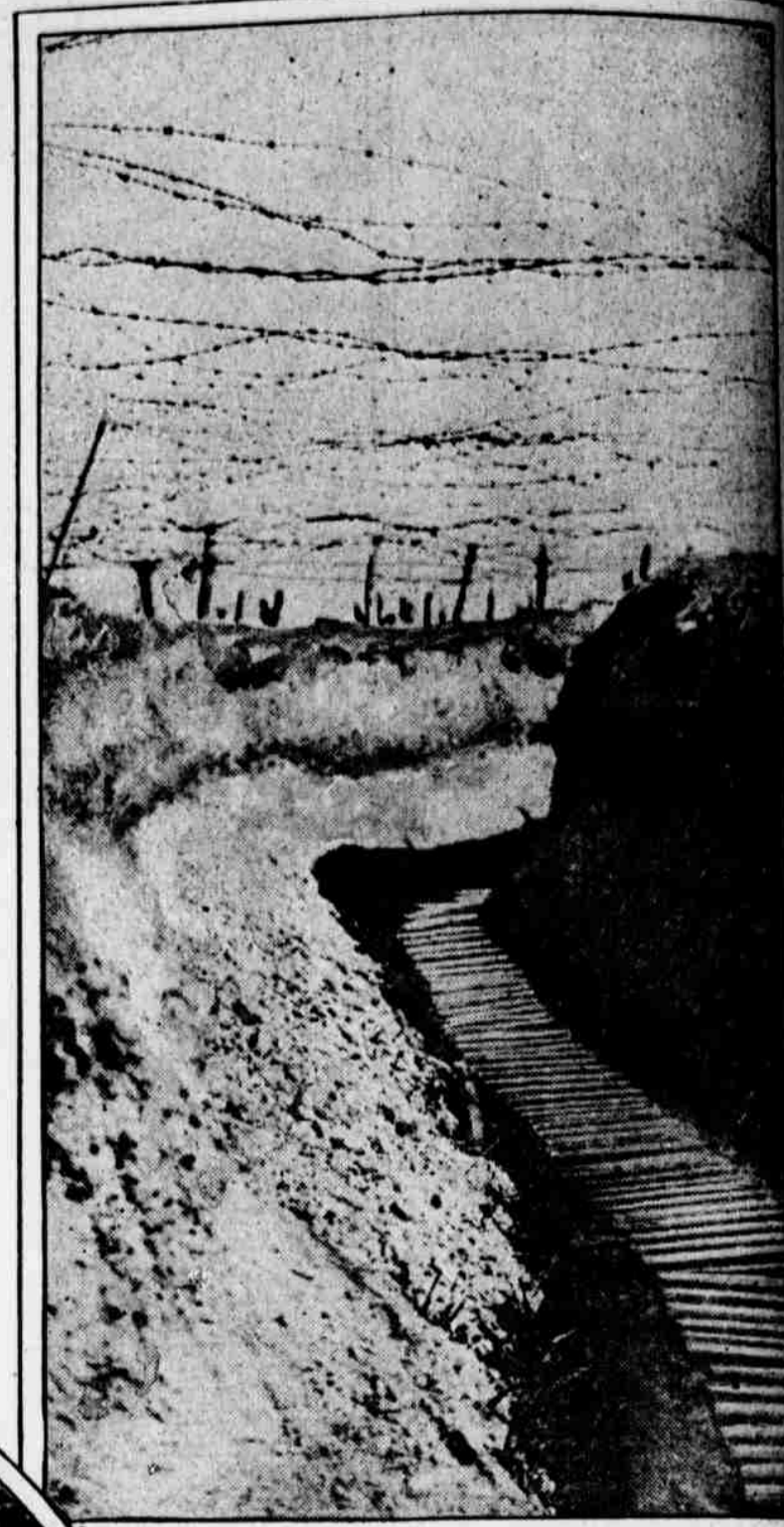
A FIRST-LINE "COMMUNITY" TRENCH PROTECTED BY BARBED WIRE ABOUT ONE MILE FROM ST. THOMAS