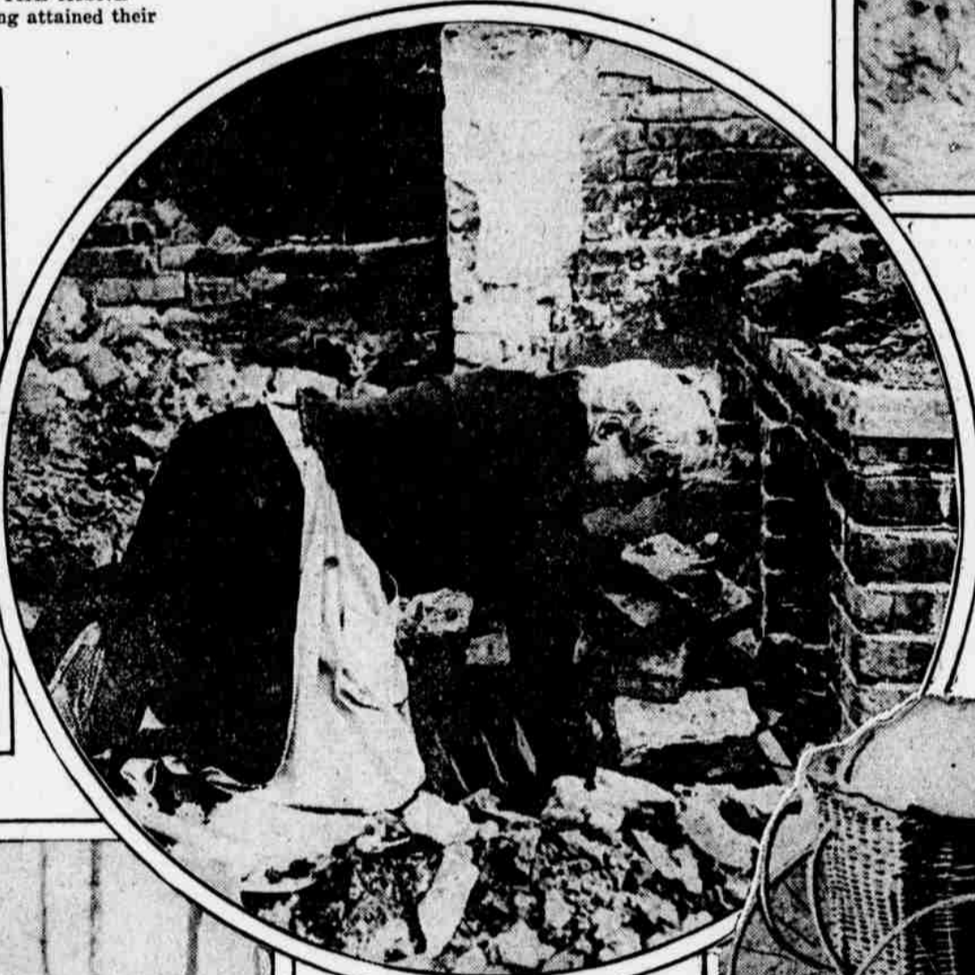
A FRENCHWOMAN'S FRUITLESS SEARCH FOR HER PRECIOUS VALUABLES CARRIED OFF BY THE GER- MANS.