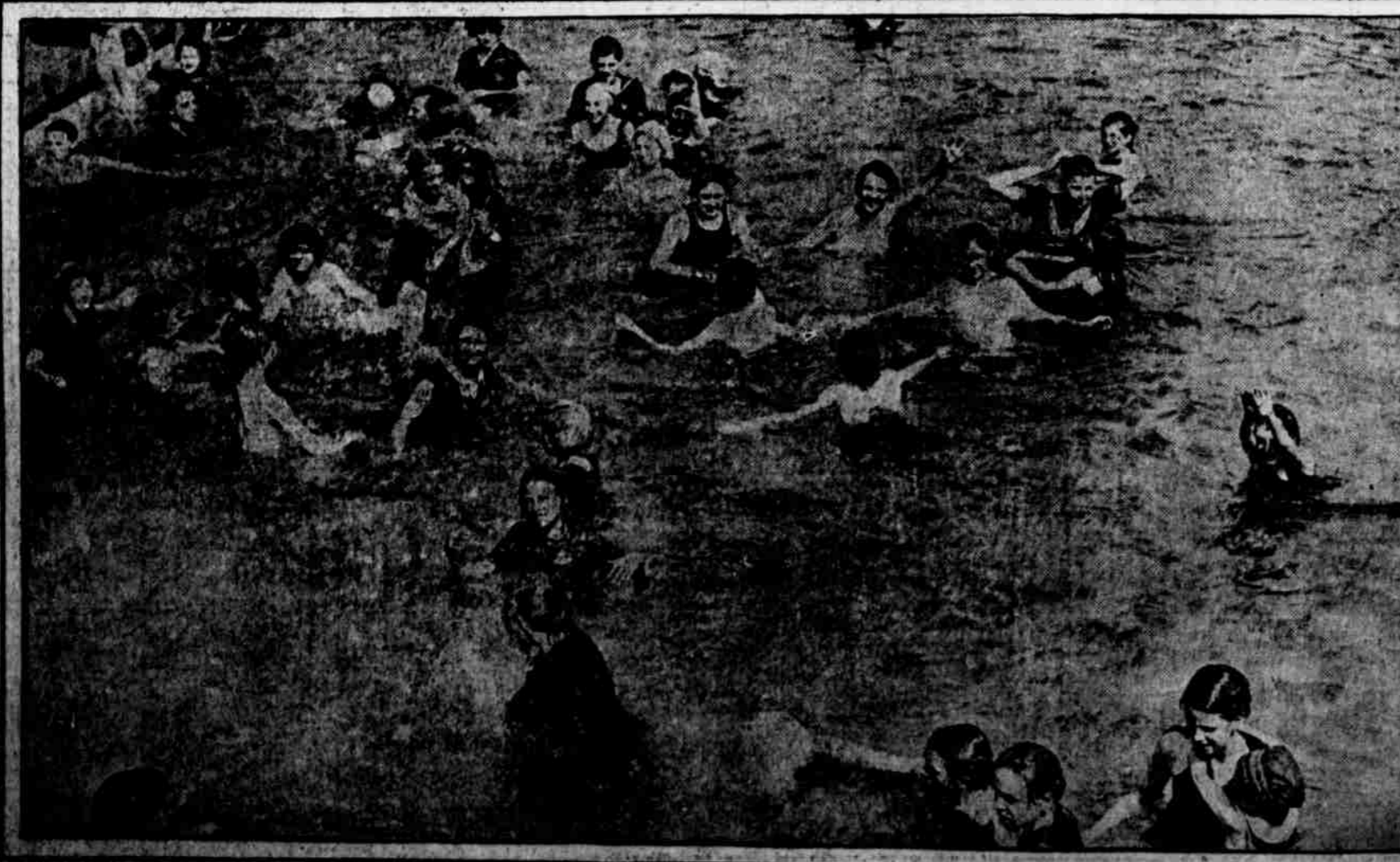
WOMEN AND GIRLS GET A CHANGE IN LEASING OCEAN BREEZES The women and girls in the hot city during the summer find excellent pools in which to get a change in leasing ocean breezes. The picture shows a large crowd of women and girls sitting on the beach during the summer months.