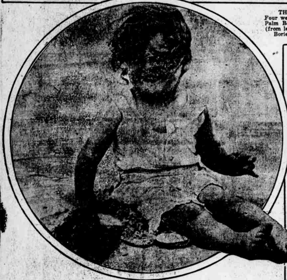
RELIEF FOR LITTLE FOLK IN VARIED STYLE Of course, it's fun to play in the sand after a dip in the foaming surf. But the little "stay-at-homes" find other means of getting cool, if it is in the old-fashioned "shower."