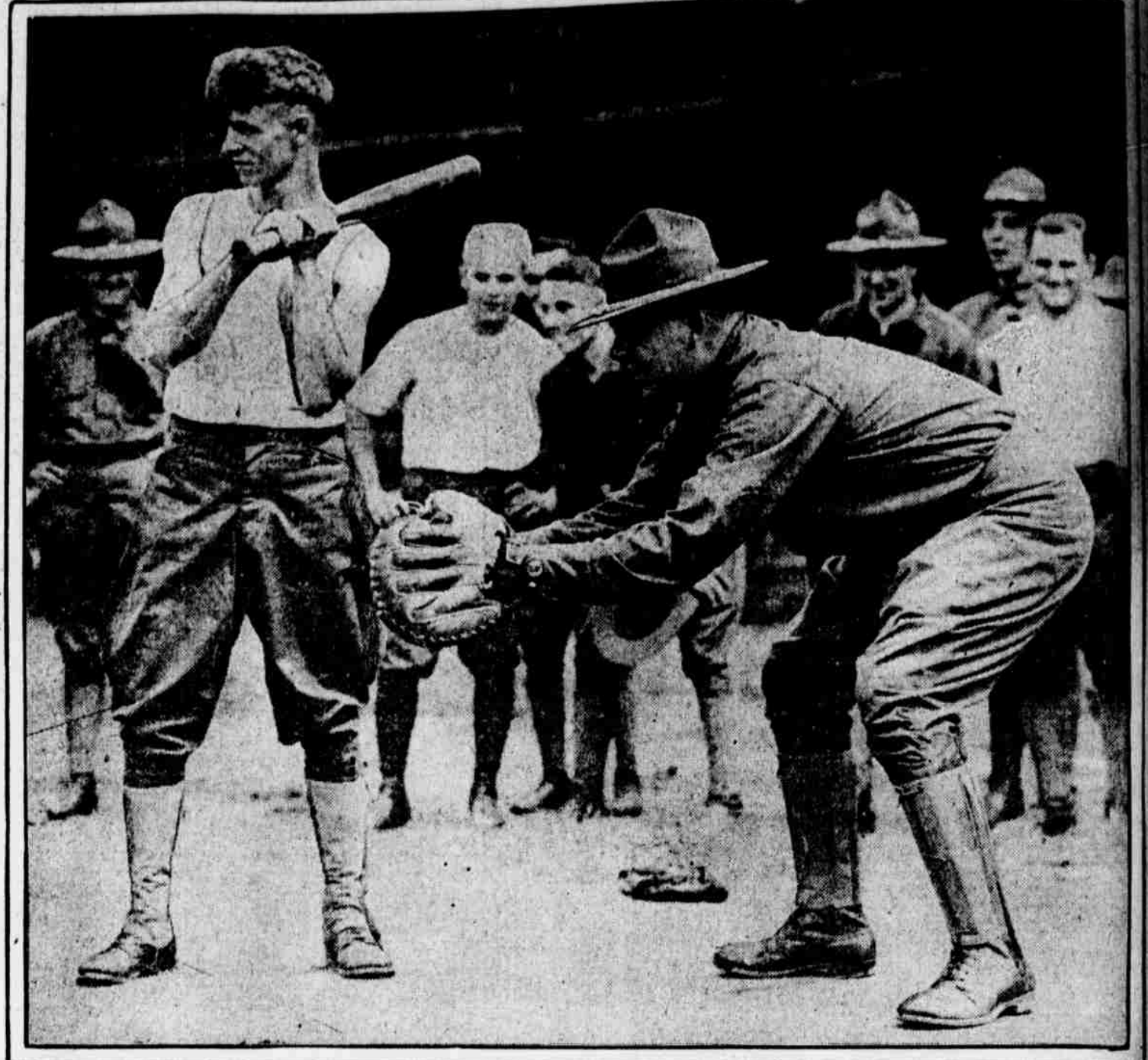
MEMBERS OF PHILADELPHIA SUPPLY TRAIN NO. 4 ENJOY A GAME OF BASEBALL