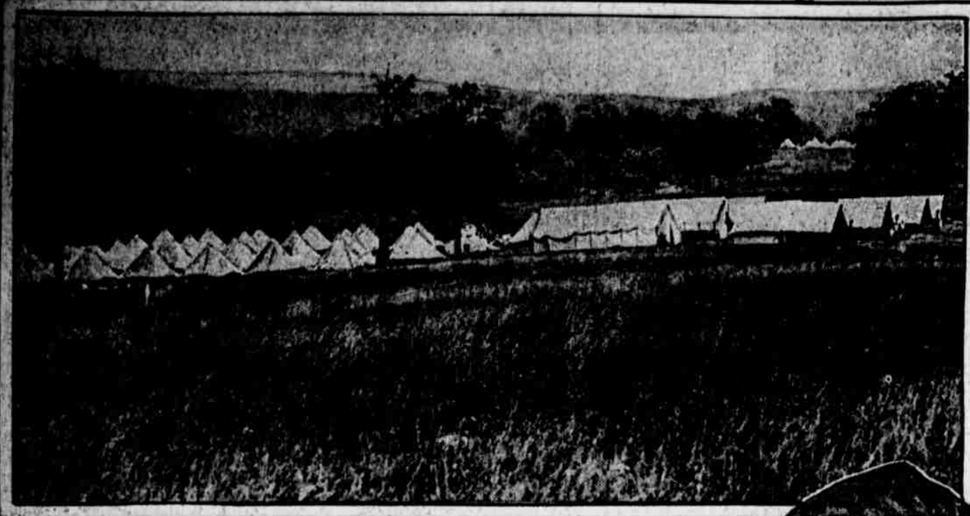
GENERAL VIEW OF ONE SECTION OF THE UPSTATE ENCAMPMENT, WHERE RECRUITS ARE BEING TRAINED TO MAN SUPPLY TRAINS FOR UNCLE SAM'S NEW ARMY