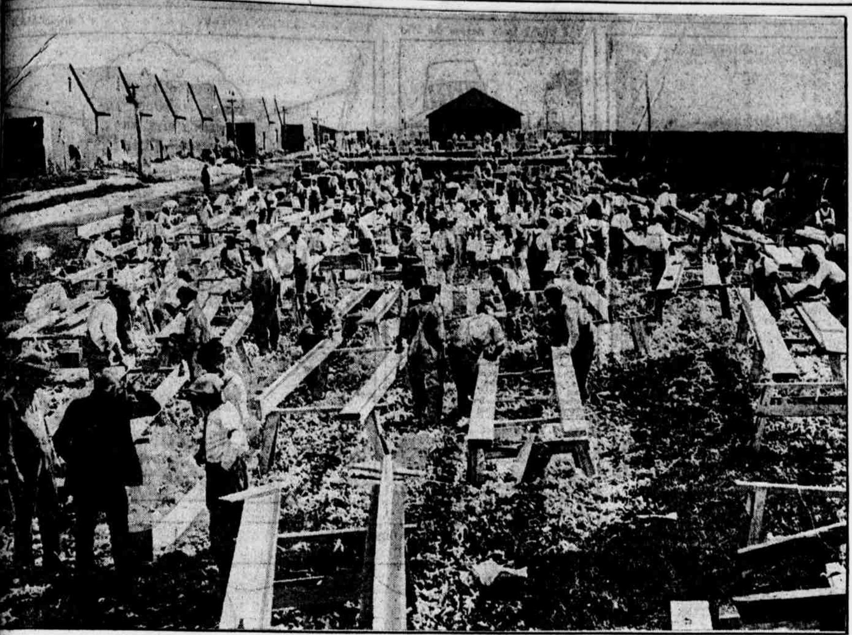
AN ARMY OF CARPENTERS CALLED IN TO MAKE MINEOLA AVIATION SCHOOL THE GREATEST IN THE WORLD. Passage by Congress of the vast appropriation for aeronautics has been the signal for speeding up the work of enlarging the great Long Island training camp. Hammer and saw men from all parts of the United States have been enlisted for the task of constructing the barracks for the student aviators and hangars for their airplanes.