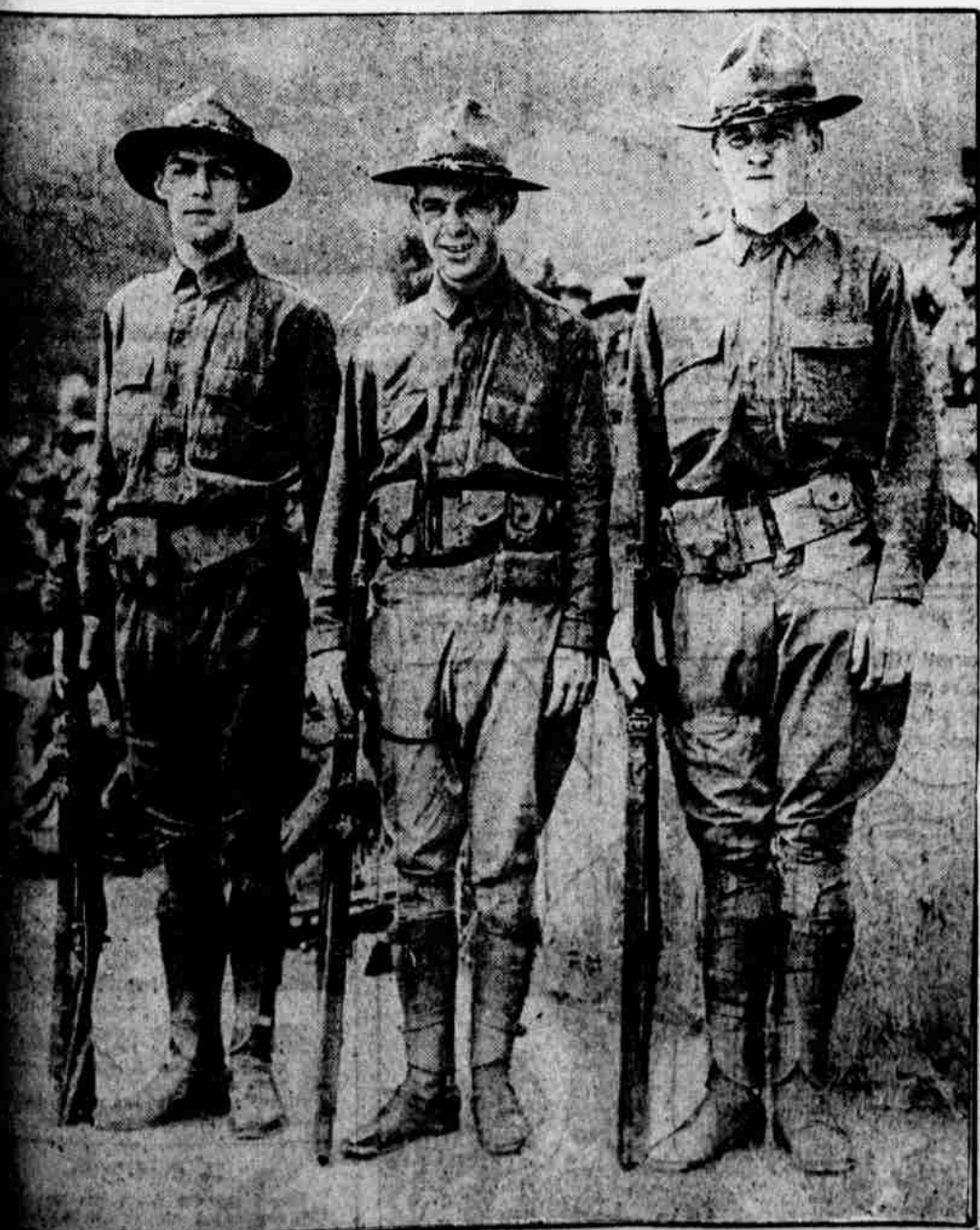
THREE LEDGER MEN WITH TROOP A, PHILADELPHIA CAVALRY are awaiting further orders at their armory, Thirty-second street and Lancaster