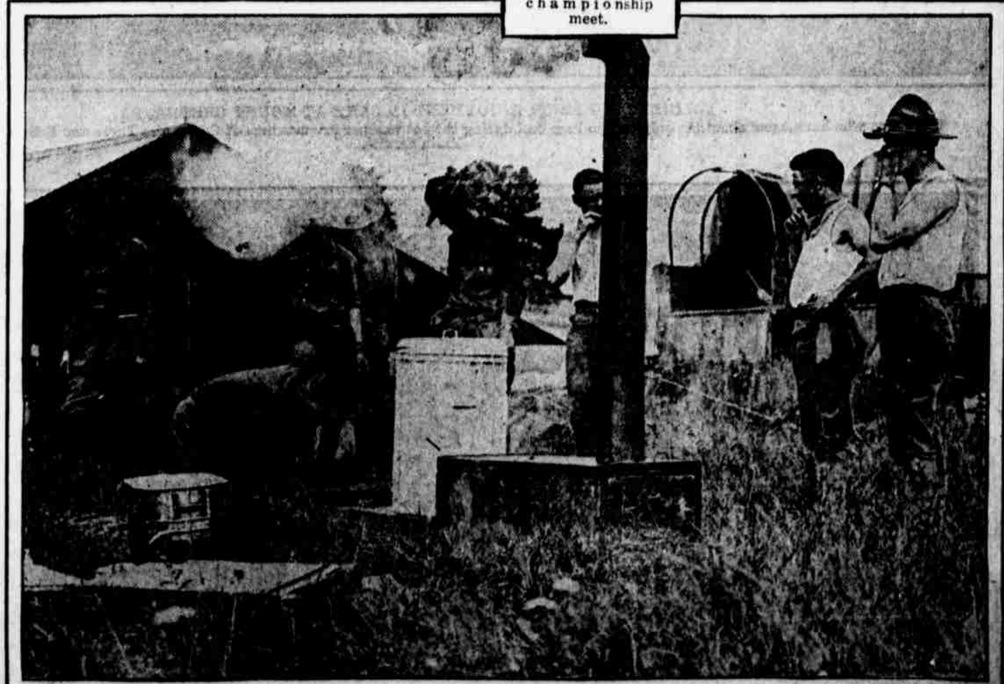
THE MOST POPULAR CORNER OF THE HILL SCHOOL CAMP AT BETZWOOD. Of course, it is the field kitchen, which recalls that just at this time the United States Army is in dire need of patriotic men to serve in the unromantic positions of cooks.