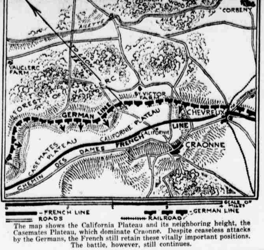
The map shows the California Plateau and its neighboring height, the Casemates Plateau, which dominates Craonne. Despite ceaseless attacks by the Germans, the French still retain these vitally important positions. The battle, however, still continues.

ROMA, 26 Luglio. Telegrammi da Parigi dicono che alla armonia di apertura della conferenza di pace di Parigi, il presidente del Consiglio francese, Ribot, pronunciò un discorso nel quale disse: «Alla conferenza convocata a Londra nei giorni 28 e 29 aprile ultimo scorso Francia ed Inghilterra vennero alla decisione di inviare una nuova riunione in luglio con altre potenze alleate della conferenza per discutere la situazione militare nei Balcani e decidere circa le future operazioni di guerra in quella regione. In seguito a quella decisione vi abbiamo chiesto di riunirci con noi per discutere.