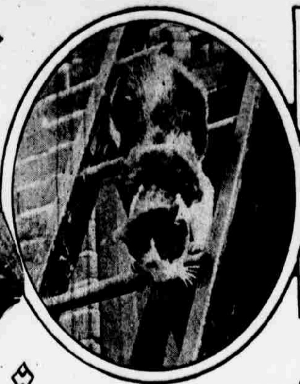
A CAT WITH A CAREER Jerry, talented mascot of Engine Company No. 33, Bridesburg, who delights in descending a fire ladder in imitation of his firemen associates.