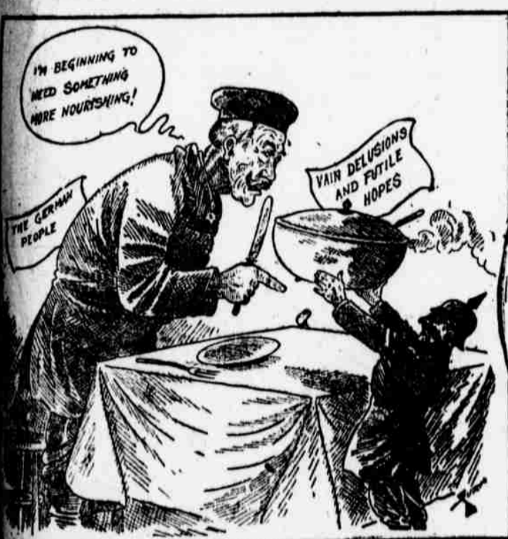
Burt, in the Knoxville Journal and Times. SAME OLD WARMED-OVER DISH