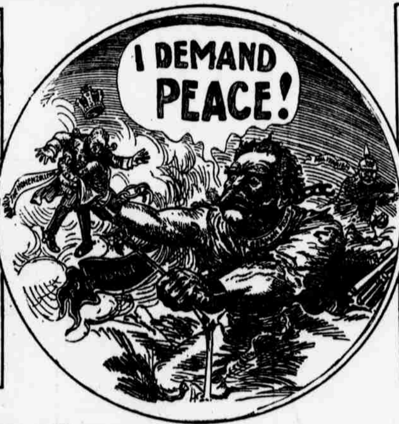
Steele, in the Denver Post. THE ONLY WAY HE WILL GET IT