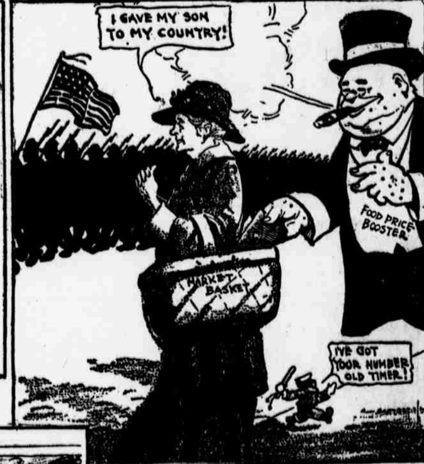
Waterfield, in Boston Evening Record. STOP THIS THIEF!