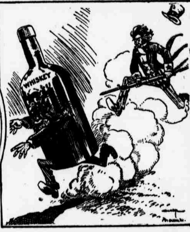
O'Loughlin, in the Los Angeles Express. ON THE RUN