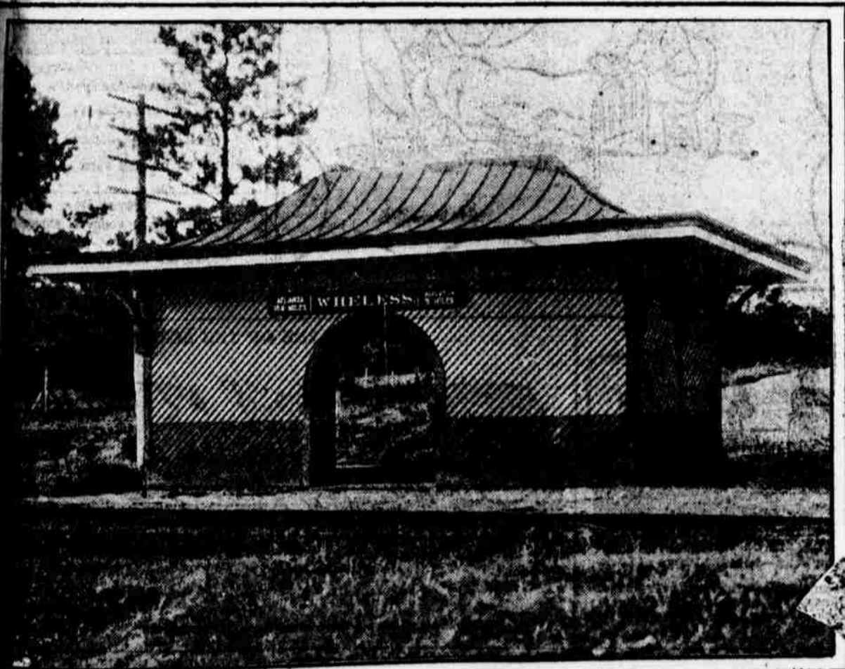
THE TINY STATION AT WHELESS IS FATED TO BECOME A TEEMING TERMINAL. Almost in a twinkling, once the influx of troops begins, the 17,000 men will transfer the peaceful countryside into a vast war camp. The main camp site stands 300 feet above Wheless Station.