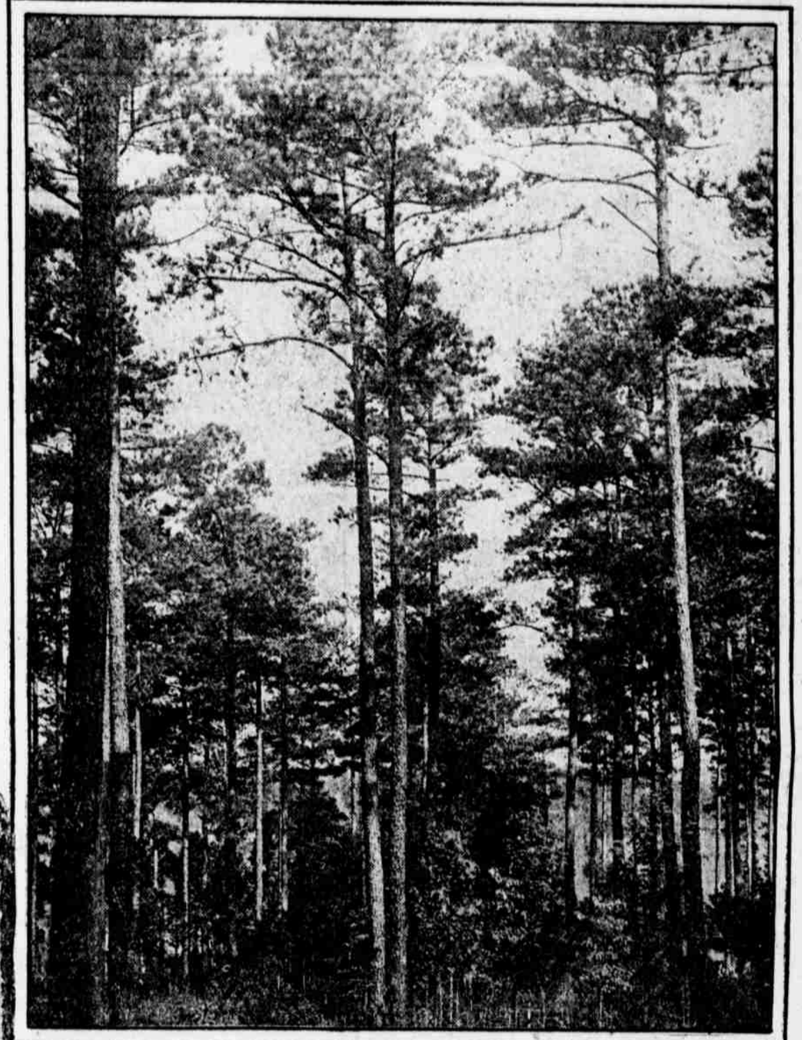
JUST THE SPOT FOR A BIVOUCAC, WITH PINE NEEDLES FOR A BED. The slender conifers in the vicinity of Camp Hancock seem to aspire to reach the dome of heaven. The site itself stands 500 feet above the sea.