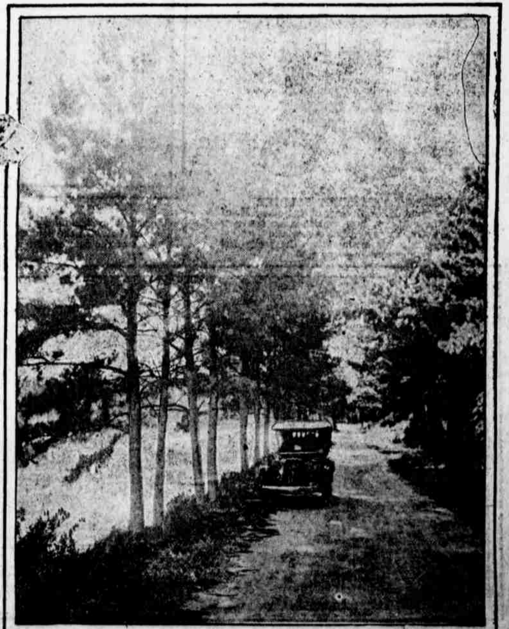
AN INVITING STRETCH OF ROAD ALONG LAKE AUMOND, NEAR THE SITE FOR CAMP HANCOCK.