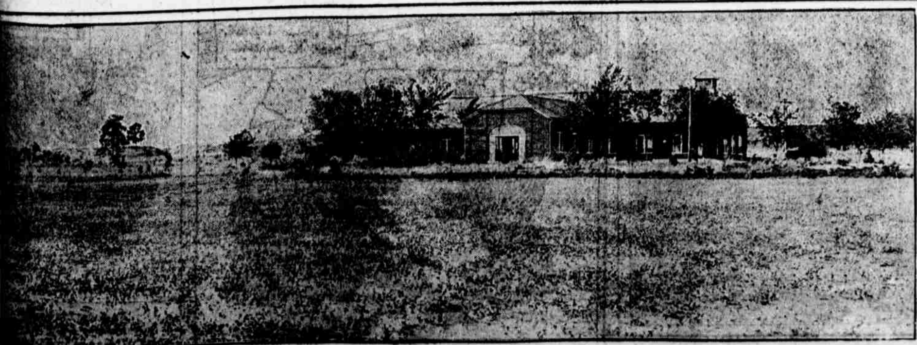
THE WATER WORKS PUMPING STATION ON THE EDGE OF CAMP HANCOCK, WHERE WATER IS DRAWN DAILY FROM SAVANNAH RIVER FOR USE OF THE CITY OF AUGUSTA.