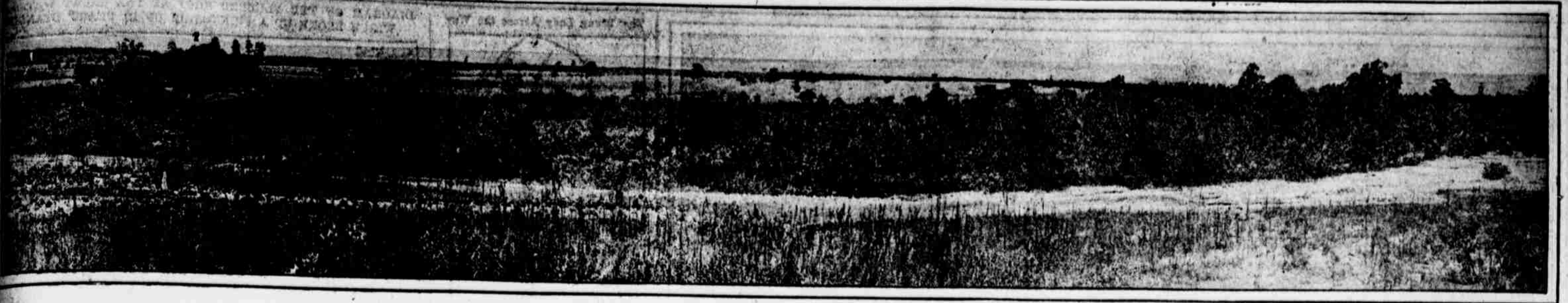
BIRDSEYE VIEW OF THE PROJECTED SITE FOR CAMP HANCOCK, NEAR AUGUSTA. On this terrain was situated Camp McKenzie, a Spanish-American War fame. The new European war encampment will embrace more than 2000 acres, just four times the space required in 1898. For this vast site the Government will pay the modest sum of $1 for a period of two years, a group of citizens having subscribed a fund to buy up the crops and property rights from the owners.