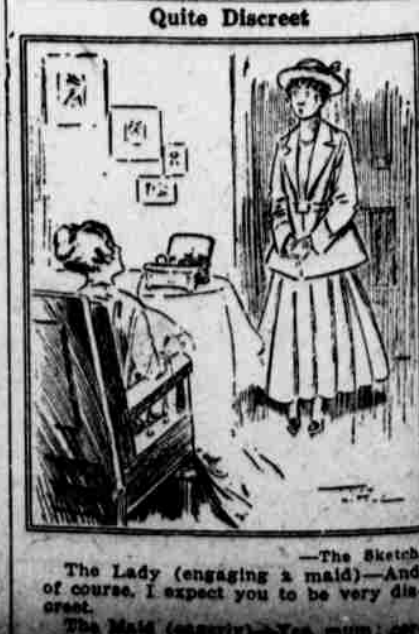
Quite Discreet —The Sketch. The Lady (engaging a maid)—And, of course, I expect you to be very discreet. The Maid (angry)—Yes, miss, but I don't want to be a maid.

Some Procession A visitor to Ireland was bidding farewell, and said to an attendant: "Good-by, Pat." "Good-by, yer honor. May God bless you, and may every hair of your head be a candle to light your soul to glory!" "Well, Pat," he said, showing him a bald pate, "when that time comes there won't be much of a torchlight procession."