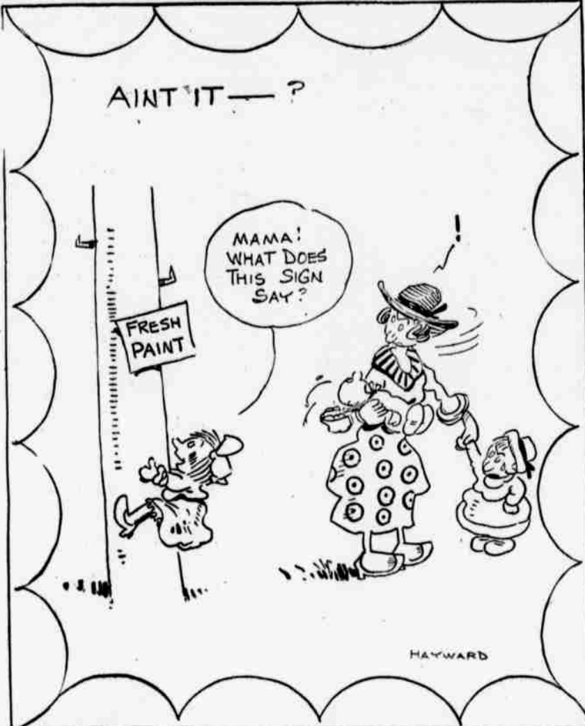
THE PADDED CELL

Daughter Wanted The telephone bell rang and the great physician replied in his usual gentle voice. Then he crashed down the receiver and sprang up. "Quick! Hand me that satchel!" he cried. "A man just telephoned me in a dying voice that he couldn't live without me!" "Wait!" declared his wife, who had taken up the receiver, "that call is for Edith!"—Answers.