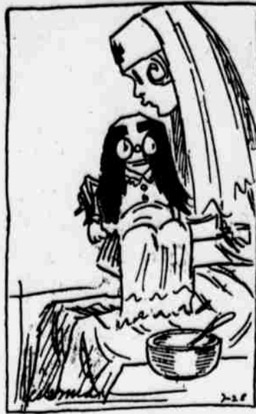
The Young Lady Across the Way

The young lady across the way says the girls must be taking part in the actual fighting now, as she saw in the paper that the latest model of French airplanes carries three airmen and two mitrailleuses.