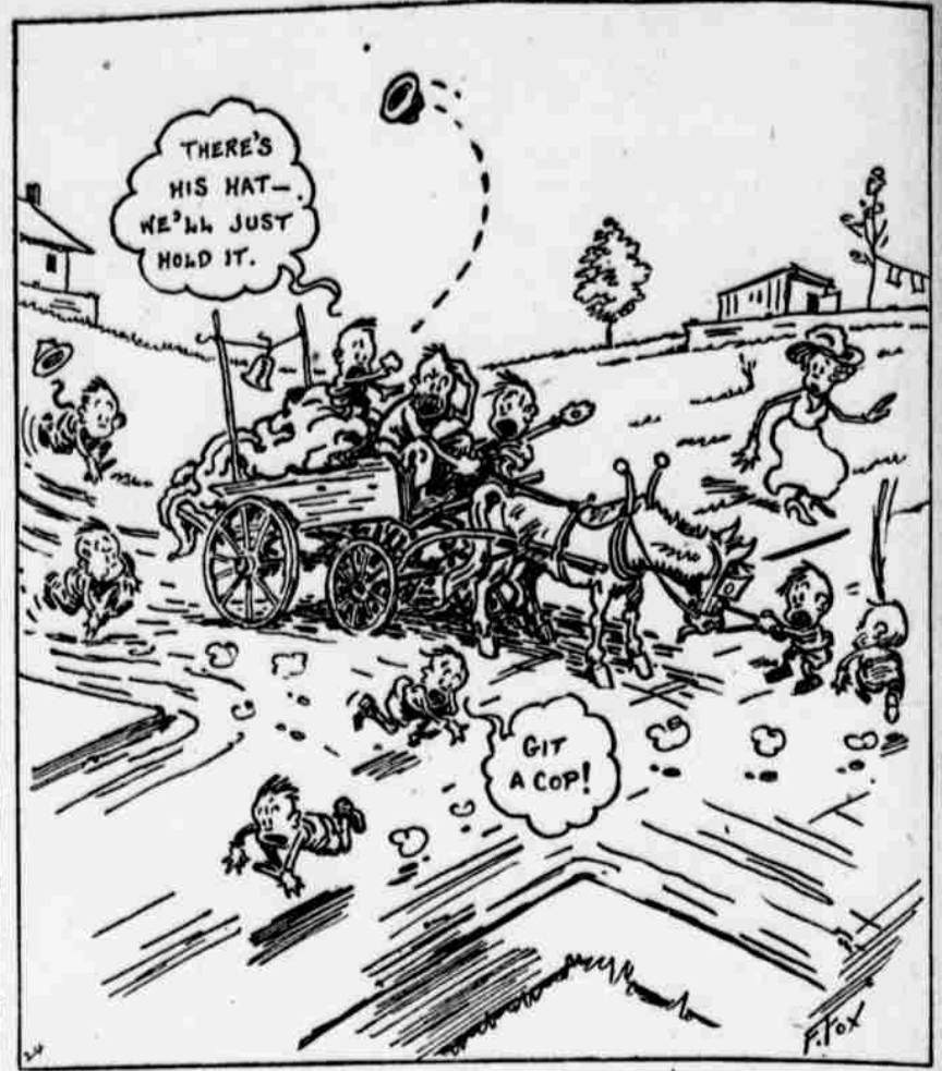
By FONTAINE FOX (Copyright)