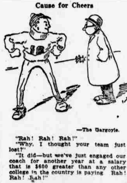
Cause for Cheers —The Gazette. "Rah! Rah! Rah!" "Why, I thought your team just lost!" "It did—but we've just engaged our coach for another year at a salary that is $600 greater than any other college in the country is paying. Rah! Rah! Rah!"

Of Course —London Opinion. The Sub—I paid a guinea to a palmist yesterday, and she described you exactly and said we should be married within a month. The Girl—How extravagant you are—I could have told you that for nothing!