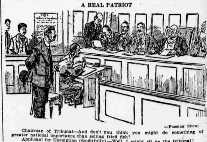
A REAL PATRIOT —Passing Show. Chairman of Tribunal—And don't you think you might do something of greater national importance than selling fried fish? Applicant for Exemption (doubtfully)—Well, I might sit on the tribunal!