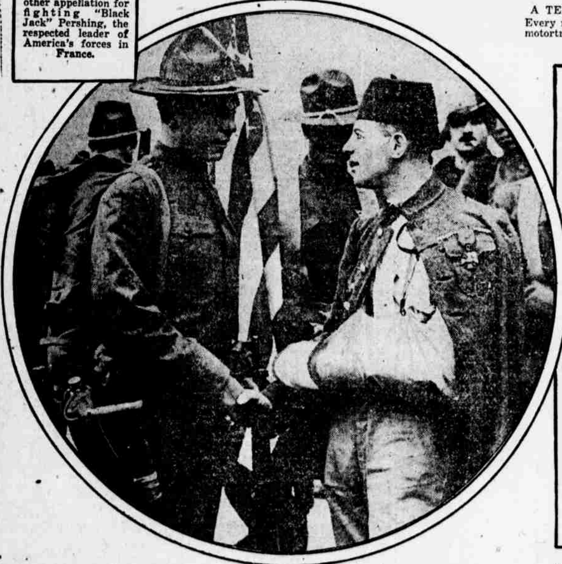
"SAMMEE" GREET'S A WOUNDED CONFREME IN FRANCE The two brothers in arms are trying to make themselves understood at the barracks at Reully. Note the poilu and his friend behind are examining with curiosity the American knapsack, which is so much easier to carry than that of the French poilu.