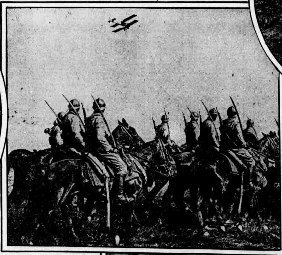
Even during review the eyes of the army remain wide open. Unusual photo of an airplane guarding the heroes of this year's French offensive from an aerial attack while they are on parade behind the battlefield.