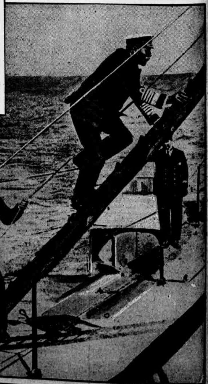
A GREAT DEAL IS EXPECTED OF A KING THESE DAYS King George is cautiously making his way aboard one of the newest and largest of the submarines attached to his Grand Fleet. Since the beginning of the war the British monarch has held these