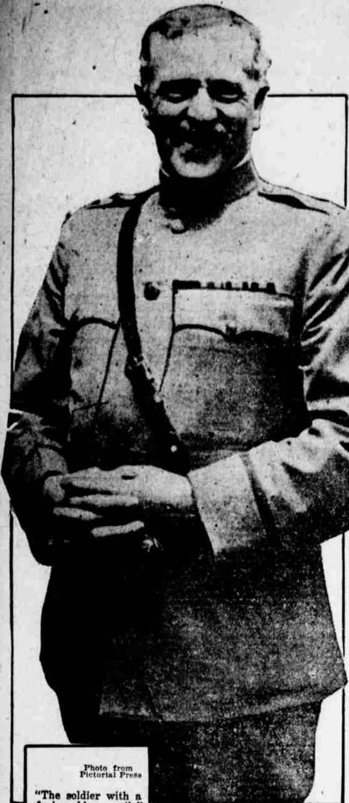
"The soldier with a friendly smile" might well be another appellation for fighting "Black Jack" Pershing, the respected leader of America's forces in France.