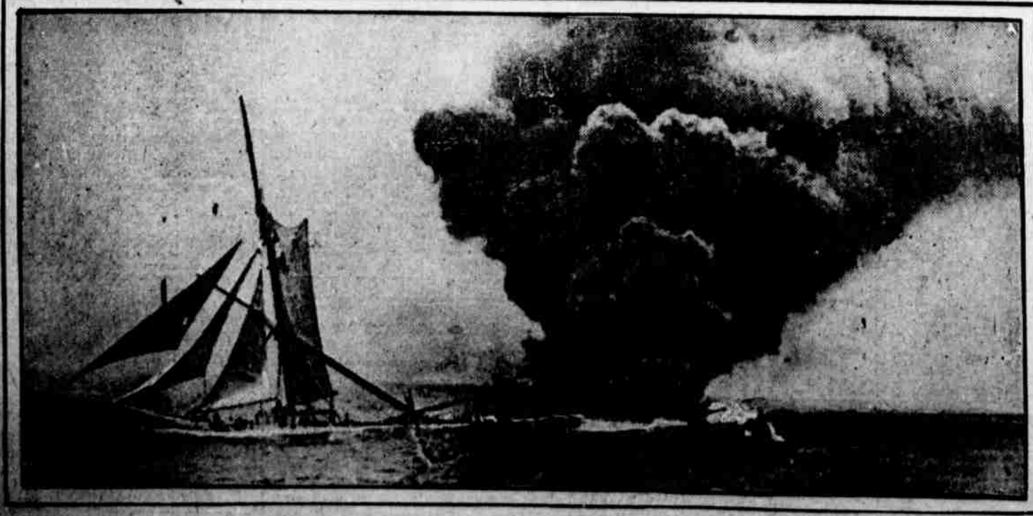
ANOTHER TRIBUTE TO THE SATANICAL POWER OF THE U-BOATS This massive photograph showing a British sailing vessel fast burning before its final plunge following the attack of the U-boats. This is one of three pictures printed in the Berliner Illustrirte Zeitung to soothe the German people of the success of the U-boat war.