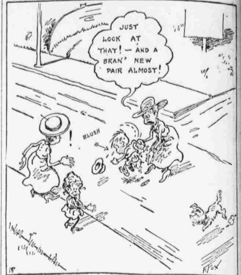
PATHETIC FIGURES—THE KID WHOSE MA WHIRLS HIM AROUND RIGHT IN FRONT OF HIS BEST GIRL WHEN HE'S TORN THE SEAT PLUMB OUT OF HIS TROUSERS

Merry King Art—Now just what are your reasons for wishing to resign from the Round Table? Sir Lionel—My wife objects to this Knight work.—California Pelican.