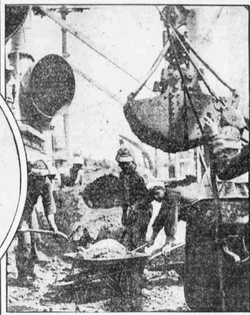
COALING UNITED STATES WARSHIP FAR FROM HOME With a part of Uncle Sam's battleship fleets in foreign waters. The censor wouldn't permit much to be said about this picture.