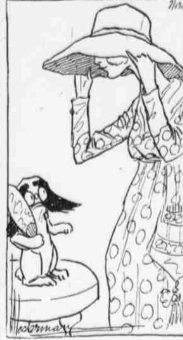
The Young Lady Across the Way

The young lady across the way says the map of Europe changes so rapidly that she notices the newspaper correspondents guard against mistakes by saying things happened somewhere in France without trying to name the town.