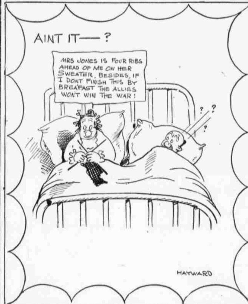
THE PADDED CELL