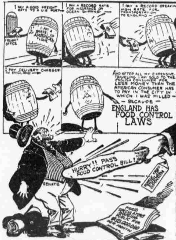
Blissom, in Dayton Daily News NO JOCKEYING NOW