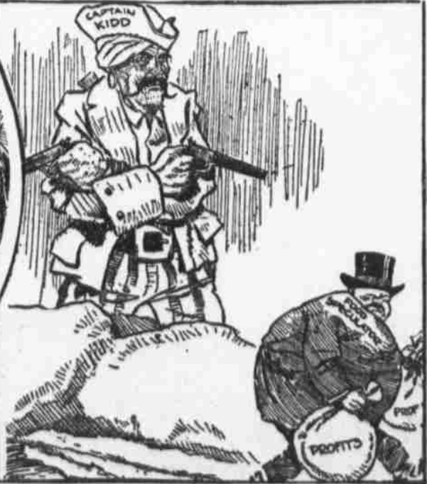
Los Angeles Evening Express "I WAS BUT A PIKER AFTER ALL"