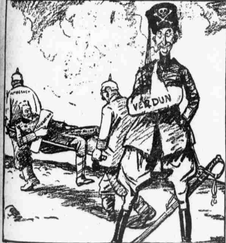
Kirby, in New York World THE VICTOR