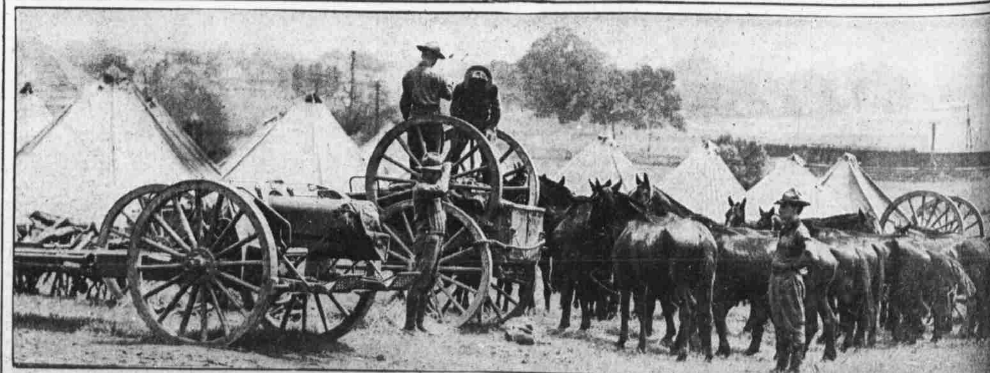
MEMBERS OF THE SECOND FIELD ARTILLERY AND EQUIPMENT AT THEIR FIRST REAL WAR CAMP NEAR NOBLE

Letters, of the department store nine, is waiting for the opposing mountman to put one over.