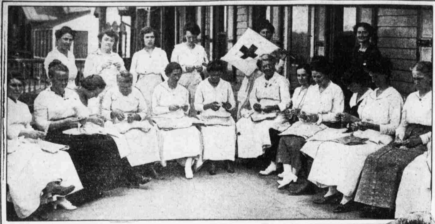
NEW JERSEY WOMEN PICKING LINT FOR BANDAGES