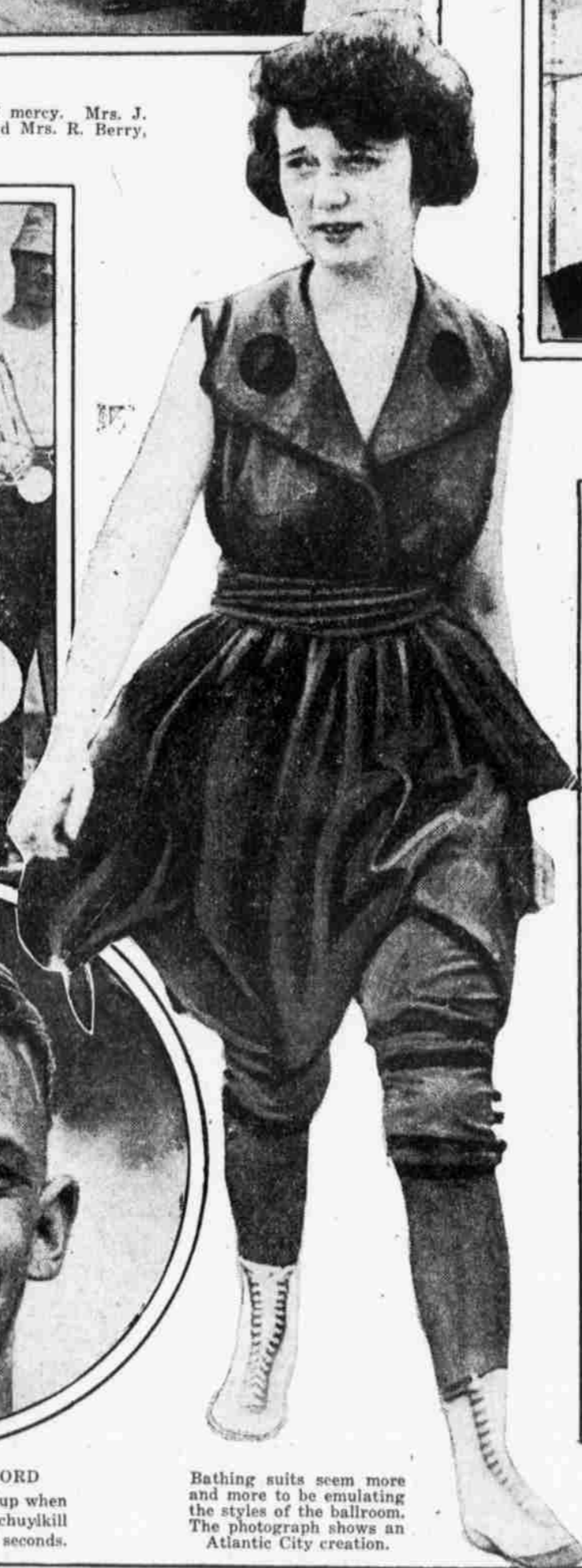
Bathing suits seem more and more to be emulating the styles of the ballroom. The photograph shows an Atlantic City creation.