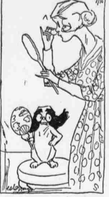
The young lady across the way says she saw in the paper that the Russian rupee has depreciated greatly in value.

So Do We As the boat-train neared Southampton, the porter cante to the influential-looking person, saying: