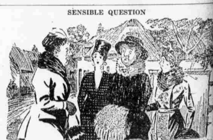
Vicar's Wife—We are commencing weekly classes to teach young ladies to a good wives. Would you care for your daughters to attend? Mrs. Hardup—Well—er—can you guarantee to—er—find—er situations afterward!