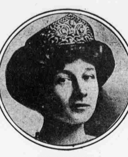
KAISER'S ONLY DAUGHTER The frequent prominence of the German Crown Prince and his brothers in the public eye in no wise dims the popularity of their only sister, the Princess Victoria Louiss, wife of Prince Ernest of Cumberland.