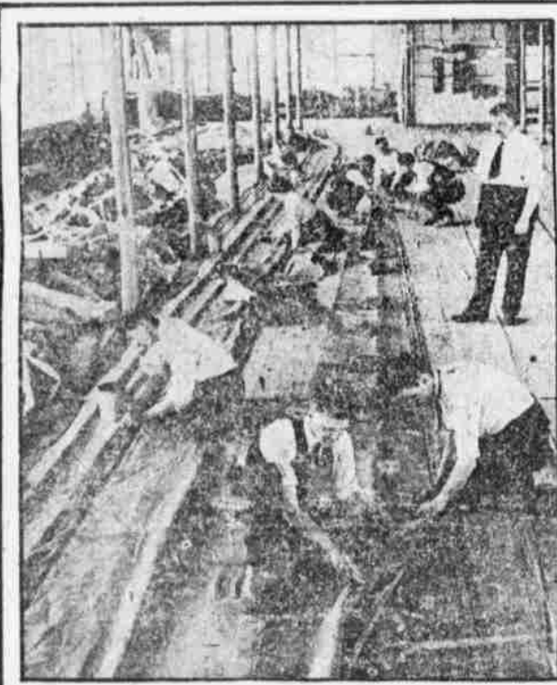
MAKING WAR DIRIGIBLES FOR UNCLE SAM A photograph, passed by the army censor, showing workmen in a New England factory laying out patterns and getting ready to join together the long sections of rubber cloth.