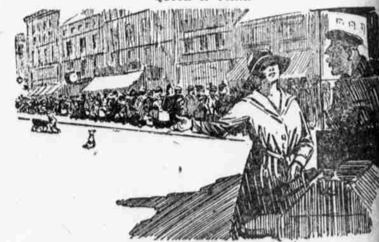
QUITE A FARE

Taxi Driver—Where to, lady? Lady—Potato queue end, please.