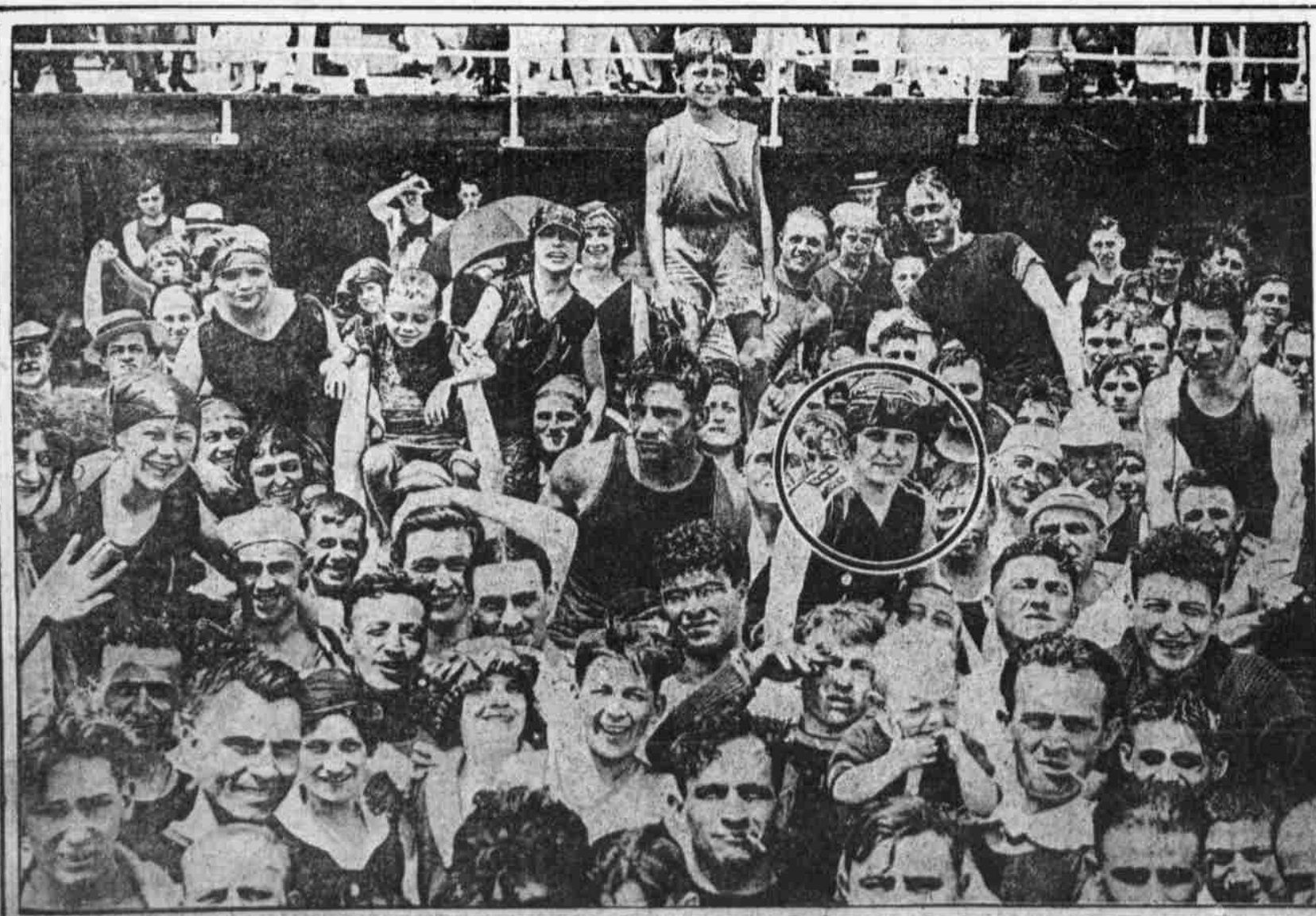
DID YOU SPEND SUNDAY AT THE SHORE? PERHAPS YOU ARE THE PRIZE-WINNER An EVENING LEDGER staff photographer took this photograph on the beach at Atlantic City yesterday. A prize of $1 will be presented to the young woman who has been "ringed" if she will call at the Evening Ledger's Picture Department.