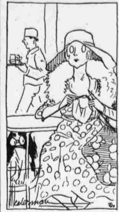
The Young Lady Across the Way

The young lady across the way says it's simply fine to see the big business interests so eager to help their country in this emergency and she sees by the paper that the bidders on Government supplies are already in collision.