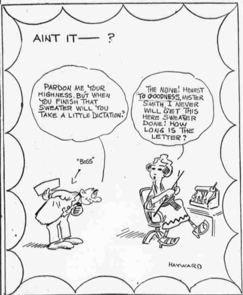
THE PADDED CELL

THE SKIPPER IS DETERMINED TO MAKE SIM HINKLE KEEP THAT COW OF HIS OFF THE TRACKS OR KNOW THE REASON WHY.