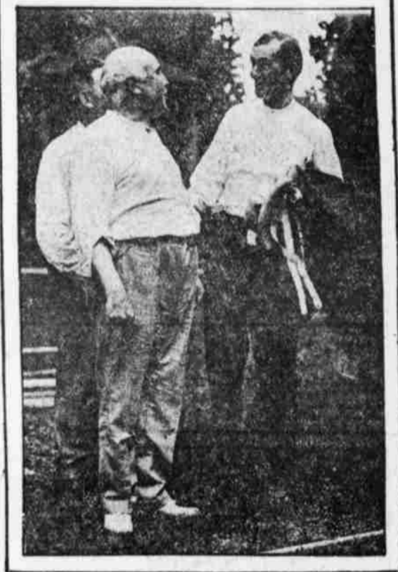
Franklin K. Lane, Secretary of the Interior, discusses the advantages of physical training with William Gibbs McAdoo, Secretary of the Treasury.