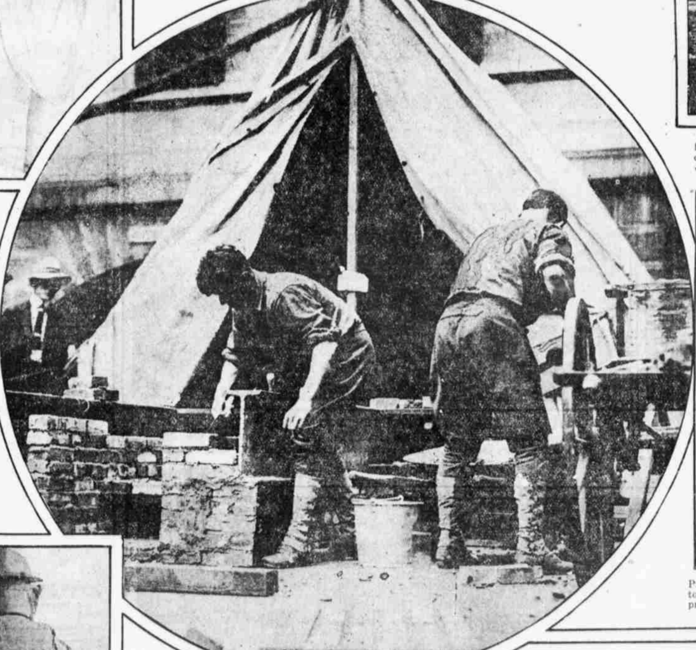
MILITARY BAKE OVEN AT CITY HALL Members of the Ninth Engineers will soon show Philadelphia how the modern hard-tack is made for the city's soldier boys.