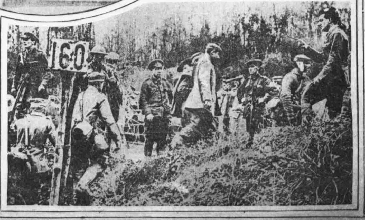
BRITISH COUNTING GERMAN PRISONERS Official photograph taken on the front in France showing soldiers of General Haig's army checking off the long stream of the enemy's forces being brought in after a recent engagement.