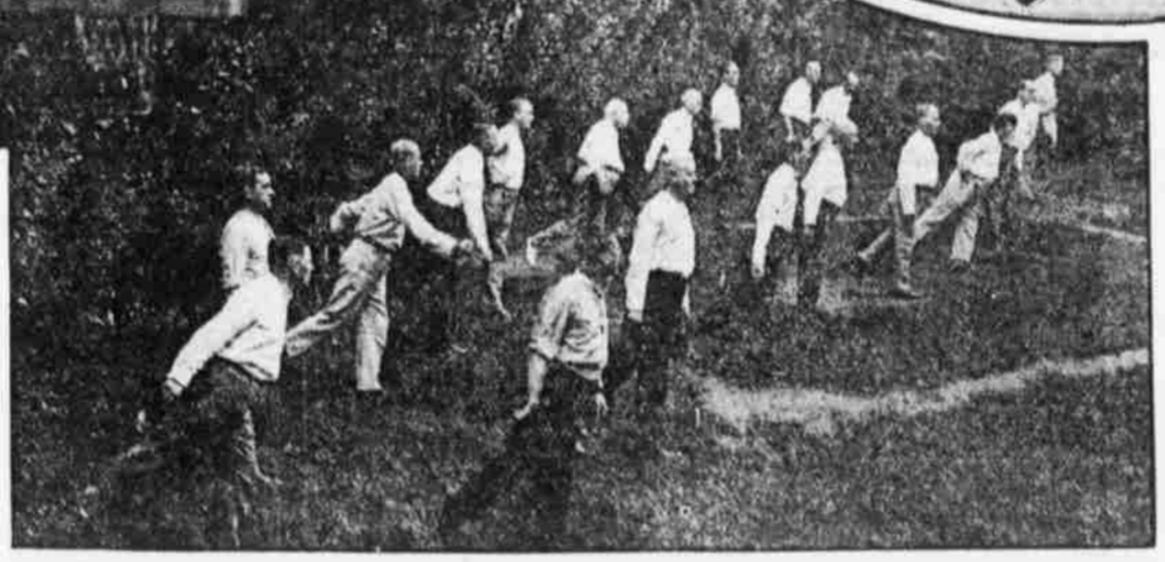
Uncle Sam's departmental heads and assistants at the national capital going through leg exercises under direction of Walter Camp.