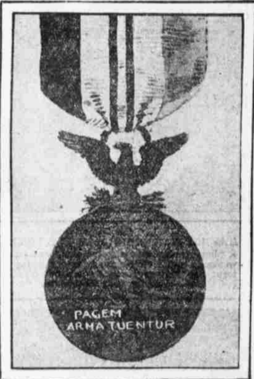
Proposed medal for valor which Congress is asked to make from the metal of two twelve-pound guns presented to the United States by the Marquis de Lafayette.