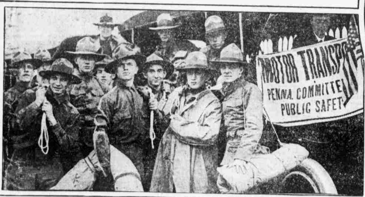
MEMBERS OF BATTERY A ARRIVING AT CAMP A small army of motortruck whirled the Second Artillery out to the rendezvous near Noble.