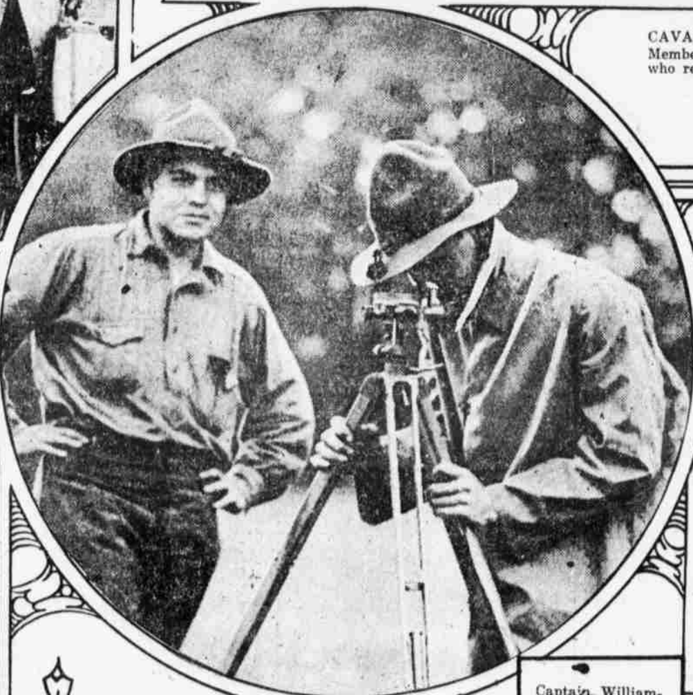
ENGINEERS LAYING OUT A COMPANY STREET These men were members of the advance guard which brought things into shape for the encampment of the Second Artillery near Noble.