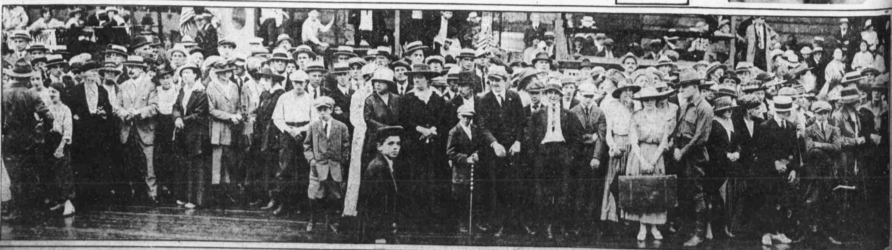
RELATIVES AND FRIENDS OF MEMBERS OF THE SECOND PENNSYLVANIA FIELD ARTILLERY, WHO ASSEMBLED YESTERDAY AT THE REGIMENT'S ARMORY, AT BROAD STREET AND SUSQUEHANNA AVENUE, TO SAY A LAST FAREWELL TO THE ENLISTED MEN ABOUT TO DEPART FOR THEIR FIRST WAR ENCAMPMENT