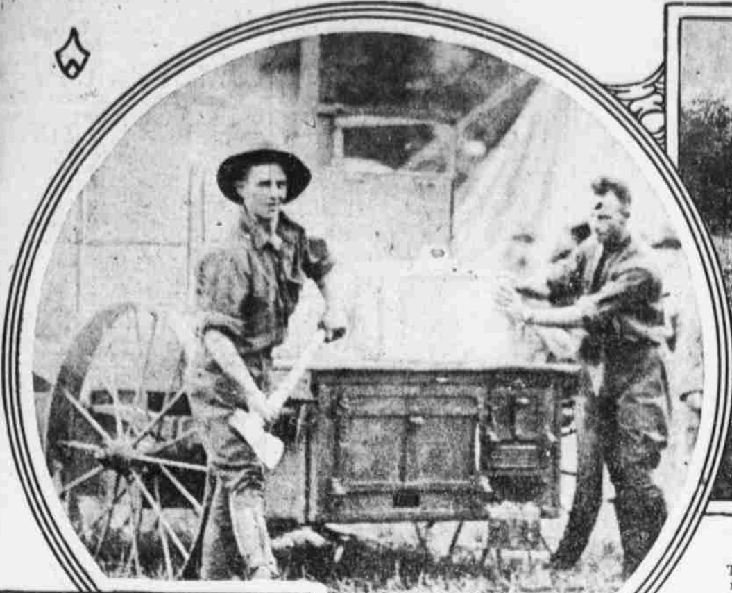
PREPARING THE SINEWS OF WAR The cooks were the pioneers at the encampment of the Second Field Artillery, established yesterday between Noble and Jenkintown.