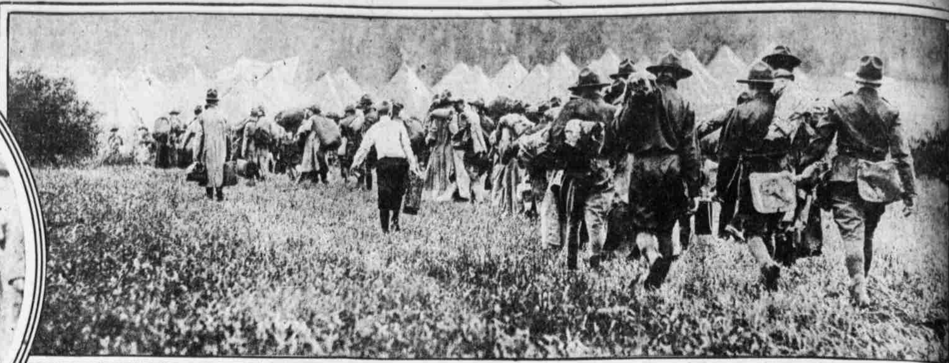
THE ARRIVAL AT CAMP The rendezvous of the Second Artillery near Noble was necessitated by the inadequacy of the regiment's armory, which could not accommodate all the equipment.