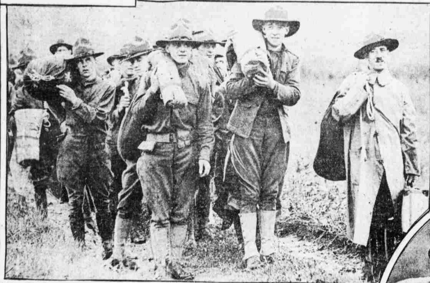
MEMBERS OF THE SECOND ARTILLERY OFF TO THEIR FIRST WAR CAMP A detail of 150 men arrived at Noble in advance of the rank and file and began erecting the canvas.