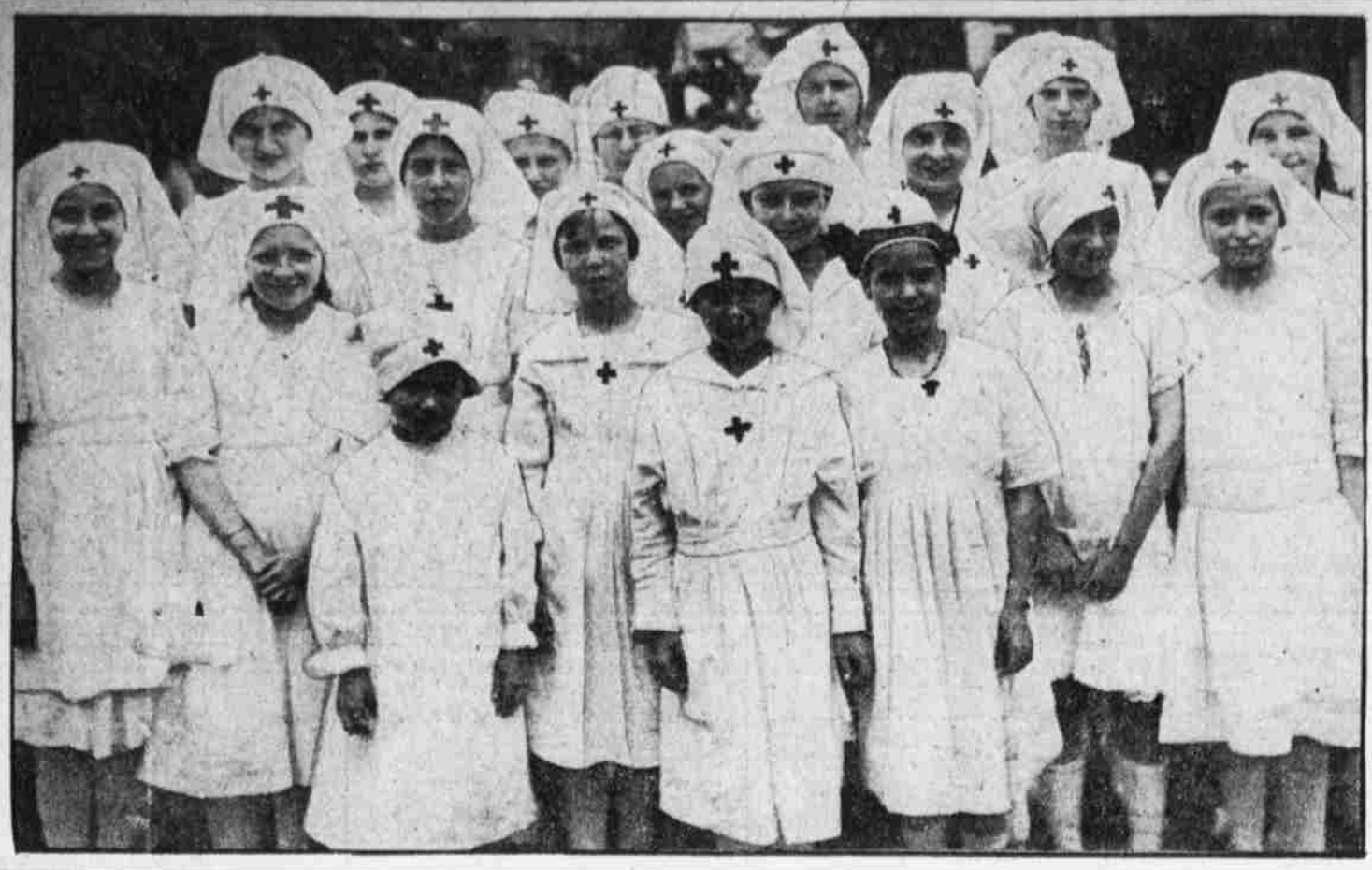
COLLINGSWOOD'S JUVENILE RED CROSS WORKERS