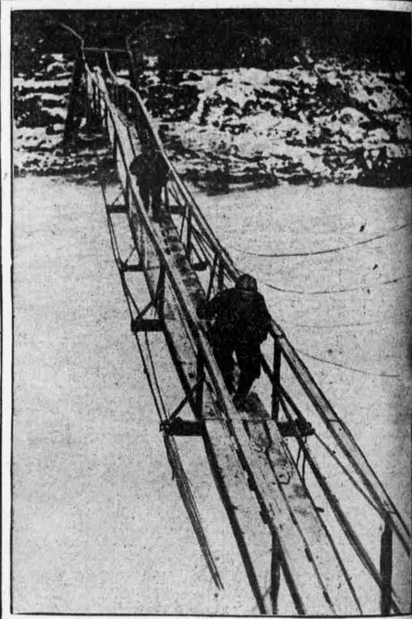
ITALIANS CROSSING THE ISONZO

Scenes such as this at Starr Garden are enacted nearly every day in summer at the various recreation centers throughout the city.