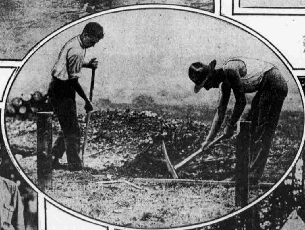
Cadets of the Hill School at Pottstown laying a drain on the outskirts of their encampment.

The photograph well illustrates the difficulties that beset General Cadorna in his operations against the Austrians. In this case he was forced to resort to a swinging bridge to pass the river.