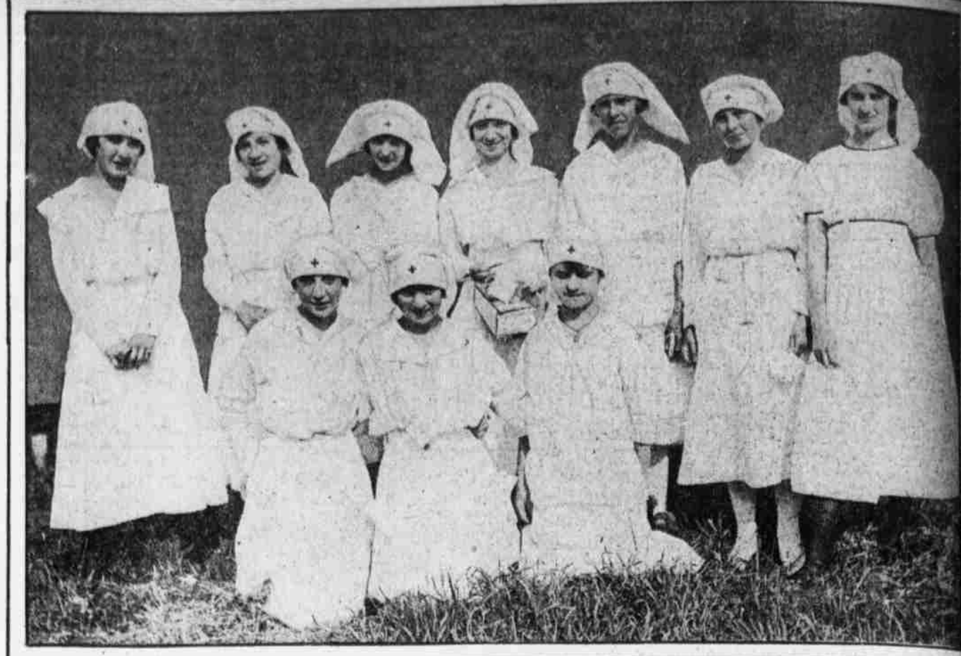
COLLECT TOLL FROM WESTMONT BASEBALL FANS