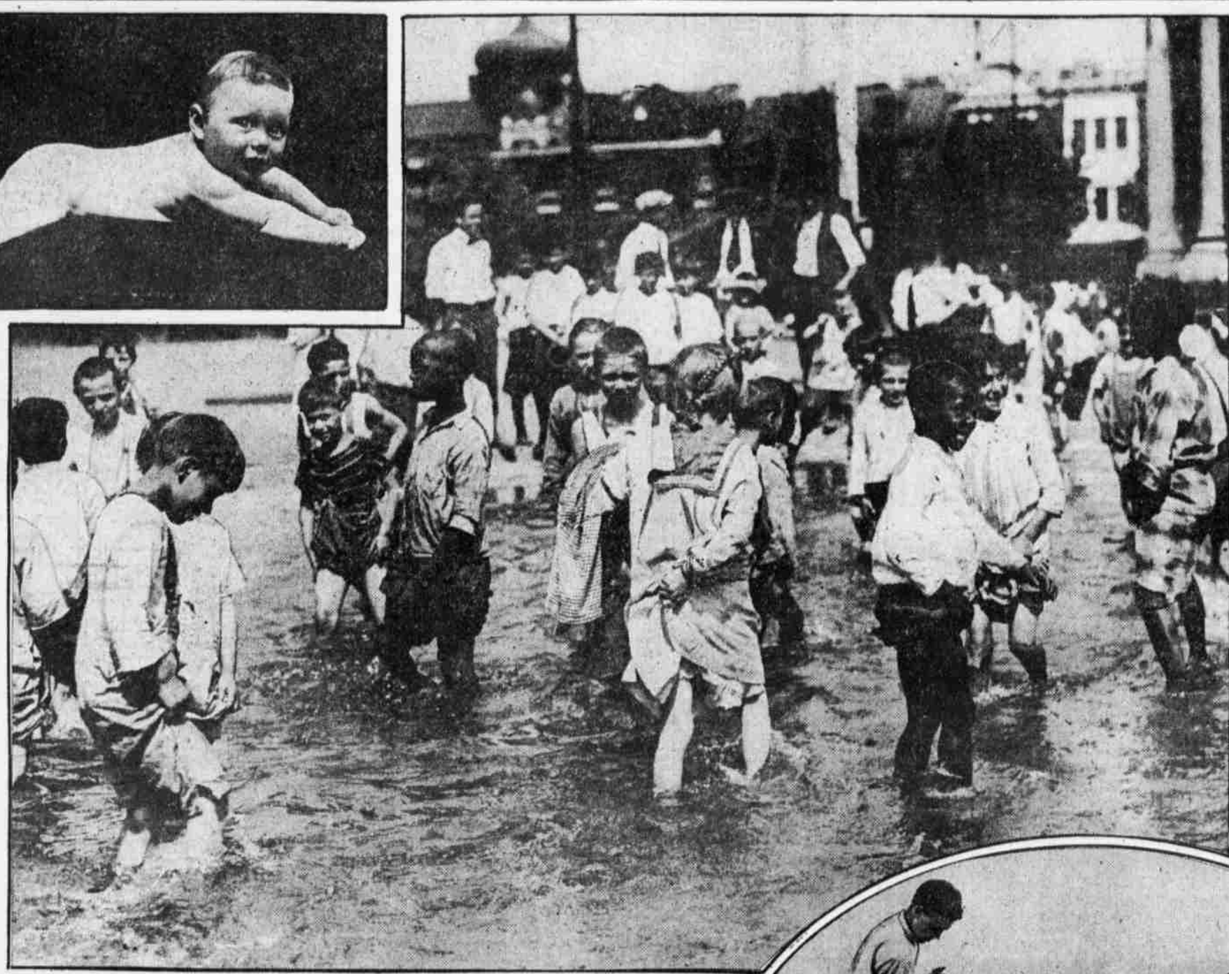
THE OPEN SEASON FOR WADING IS HERE

Scenes such as this at Starr Garden are enacted nearly every day in summer at the various recreation centers throughout the city.