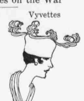
When looking at this hat, one gets the trimming not only coming and going, but sideways as well, for the four clusters of feathers are crossed on top of the hat.

To the Editor of Woman's Page Dear Madam.-Some years ago while in China I secured these recipes which are great favorites there. All of them are delicious, so it thought you might like to publish them in your col-