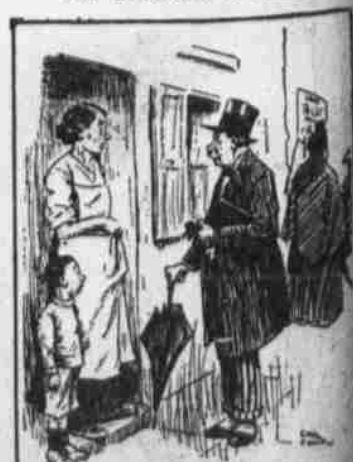
An Uncertain Destination