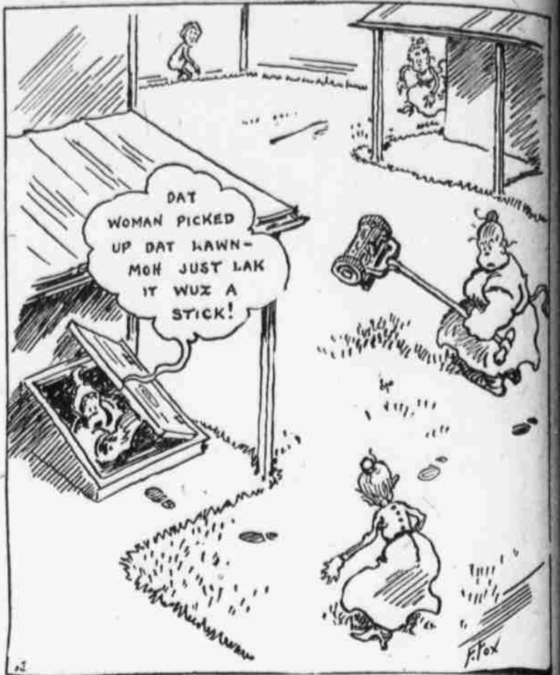
ARABELLA WINTERBLOSSOM, DUSKY VICTOR OF A THOUSAND BATTLES, MEETS HER MATCH IN THE POWERFUL KATRINKA