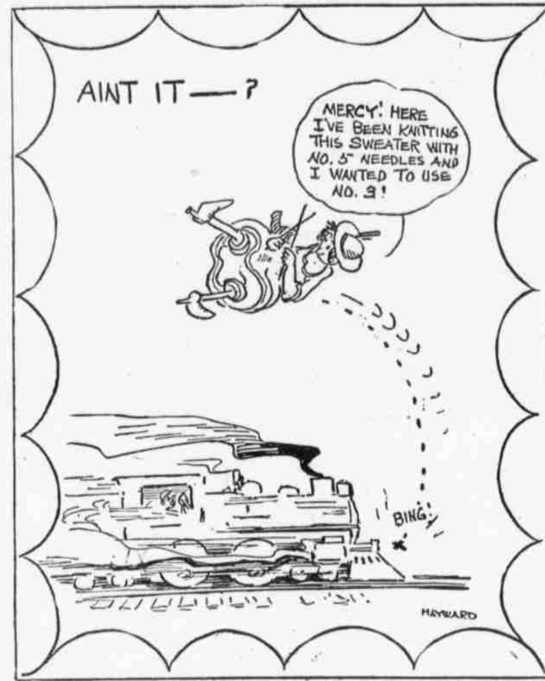
THE PADDED CELL