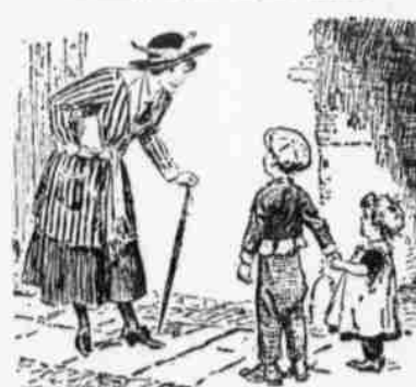
Making Both Ends Meet

—The Passing Show. District Visitor—Tell me, little boy, why are your trousers tied under your boots like that? Little Boy—So that I shan't grow out of them.