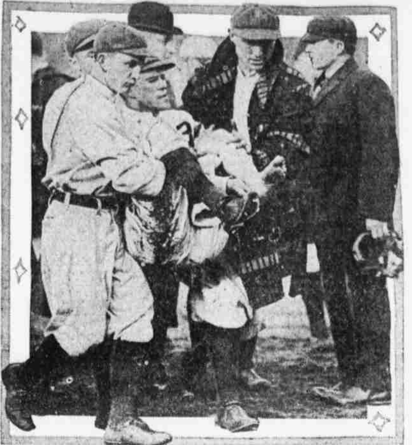
The "most hard luck player in the world" has had many tough breaks on and off the field. In the above picture The Crab is seen being carried from the field by Rabbit Maranville and Fred Mitchell, after Evers had been injured during a game in Boston in 1915.