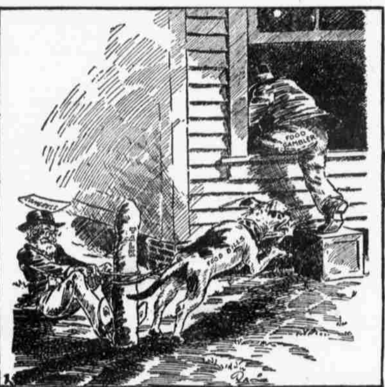
Page, in Nashville Tennessean. PROTECTED