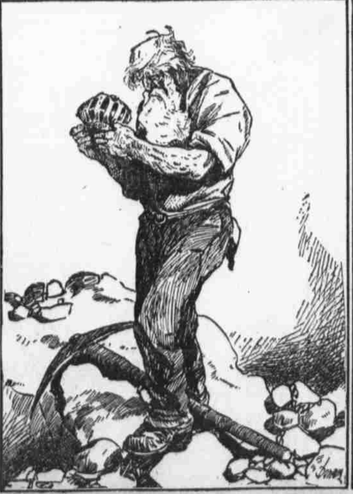
Donaher, in Cleveland Plain-Dealer. THE DOOM OF AUTOCRACY