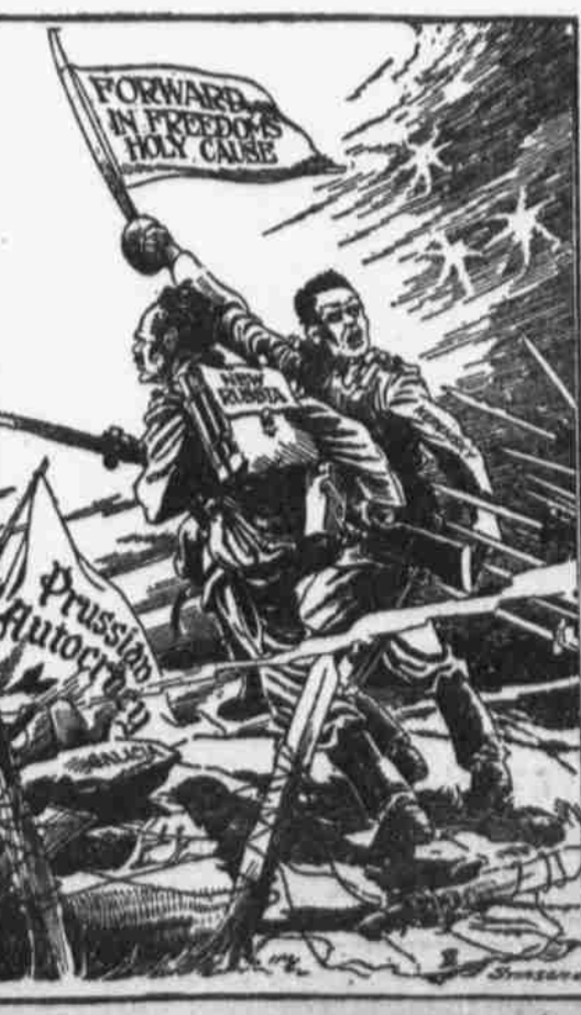
Stinson, in Dayton Daily News. THE MAN OF THE HOUR