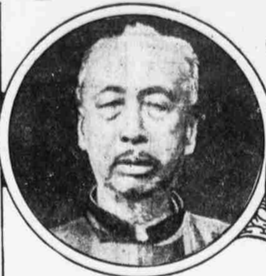
HIS DREAM OF EMPIRE BLASTED General Chang Hsun's short-lived rebellion to restore the boy emperor to the throne of China ends in complete defeat and a price of $100,000 on the leader's head.