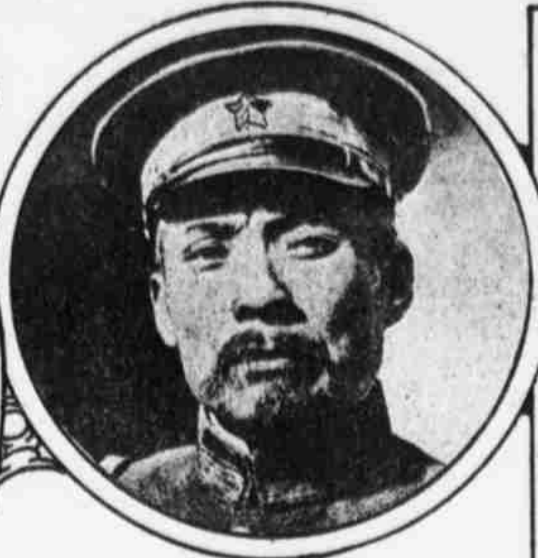
LEADER OF REPUBLICAN FORCES Yuan Chi Jul, as prime minister of China, has been one of the foremost opponents of the restoration to the throne of the boy emperor of that troubled nation.