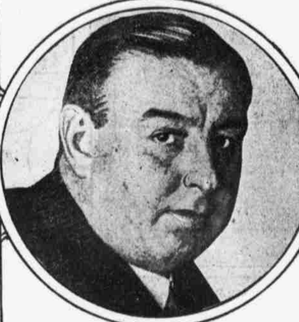
MAYOR FACES IMPEACHMENT Recent developments in the municipal affairs of Chicago are directed by the opponents of William Hale Thompson against the chief executive of the Windy City and formal proceedings looking to his unseating are being suggested.