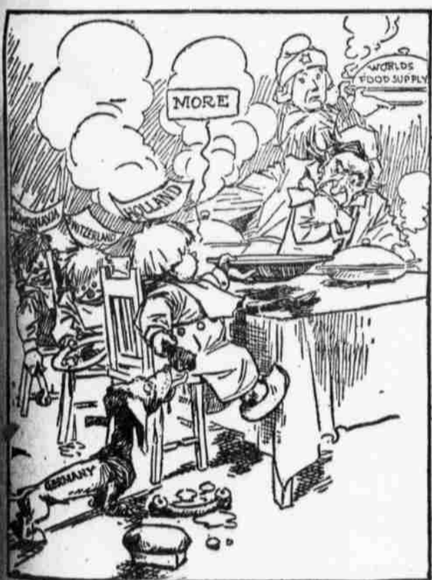
Darling, in Washington Herald. HIGH TIME TO ENFORCE THE FOOD EMBARGO