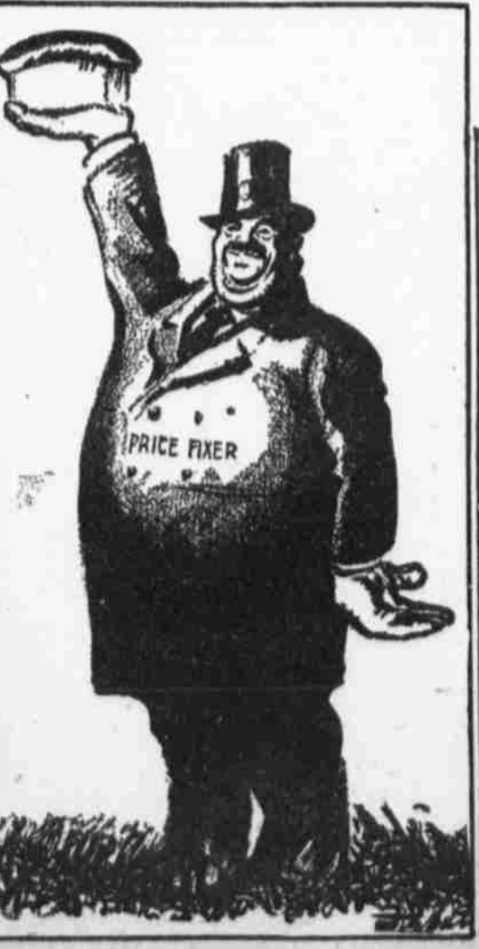
Fitzpatrick, in St. Louis Post-Dispatch. OUR PRESENT FOOD CONTROLLER