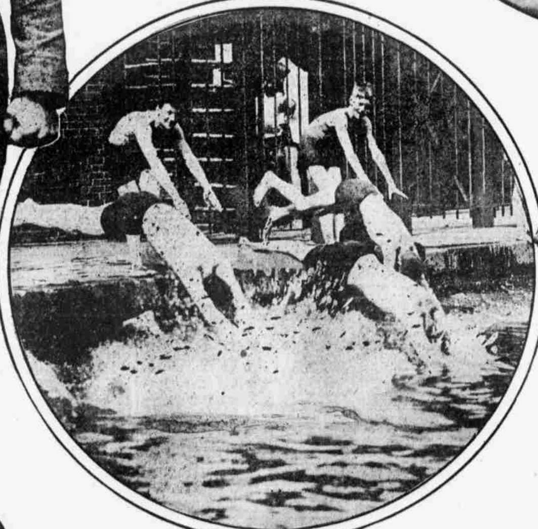
A "COMMUNITY DIVE" AT ONE OF THE CITY'S HEALTH CENTERS There is no end of fun to be had these summer days in the delightful pool at the Sherwood Recreation Center, where the photograph was taken.