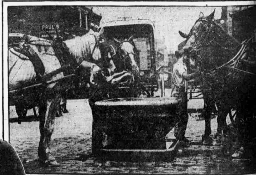
THERE ARE FEW HAPPY MOMENTS IN THE LIFE OF A WORKING HORSE, AND THIS PAUSE AT A PUBLIC TROUGH IS ONE OF THEM