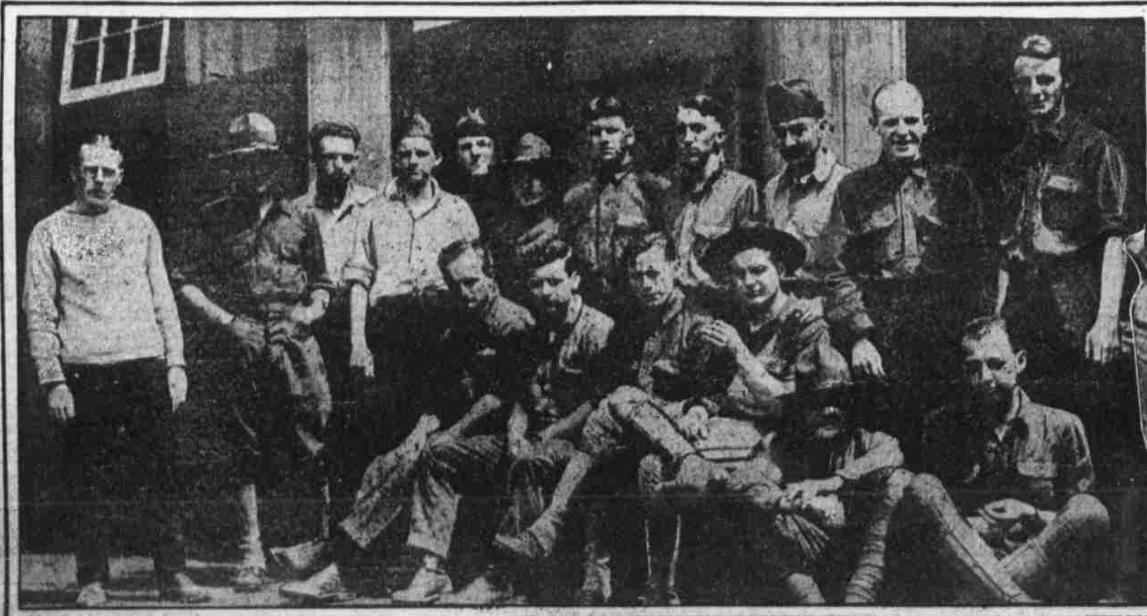
"BIG RED" UNIT AT THE ALLENTOWN TRAINING CAMP These Cornell men are among the college students in training for ambulance work in France.