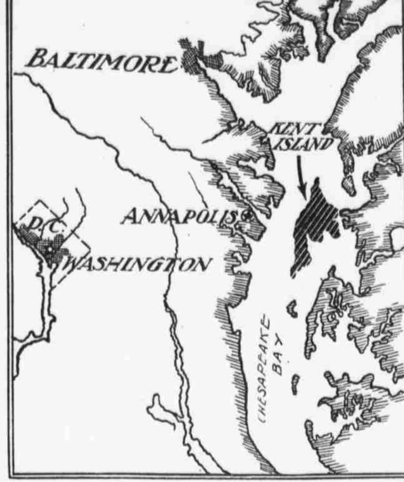
Kent Island, in the Chesapeake Bay, has been selected by Government officials as a proper site for a proving ground...