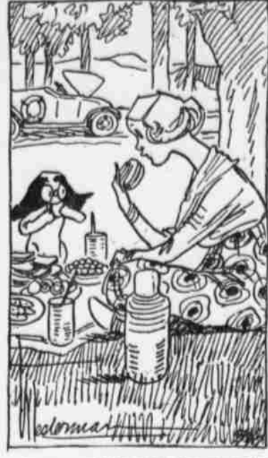
The Young Lady Across the Way

The young lady across the way says that nothing is more important in this country right now than to put the food supply under thorough manipulation.