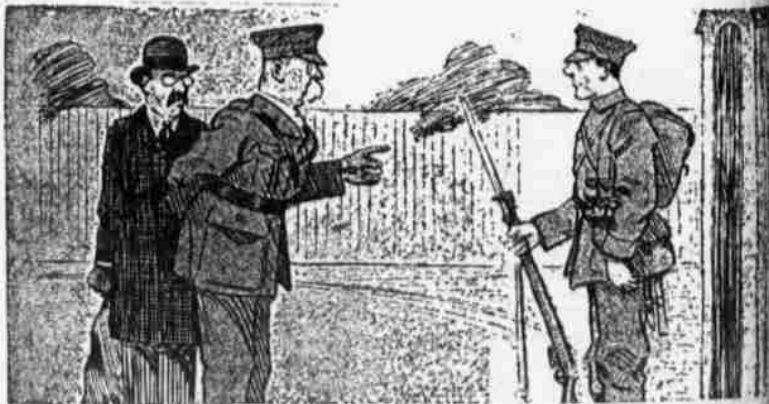
TIT FOR TAT

Colonel (to Tommy, who has bayoneted a local tradesman's dog)—But why didn't you use the butt end of your rifle? Tommy—Well, sir, w'y didn't 'e bite me wiv 'is tail!