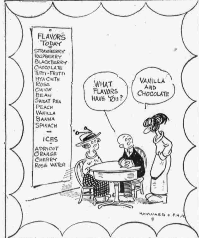
THE PADDED CELL

Absolutely "Has he a sense of fairness?" "Goodness, yes! He can tell them a block away."—Gargoyle.