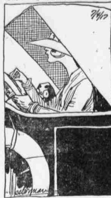
The Young Lady Across the Way

The young lady across the way says she saw in the paper that bean balls were served to the visiting team yesterday and she supposes they're at least nourishing.