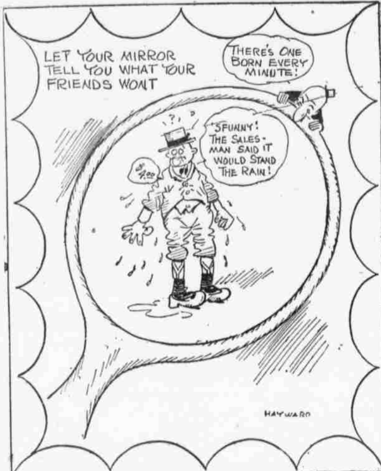
THE PADDED CELL

LET YOUR MIRROR TELL YOU WHAT YOUR FRIENDS WANT