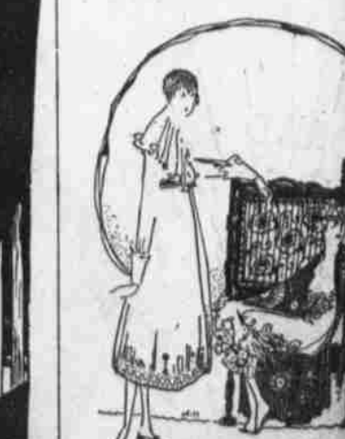
The Proof of the Pudd

Anna—Is your new suitor safe? Belle—Well, I should say so; five courses at dinner. Safe Isn't he rather fast, dear? The anxious mother. Yes, mamma, replied the but I don't think he will get