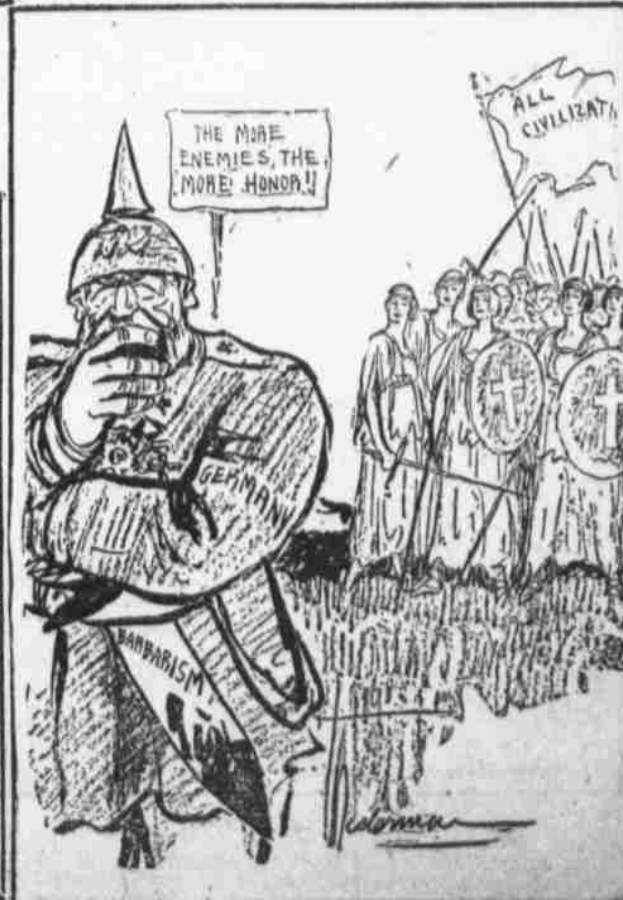
Westerman, in Ohio State Journal.

"WAIT, SAM: I'LL PUT UP THE WHITE FLAG!"