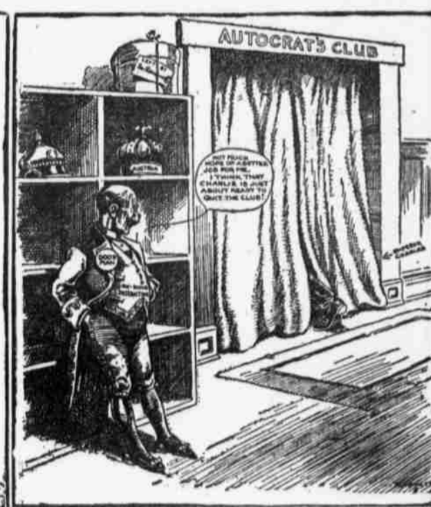
Barnett, in Los Angeles Express.