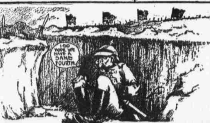
Brown, in Chicago Daily News.