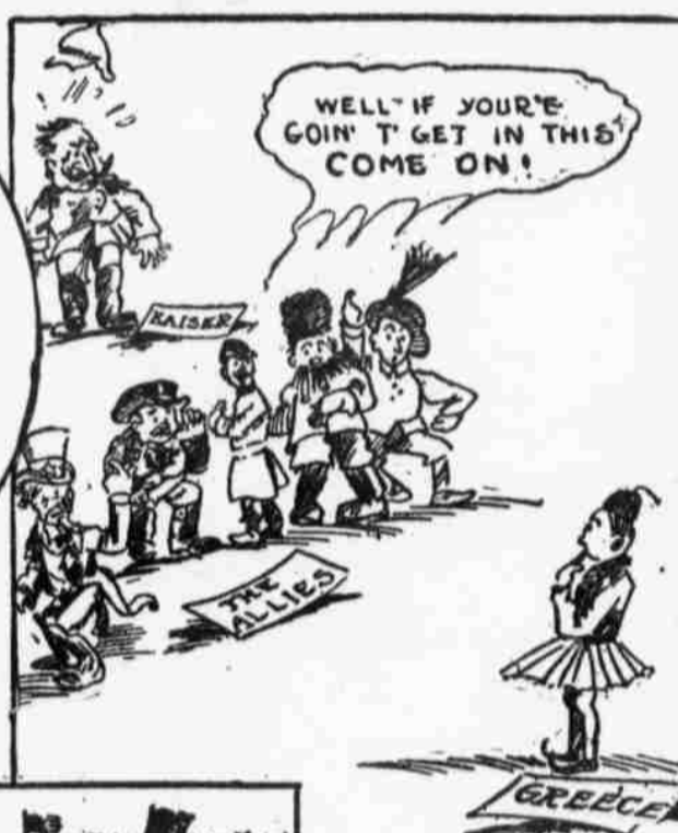
Raymond, in New Orleans Daily States.