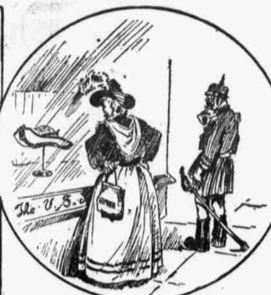
Tuffill, in St. Louis Star.