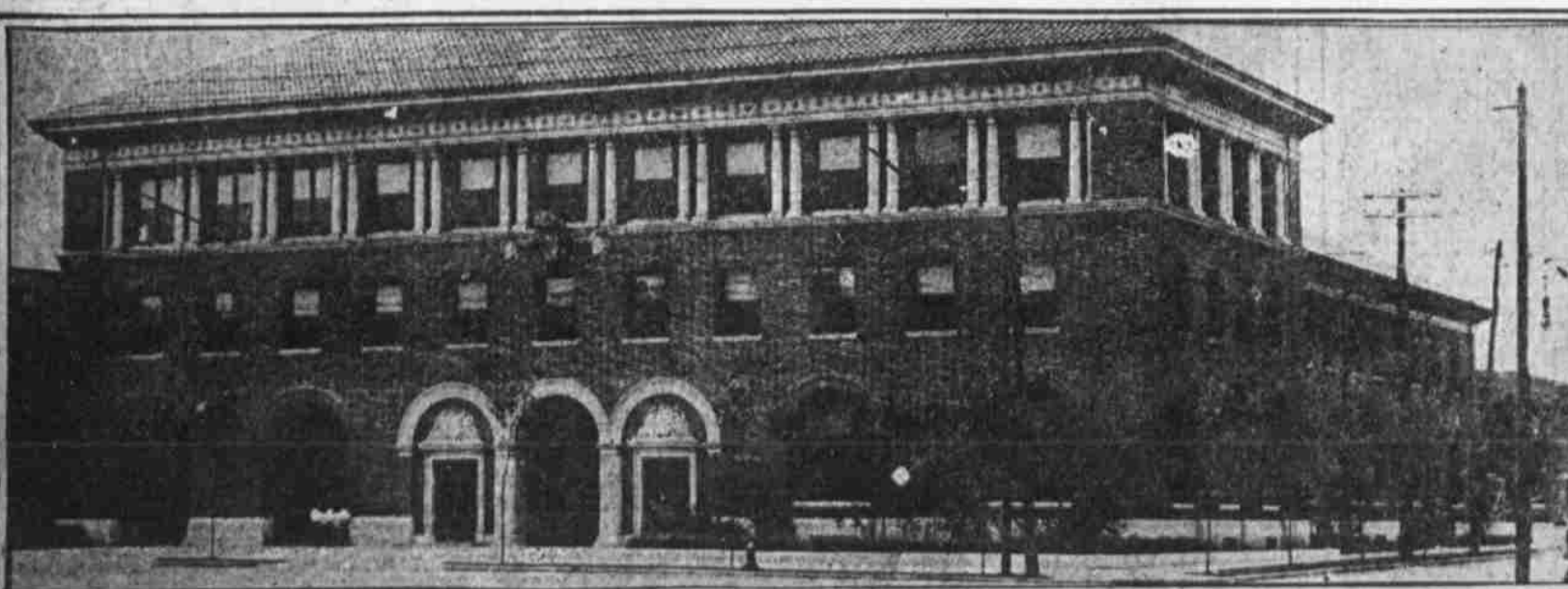
LATEST LINK IN CITY'S NEW SYSTEM OF STATION HOUSES IS OPENED

The large photograph shows how the instructress plays with the children at the new Belfield grounds, Twenty-first and Nedro streets. In the circle two youngsters are enjoying the swings at Stenton Park, Sixteenth street and Wyoming avenue.