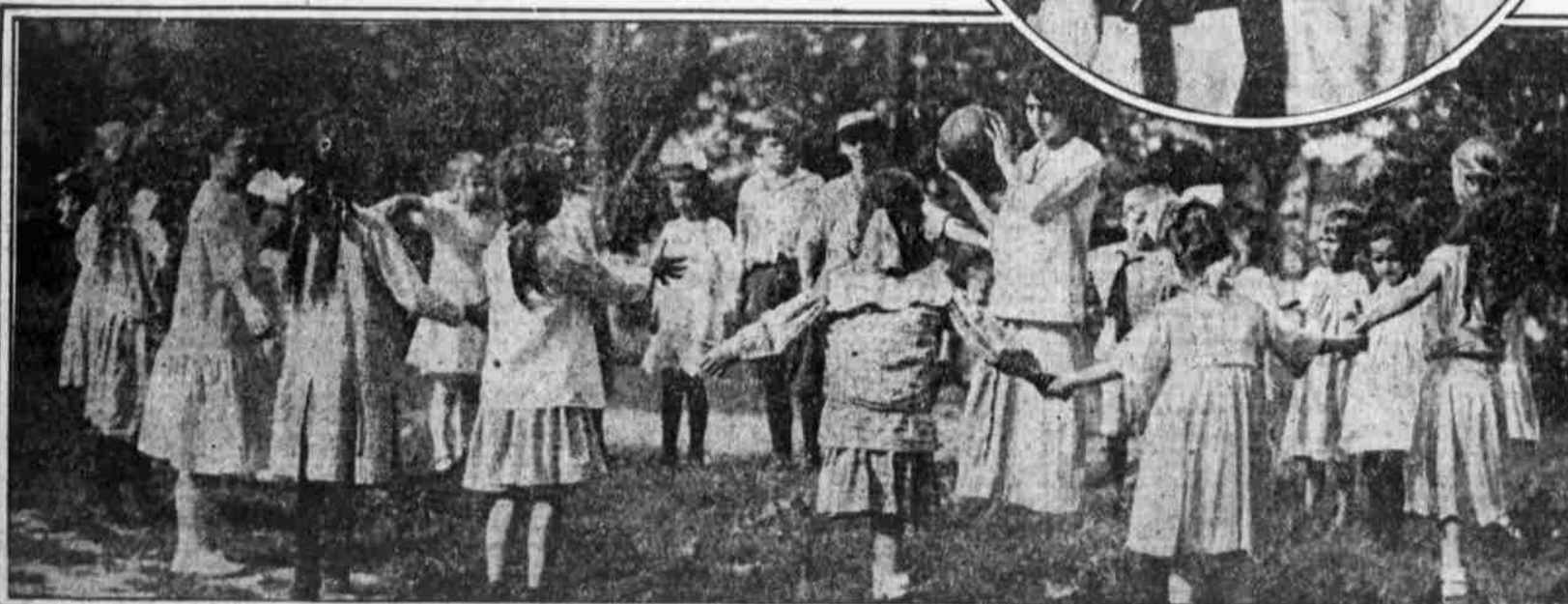
NEW PLAYGROUNDS HELP CHILDREN ENJOY SUMMER'S HOT DAYS

The large photograph shows how the instructress plays with the children at the new Belfield grounds, Twenty-first and Nedro streets. In the circle two youngsters are enjoying the swings at Stenton Park, Sixteenth street and Wyoming avenue.