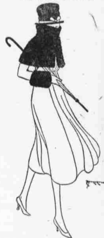
Play Titles Travestied

"The Blindness of Virtue." —Cornell Wilton.