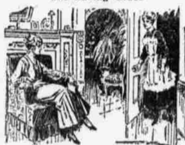
The Saving Grace

The Passing Show Wartime Economy Enthusiast—Just tell James to get the motor ready—I want to run down to the public library to see the evening papers.