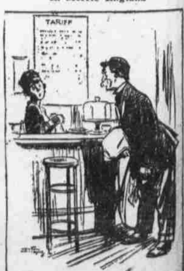
In Merrie England

London Opinion The Beery One—I can't have any fancy cakes? Attendant—No. They use up the nation's grain and sugar. The Beery One—Oh! and as beer uses up sugar and grain, I can't have any more beer, I suppose? Attendant—Oh, yes! Plenty more beer, sir.