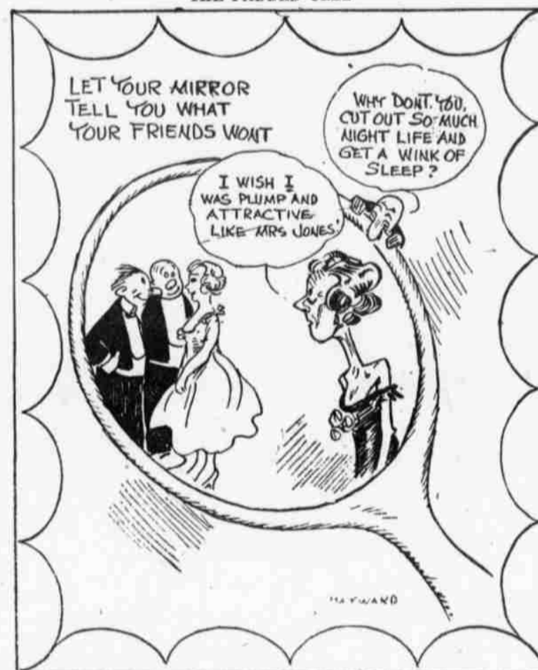
THE PADDED CELL

A Loyal Traitor The German nation now to aid will cause disapprobation; Still we intend with hoe and spade To assist the germination. —Boston Transcript.