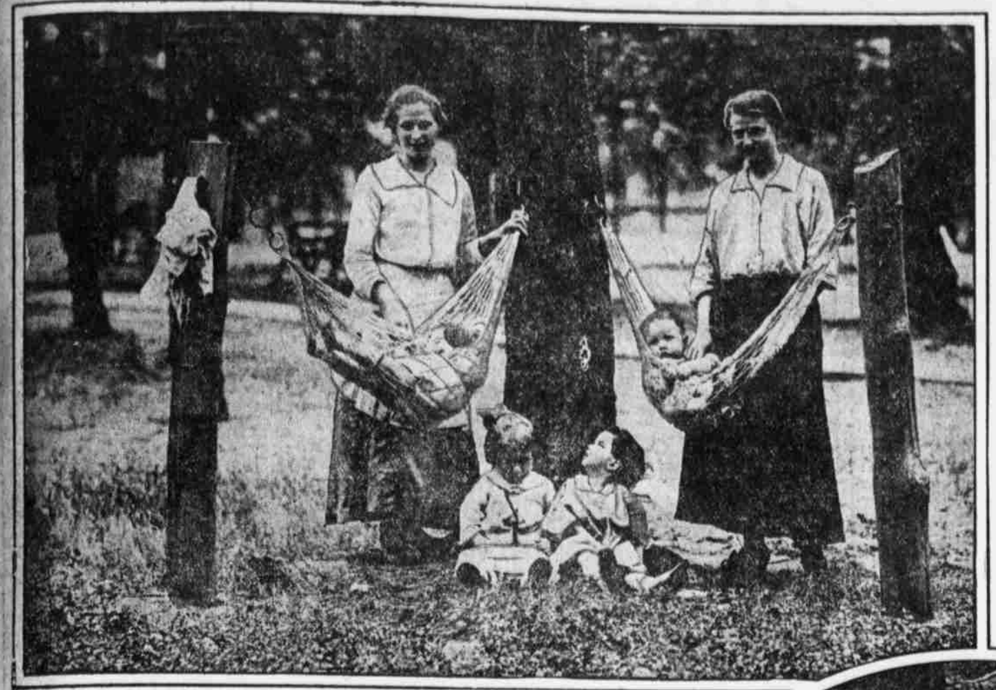
"MOTHERS' CORNER" AT THE RED BANK SANATORIUM A hammock swung from shady trees and swayed by cool river breezes combats the infant mortality wrought in sun-baked, brick-walled courts and stuffy tenements.