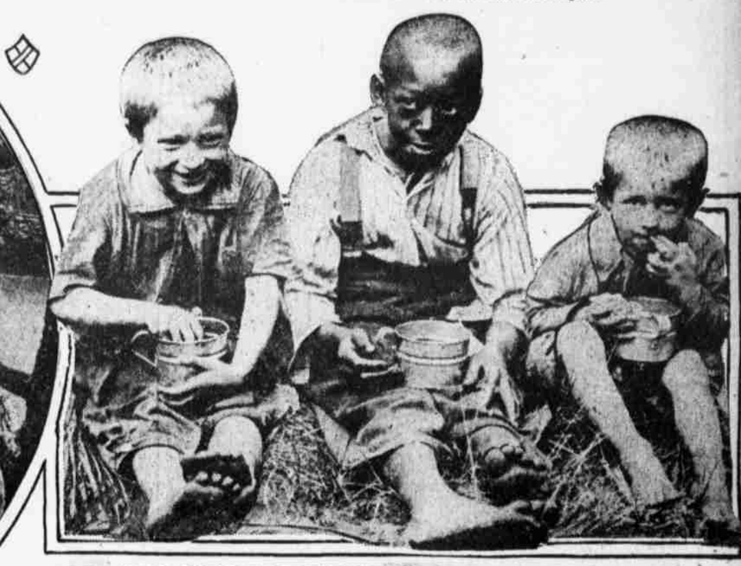
"GEE! THESE EATS CERTAINLY MAKE YOU FORGET IT'S HOT" In no spirit of derision is the nickname "Soupy Island" bestowed upon Red Bank by its juvenile patrons.