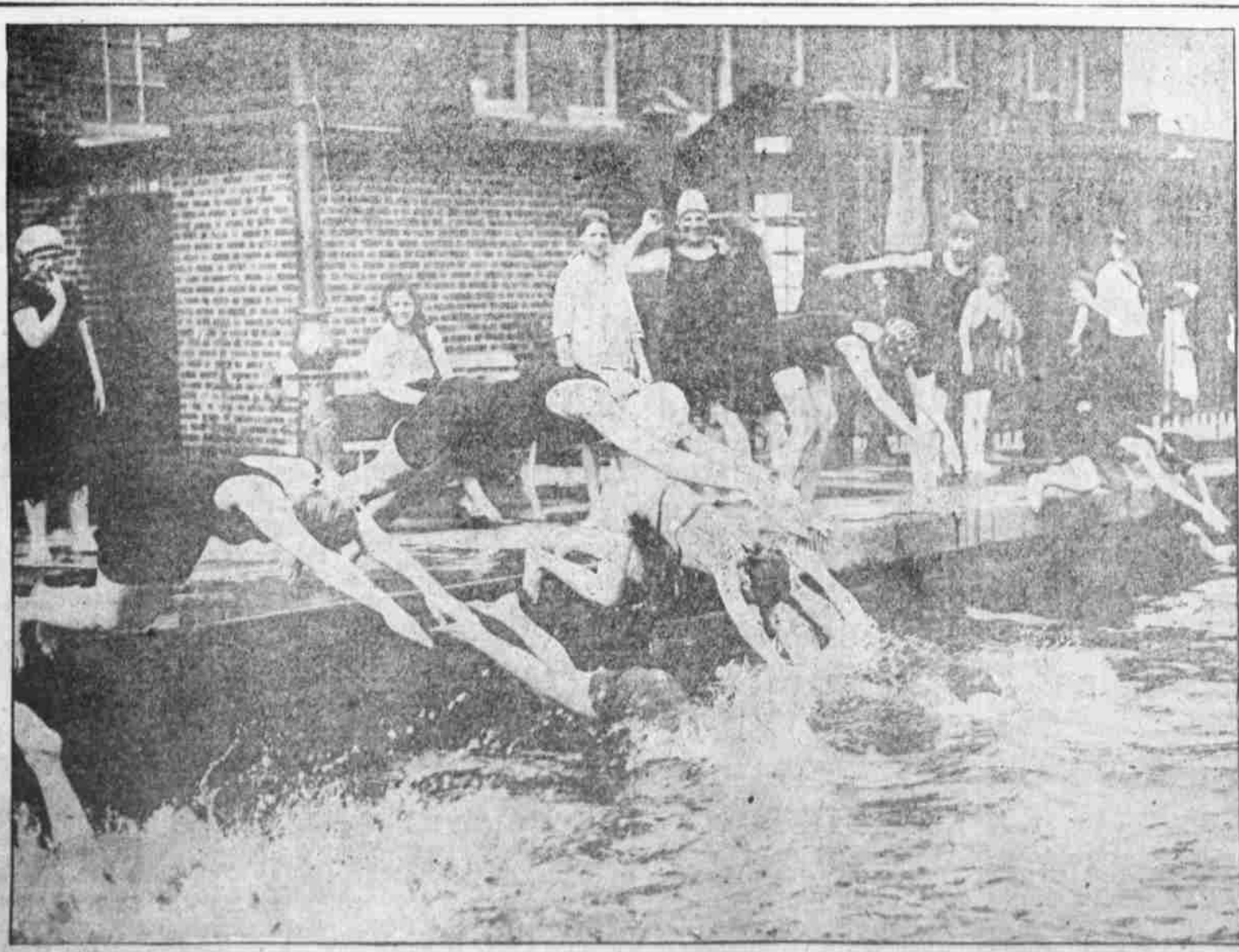
NOT EVEN THE SEASHORE CAN WEAN AWAY THESE NAIADS FROM WEST PHILADELPHIA. These warm July days find full attendance at the swimming classes that are conducted to the combined health and instruction of pupils at the Sherwood Recreation Center.