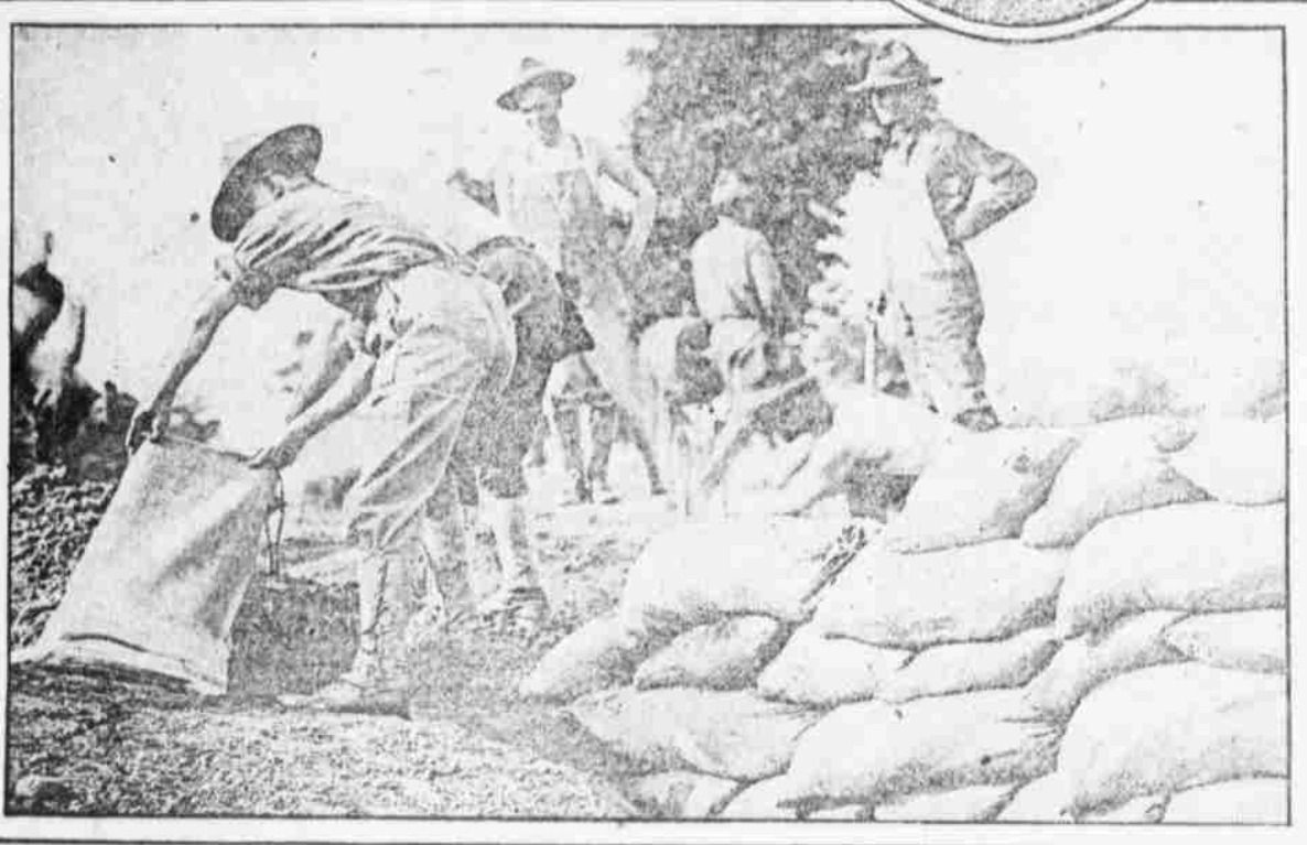
ERECTING A BARRIAGE OF SANDBAGS AT THE FORT MYER TRAINING CAMP. Recruits for the Officers' Reserve Corps from New Jersey and Delaware are rapidly acquiring one of the rudiments of field warfare, that a soldier's first duty is to take care of his own safety when in the presence of the enemy.