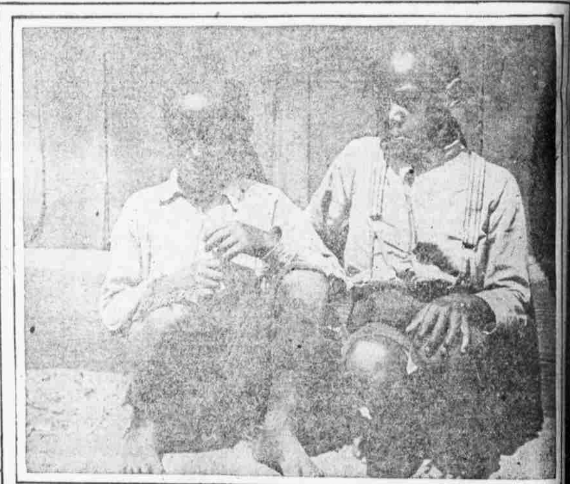
"AWAY DOWN SOUTH IN DIXIE" THEY ALL WOULD FEEL AT HOME. Three denizens of the "Swampy River" district, two of whom are happy residents of Philadelphia, the alligator, by the way, was the cause of a brief reign of terror when it escaped from a pen at the Washington and Pine streets station, where it was being taken for safekeeping.