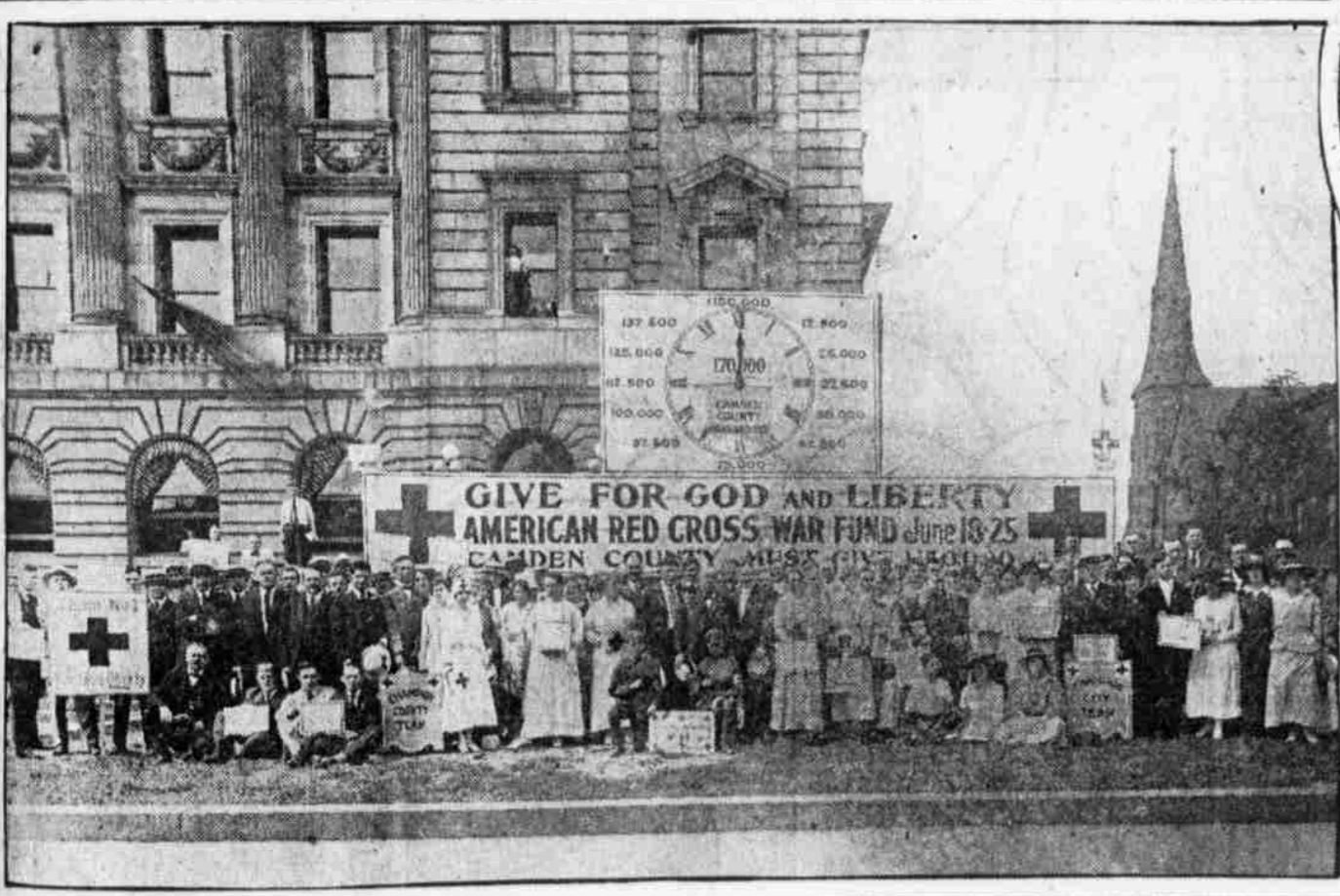
CAMDEN COUNTY'S VICTORIOUS RED CROSS TEAM First photograph of the competent collectors whose zeal carried them $25,000 past the $150,000 goal set up for the county.