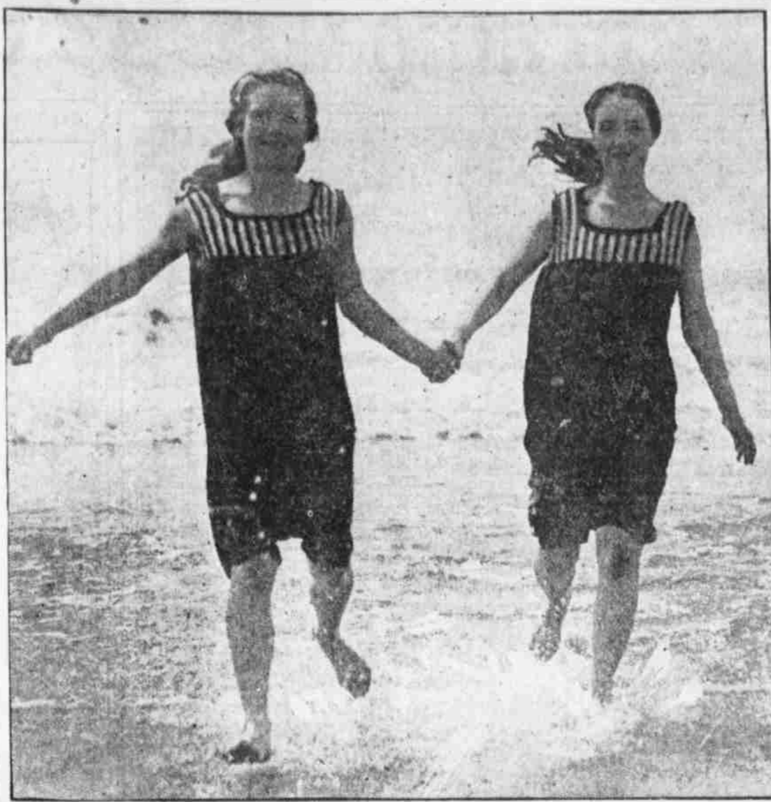
A DASH THROUGH THE SURF ON A HOT SUMMER DAY IS ONE OF THE DELIGHTS AT THE SHORE