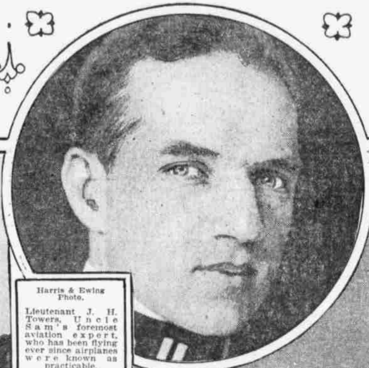
Lieutenant J. H. Towers, U. S. N., is one of the foremost aviation experts who has been flying ever since airplanes were known as practicable.