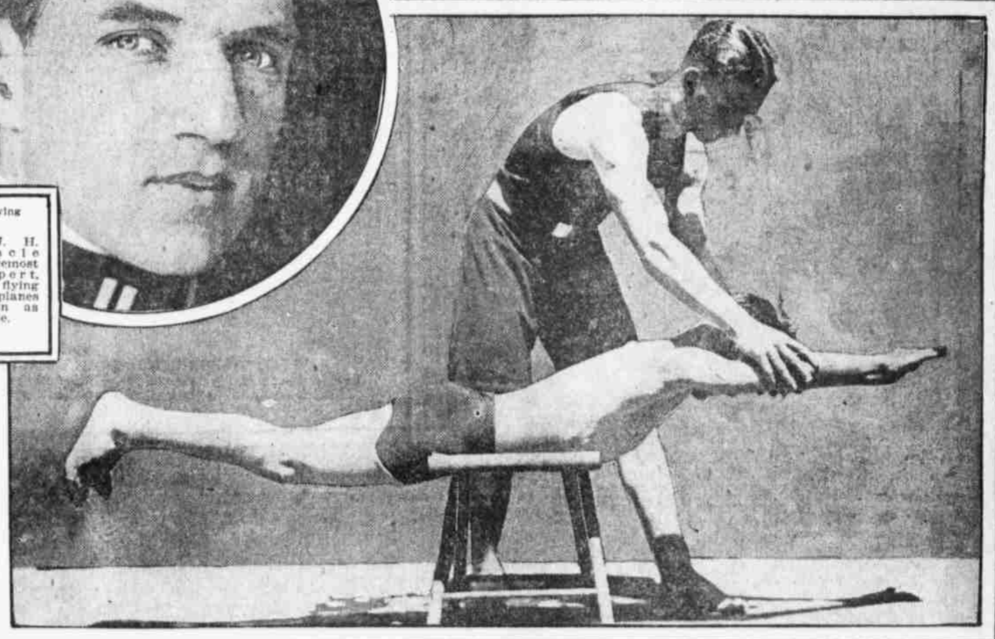
SUMMER SEASON IN FULL SWING AT CITY'S PUBLIC BATH HOUSES The photograph shows a swimming instructor at the Twelfth and Reed streets bath outlining the early strokes for a beginner in the natorial science.