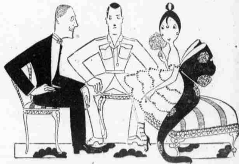
THE POOR SOLDIER

Civilian—Were you seriously injured? Soldier—Yes, sir, nose, sir.