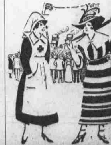
The Latest Paris Fashions