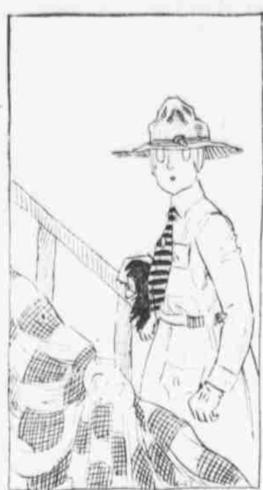
The Young Lady Across the Way

The young lady across the way says the Lately Bands pay only 25c per cent interest. But of course you can't expect as large an income as if they'd been issued in time of peace.