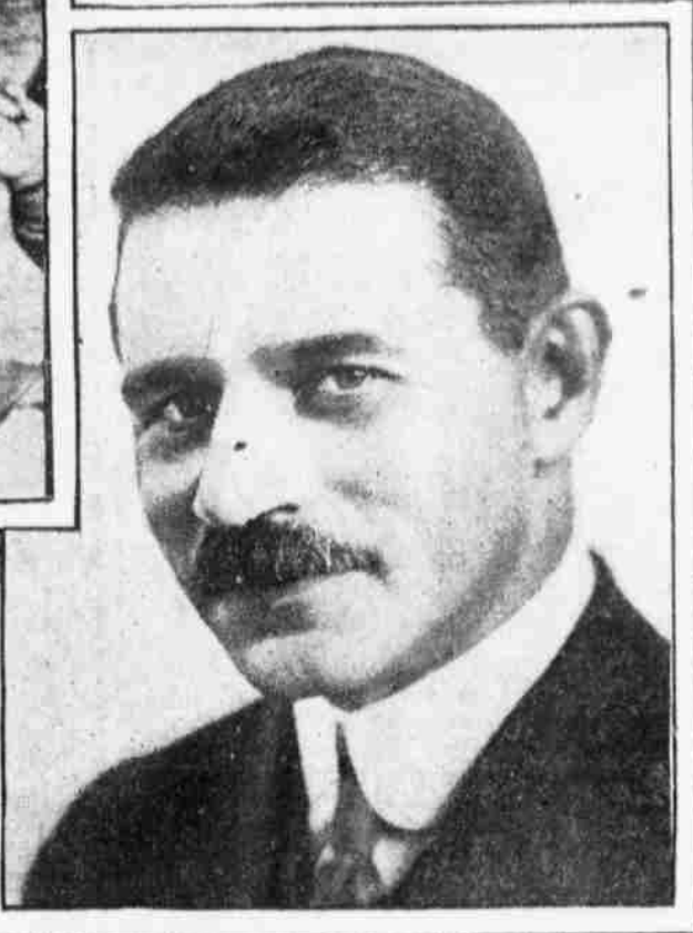
A SOCIALIST OF INTERNATIONAL IMPORTANCE Morris Hillquit is at Atlantic City, recuperating from a nervous breakdown. He scouts the idea that the German Socialists will use the international conference at Stockholm to further the aims of the Kaiser.