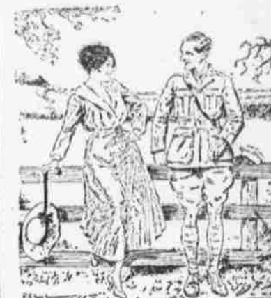
Her National Duty

"Would you mind if I were to kiss you?" "Well, I'm not one of those conscientious objectors, if that's what you mean." —London Opinion.