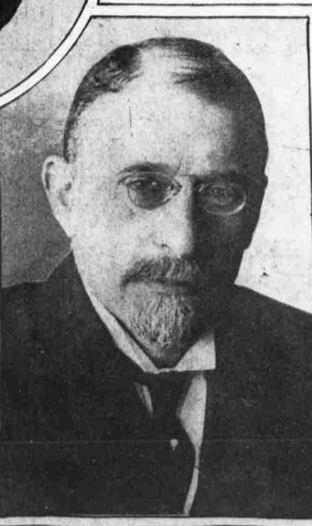
AN AMERICAN MOSES OF TODAY Henry Morganthau, it is announced, is to head an American mission to Egypt, the work of which will be to "ameliorate the condition of the Jewish communities in that country."