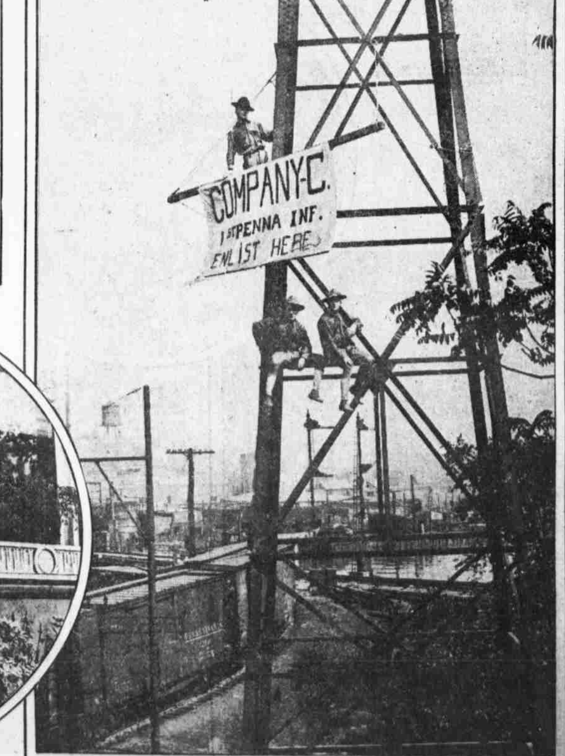
BLINDNESS IS THE ONLY EXCUSE HERE Company C, First Regiment, N. G. P., is taking no chances of not being seen in its recruiting campaign. A squad of men has hoisted this emblem on the Philadelphia Electric Company's tower at Forty-fifth street and Grays Ferry road.