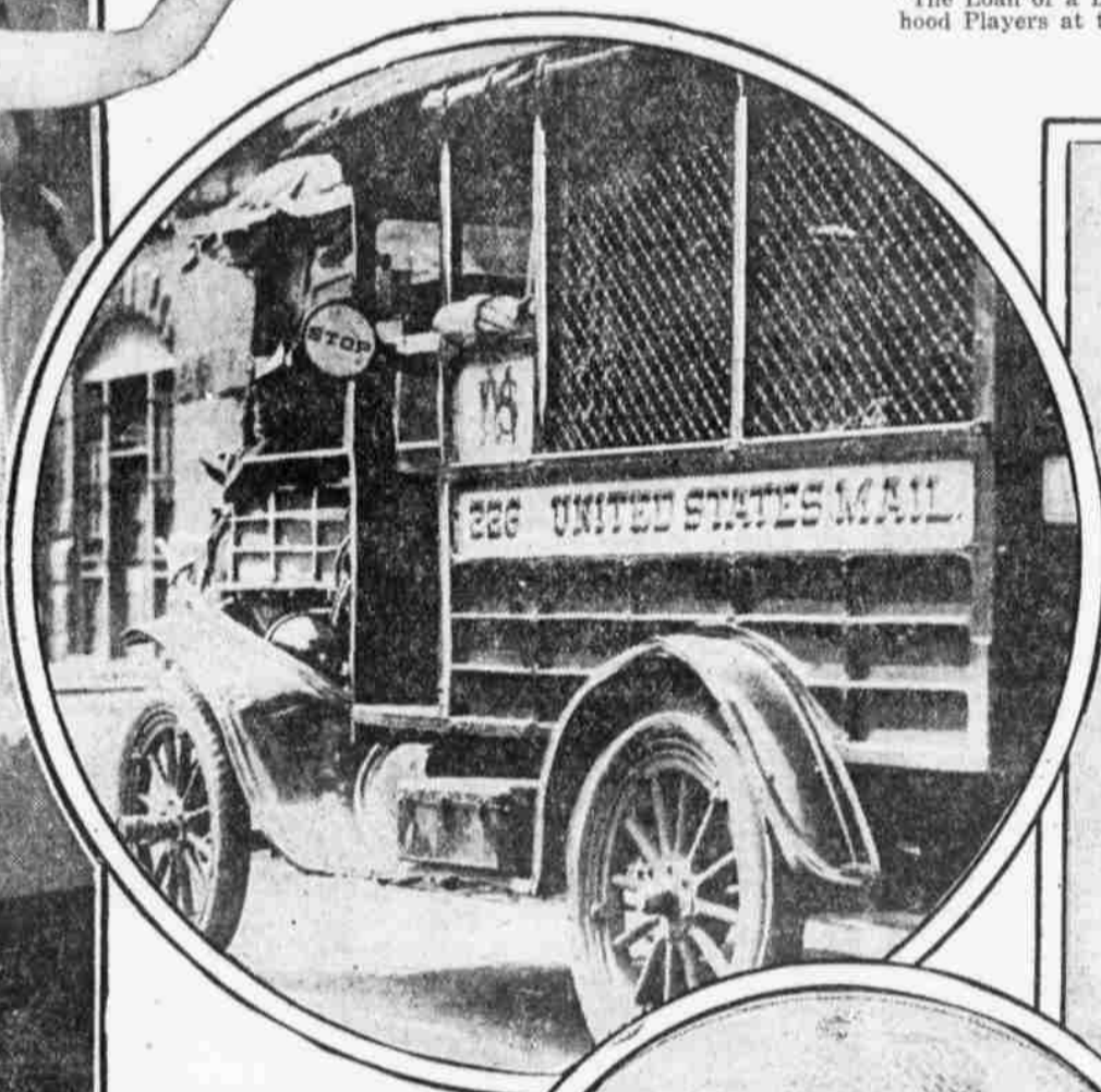
NEW SAFETY DEVICE ON U. S. MAIL AUTO TRUCKS