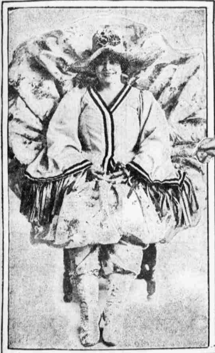
SHE'S HERE WITH HER BROAD SMILE Trixie Friganza, who is at the Adelphi Theatre in "Canary Cottage," is famous for her broad smile, which she bestows lavishly upon the audiences that visit the first all-summer show in Philadelphia.