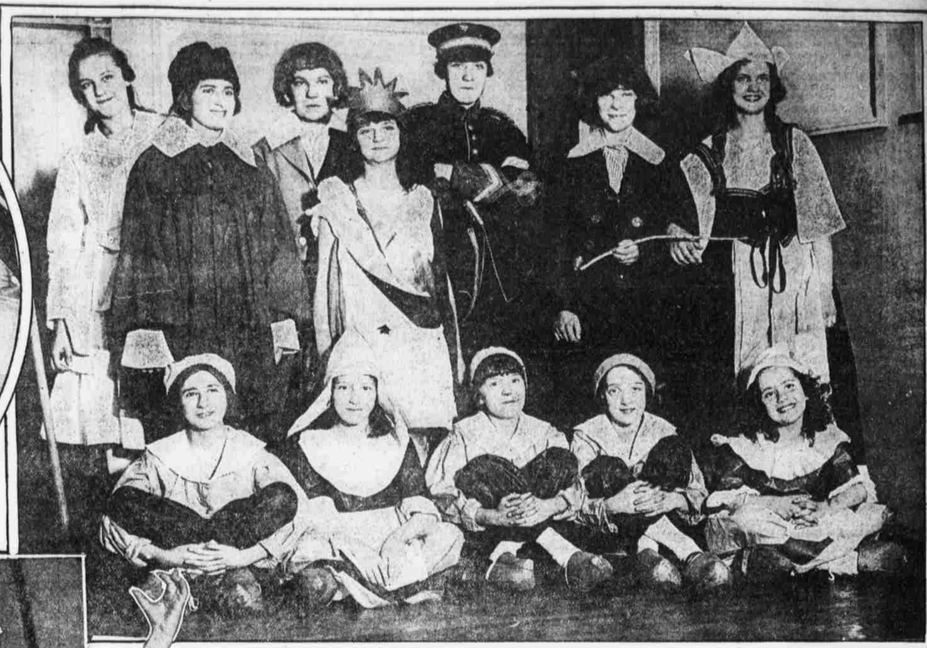
SOUTHWARK PLAYERS IN COMEDY "The Loan of a Lover" is the name of the comedy given by the Southwark Neighborhood Players at the Settlement Music School Saturday night. The photograph shows the cast before the play.