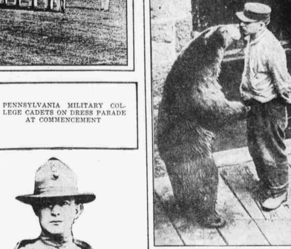
RUSSIA HAS CAST OFF THE RESTRAINT OF AUTOCRATIC GOVERN-MENT, BUT THE RUSSIAN BEAR AT THE ZOO ACKNOWLEDGES AFFECTIONATELY HIS SUBMISSION TO A RULE IN WHICH HE HAS NO VOICE