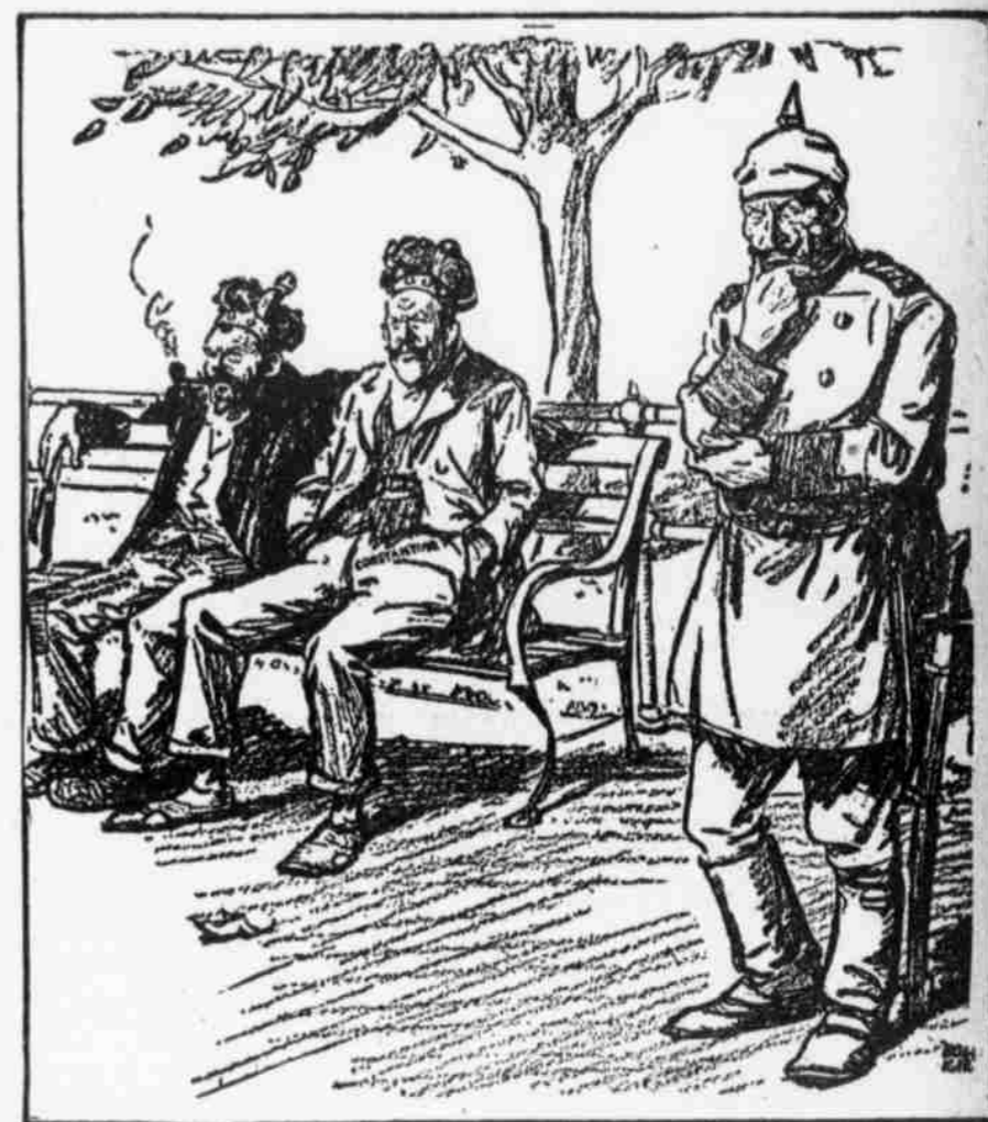
"I REMEMBER THOSE BOYS WHEN THEY BOTH HAD GOOD JOBS"