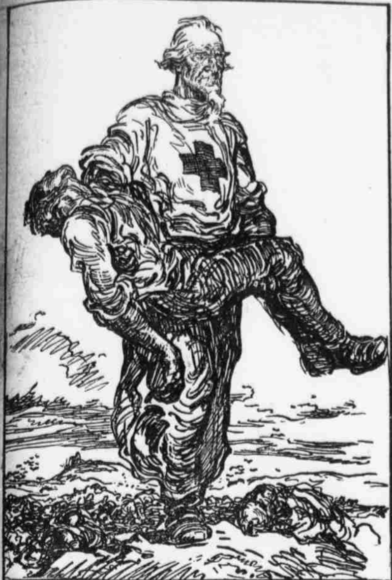
By Cesare, Copyright 1917 by New York Evening Post. YOU HELP HIM