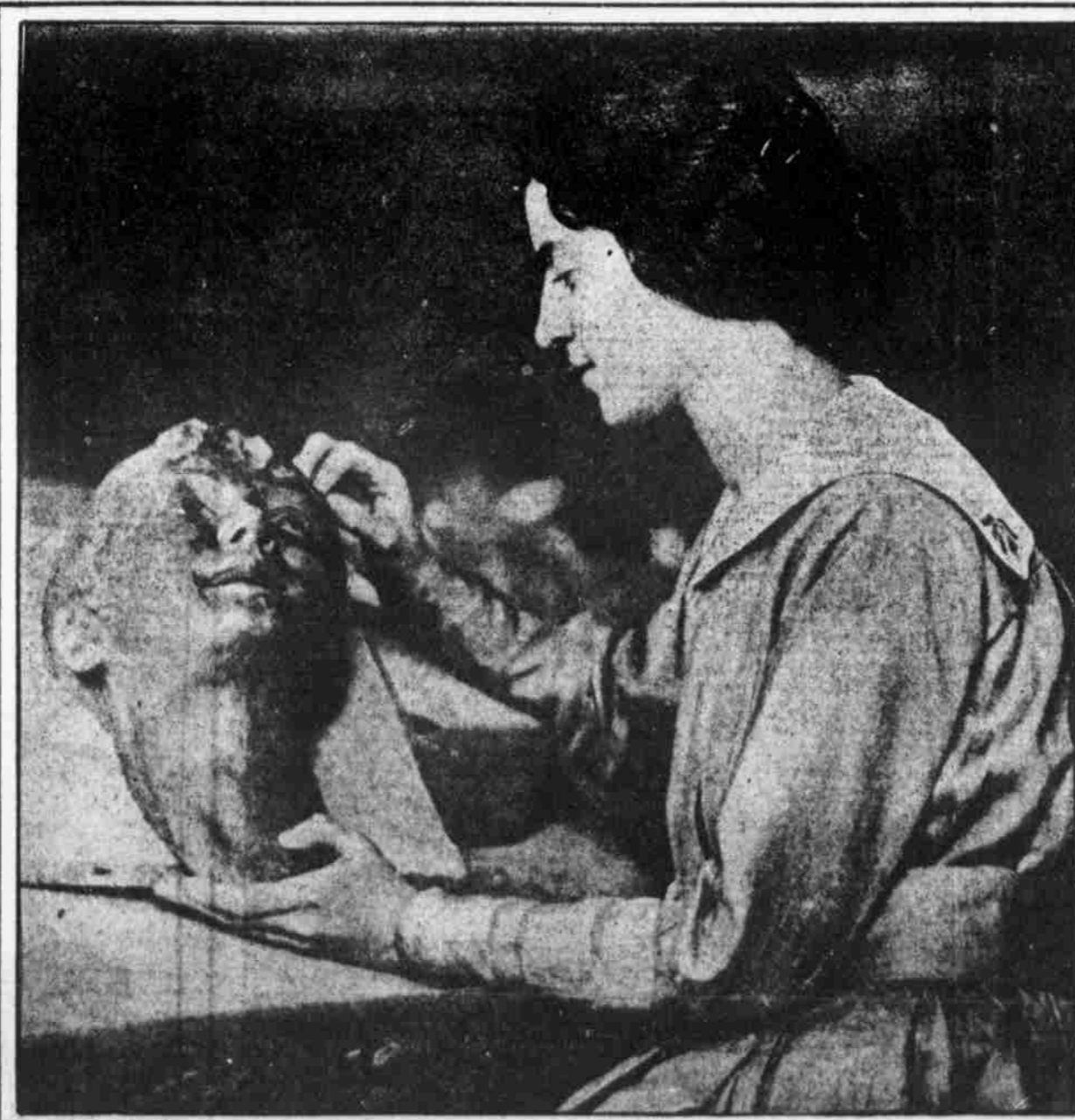
AN ARTIST IN THE MAKING