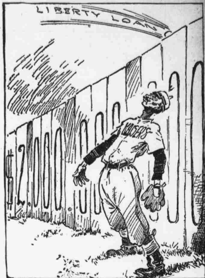
OVER THE FENCE IN THE FIRST INNING