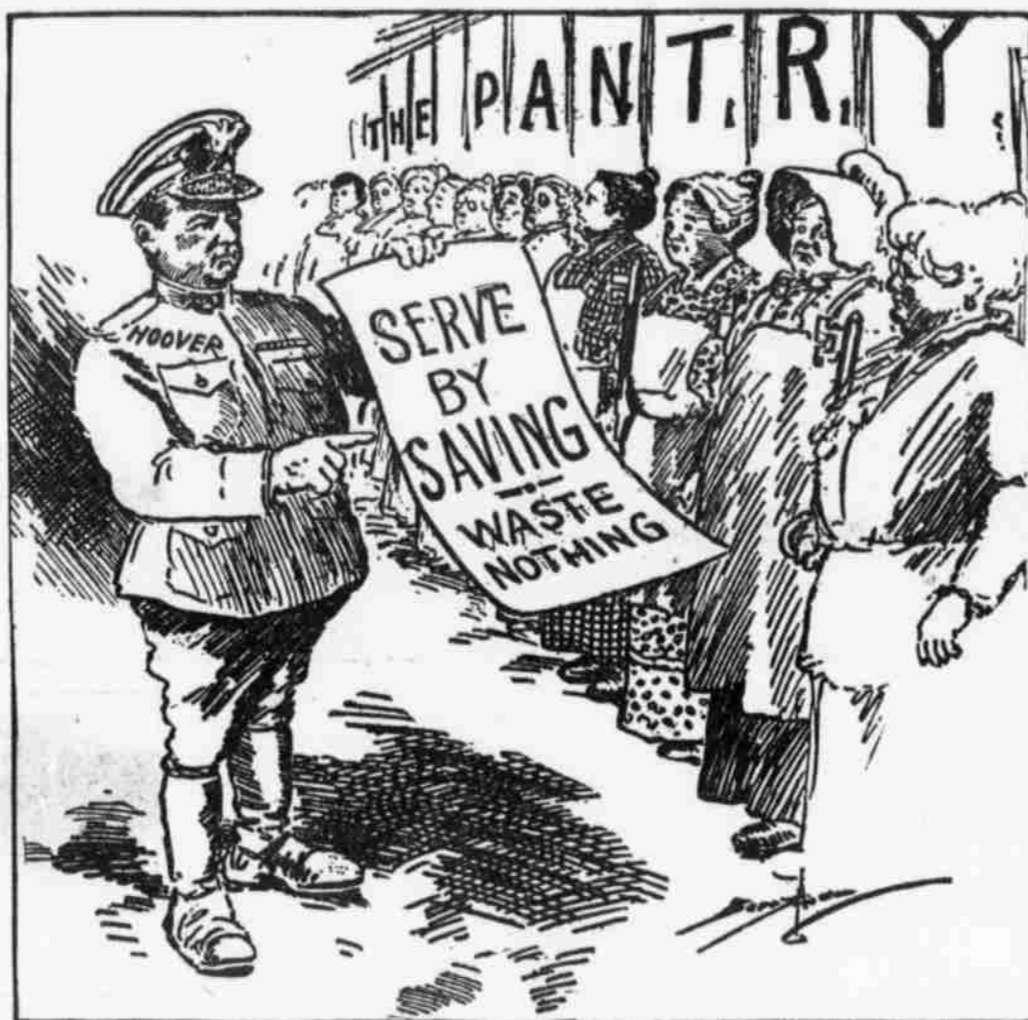
THE NEW CONSCRIPTION