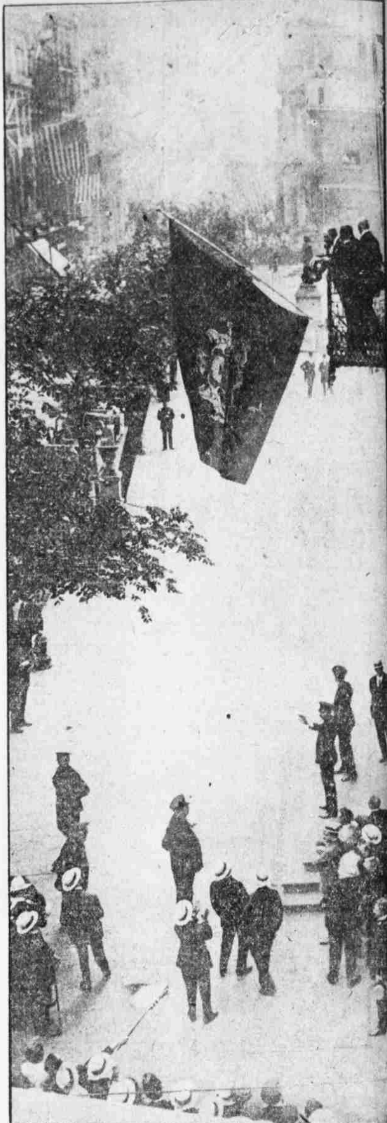
FROM THE BALCONY OF CONGRESS HALL, WHERE WASHINGTON WAS INAUGURATED IN 1793, THE VISITORS LOOK OUT UPON THE CROWDS BELOW