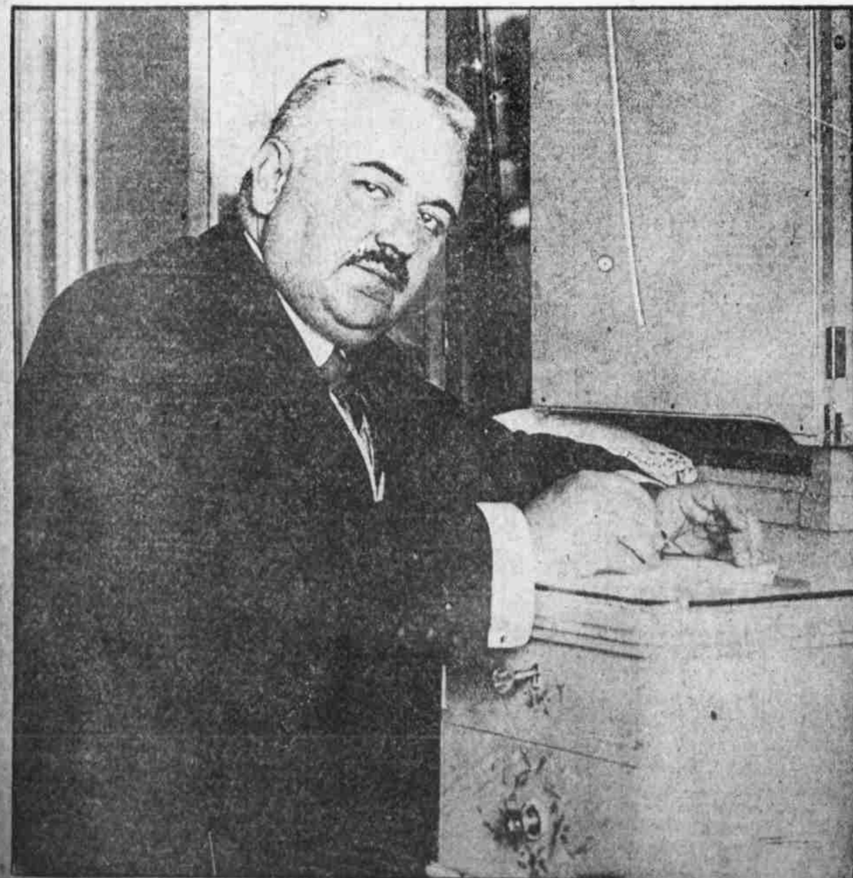
BEFORE SETTING OUT FOR THE TRIP TO INDEPENDENCE HALL SIGNOR NITTI, GIVES AN EXCLUSIVE INTERVIEW TO THE EVENING LEDGER