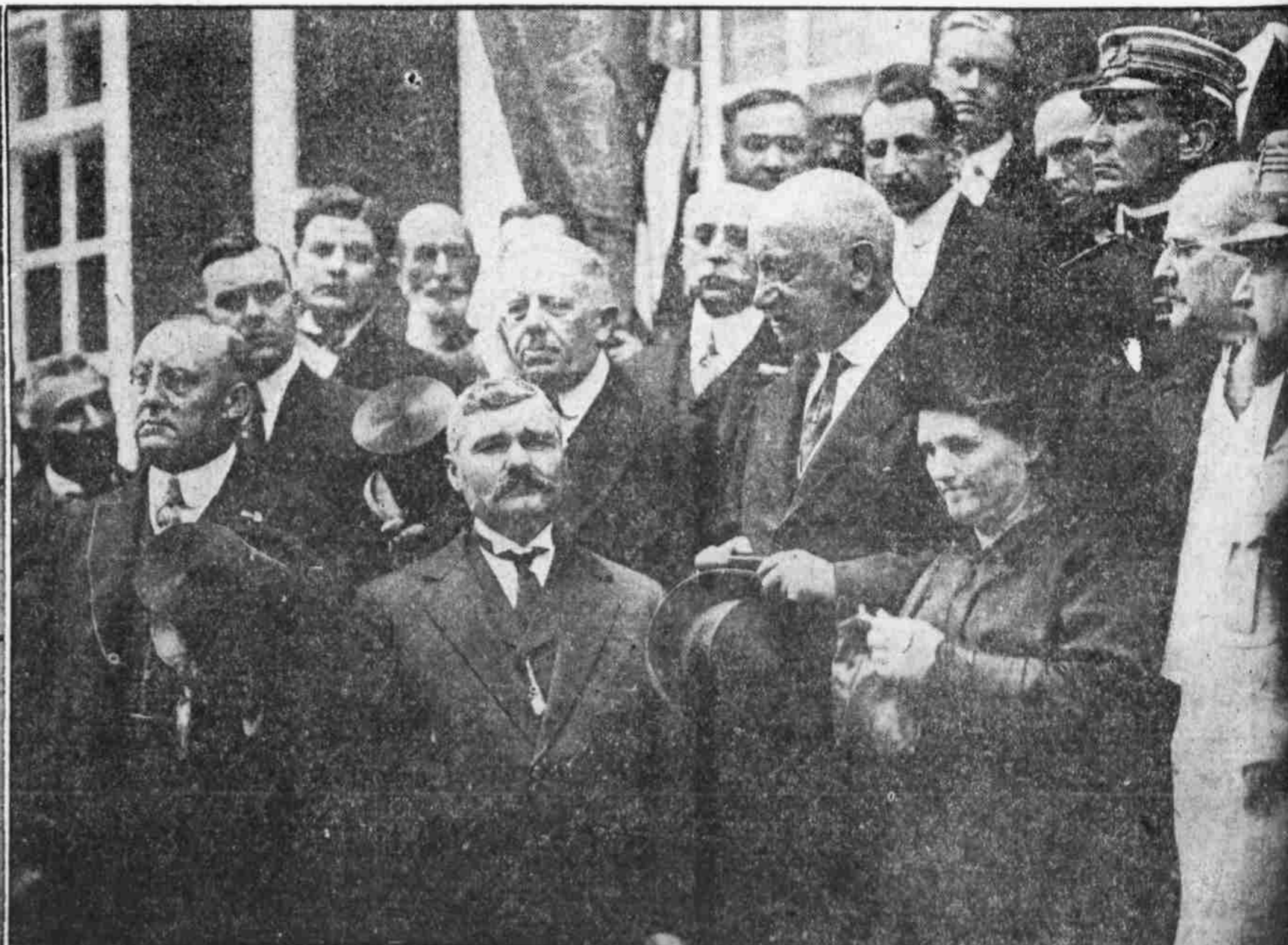
MEMBERS OF THE DISTINGUISHED PARTY JOIN IN THE BRIEF CEREMONY THAT MARKED THE PRESENTATION OF THE MEDAL COMMEMORATING THE BRAVERY OF YOUNG BELGATTO