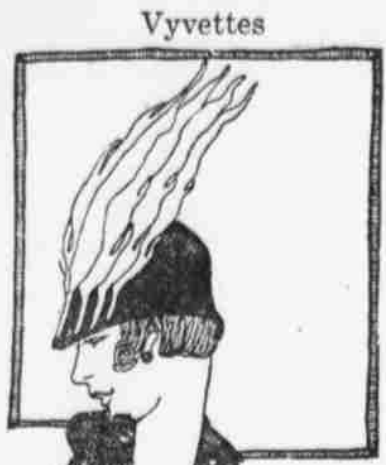
Vyvettes A hat somewhat suggestive of the headpiece of an Indian chief—quite an American creation!