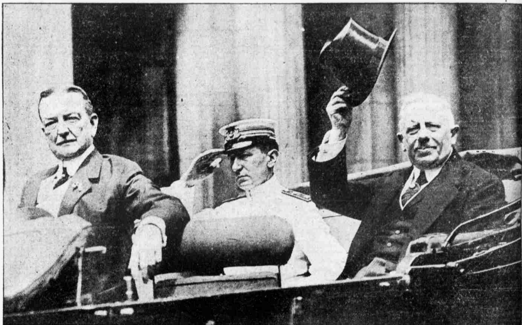
SIGNOR GUGLIELMO MARCONI, WHO IS A LIEUTENANT OF THE ITALIAN ENGINEER CORPS, ACKNOWLEDGES THE POPULAR ACCLAMATION. SEATED IN THE AUTO WITH HIM ARE COUNT MACCHI DI CELLERE, ITALIAN AMBASSADOR, AND WILLIAM POTTER, FORMER MINISTER TO ITALY, IN THE FRONT SEAT