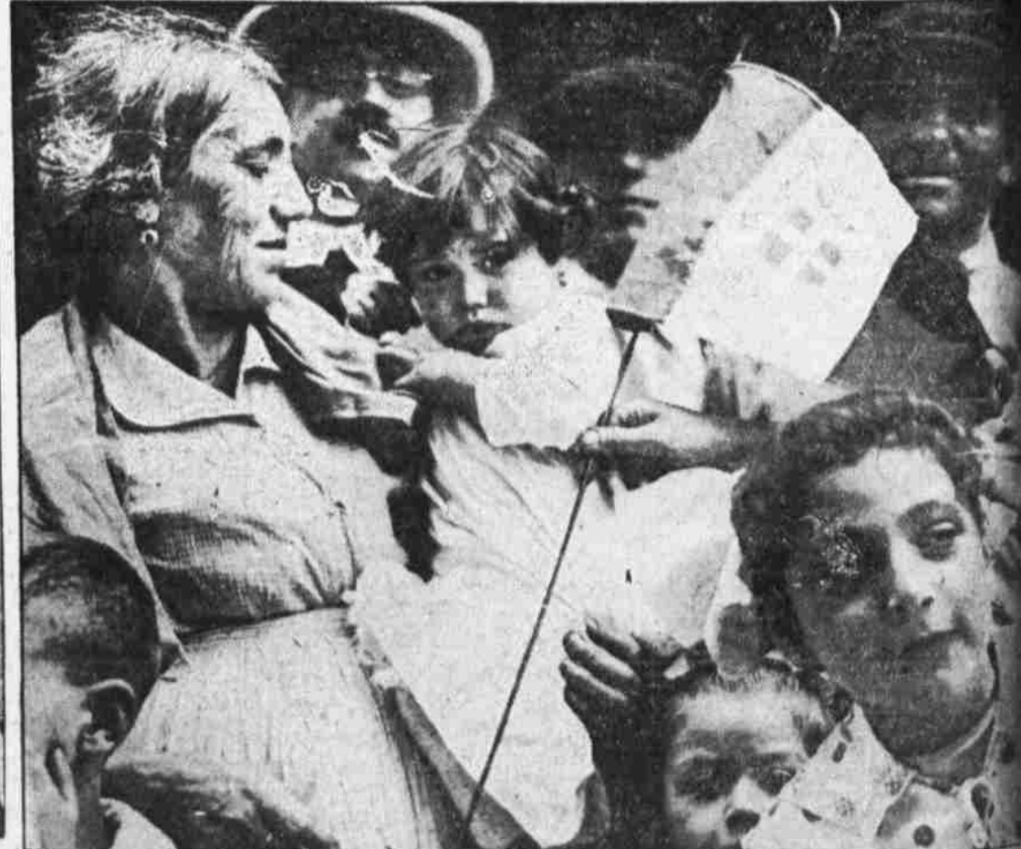
"LITTLE ITALY" AND "YOUNG AMERICA" BECOME SYNONYMOUS IN PATRIOTIC ALLIANCE AS THE FLAGS OF BOTH NATIONS WAVE IN GREETING TO THE DISTINGUISHED GUESTS OF HONOR