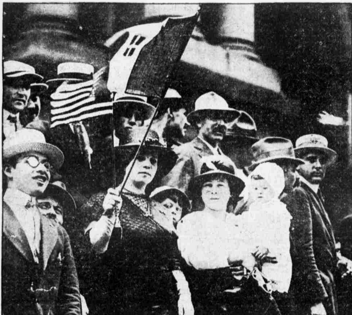
BUSINESS WAS SUSPENDED IN THE DISTRICTS POPULATED BY CITIZENS OF ITALIAN BIRTH AS YOUNG AND OLD CONGREGATED ON BROAD STREET TO PARTICIPATE IN THE RECEPTION TO THEIR COMPATRIOTS