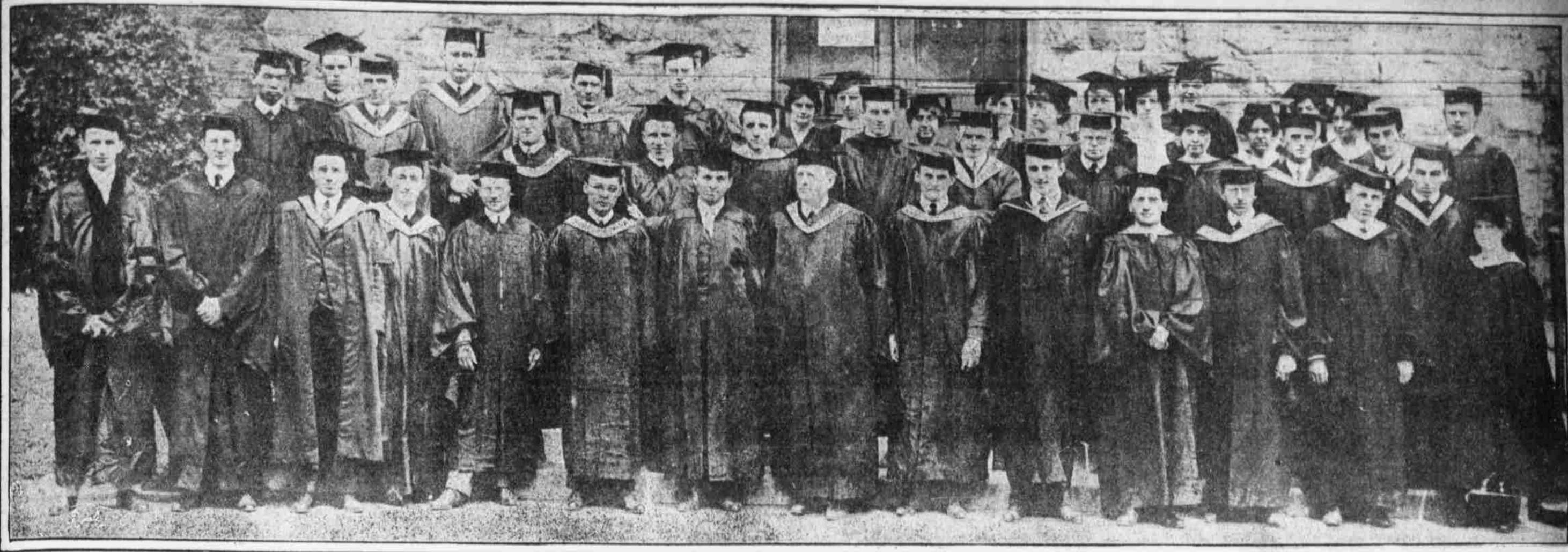
THE GRADUATING CLASS OF THE UNIVERSITY OF PENNSYLVANIA GRADUATE SCHOOL POSES FOR AN EVENING LEDGER PHOTOGRAPHER ON THE STEPS OF HOUSTON HALL