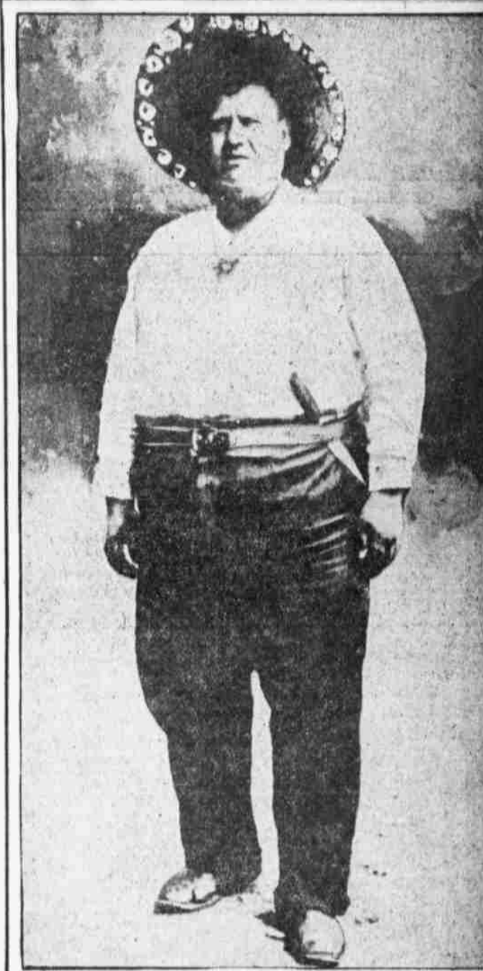
A WIDELY KNOWN RESIDENT OF KENSINGTON READY TO MEET THE KAISER. WHO IS HE? A prize of $2 will be awarded for the first correct identification mailed to the Pictorial Editor, EVENING LEDGER.