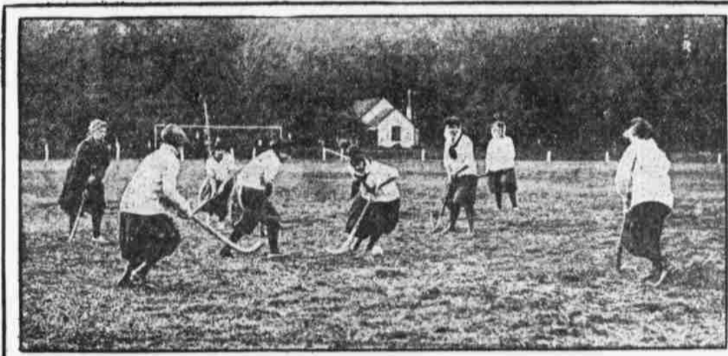
PENN STATE CO-EDS IN A HOCKEY SCRIMMAGE ON THEIR ATHLETIC FIELD