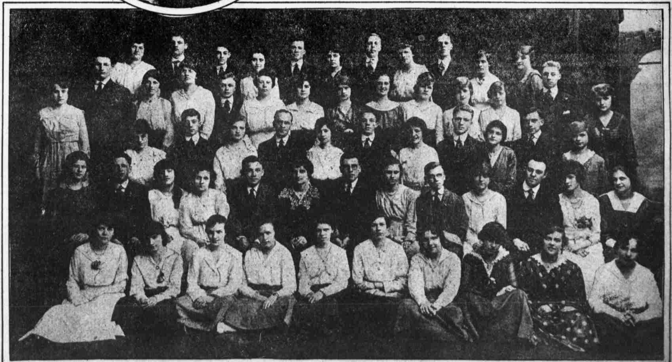
READY TO TAKE THEIR PLACES IN THE RANKS OF THE BUSINESS ARMY Section of Temple University graduating class of 1917, comprising the classes in book keeping and shorthand, who have completed the course at the North Broad street institution.