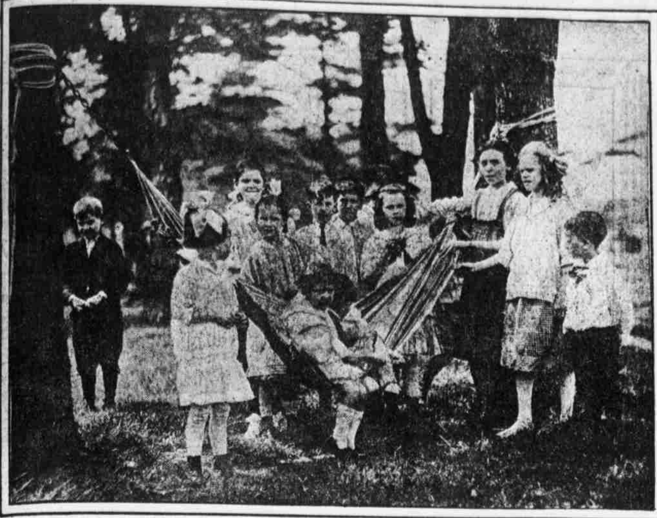
A HUMBLE BUT POPULAR RIVAL OF THE ROOF GARDEN A family dinner or supper under the trees of Fairmount Park affords a pleasant diversion for the half holiday.