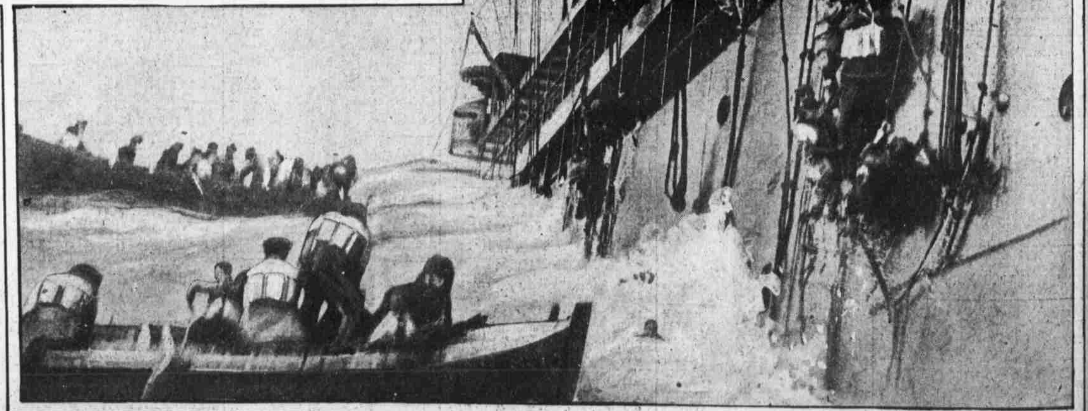
REMARKABLE EXCLUSIVE PHOTOGRAPH OF THE SINKING OF A FRENCH LINER TORPEDOED IN THE MEDITERRANEAN Passengers and crew are clambering down the sides of the ship to the lifeboats a few seconds before the vessel stood on end and dived to her watery grave. The liner, a ship of about 10,000 tons, was attacked without warning.