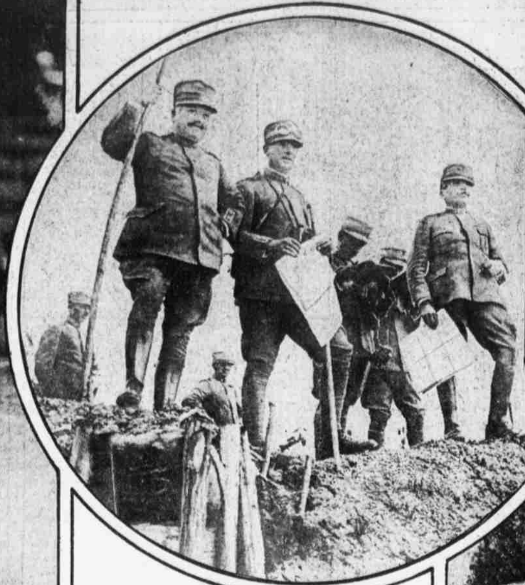
CADORNA VIEWS THE ROAD TO TRIESTE The commander-in-chief of the Italian armies and his staff watching the progress of the battle for possession of the coast road to the coveted city. Cadorna is on the extreme right.

Ty Cobb once again is relishing the rarefied atmosphere at the top of the batting ladder of Ban Johnson's organization.