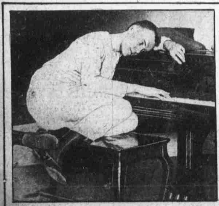
A POPULAR COMPOSER AT WORK Earl Carroll, who wrote the music for "So Long Letty" and "Canary Cottage," in an unconventional pose at his piano.