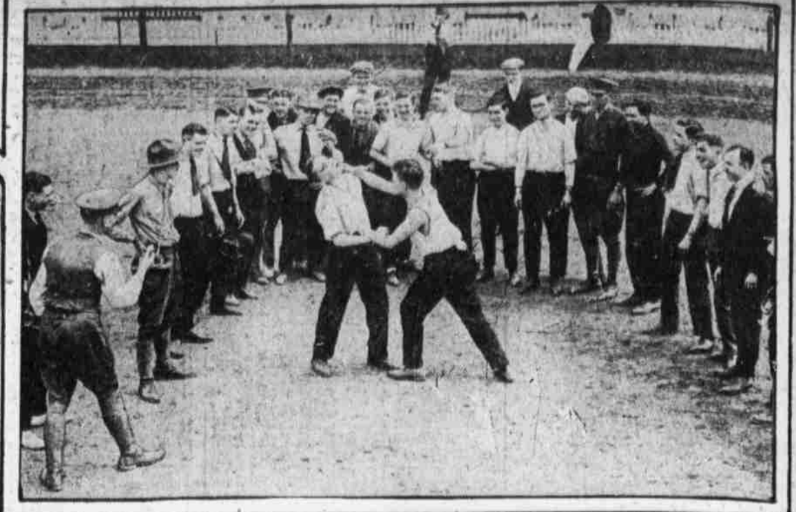
A FRIENDLY BOUT AT THE ALLENTOWN TRAINING CAMP FOR THE AMBULANCE CORPS, WHERE GOOD FELLOWSHIP REIGNS SUPREME