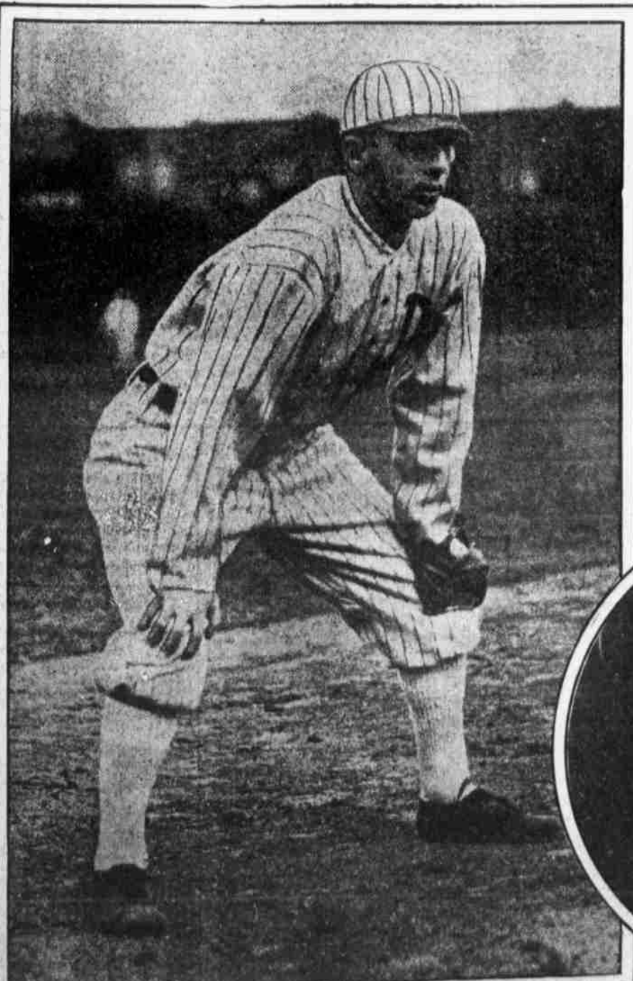
"OF COURSE, I KNOW WHO IT IS; I SAW HIM PLAY IN—" A prize of $2 will be awarded for the first correct identification of this player mailed to the Pictorial Editor, EVENING LEDGER.