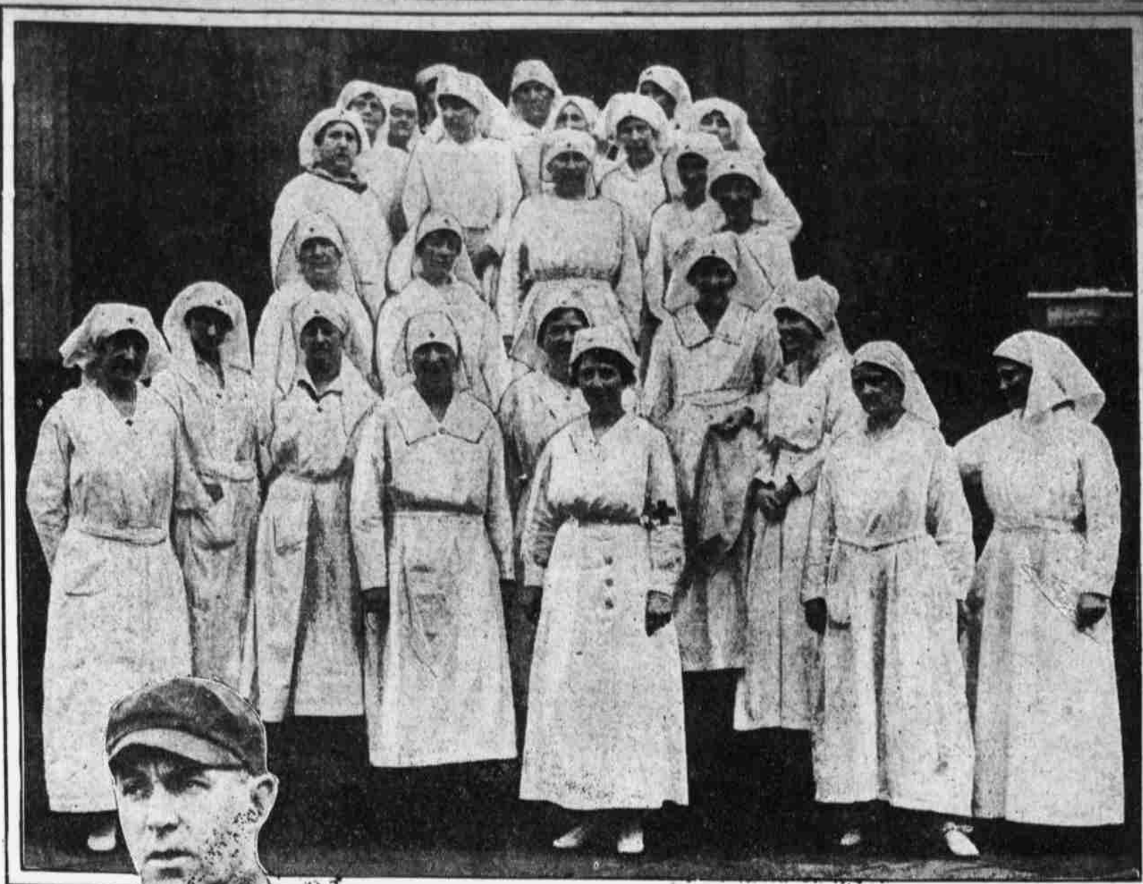
PHILADELPHIA WOMEN MAKE DRESSINGS FOR WAR'S WOUNDED The former Lippincott mansion, 218 South Nineteenth street, has been turned into a workshop and school of instruction in bandage making, the pupils being women of Philadelphia's higher social circles.