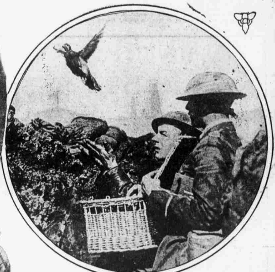
THE WIRELESS TELEPHONES OF THE TRENCHES Soldiers in the French dugouts releasing carrier pigeons trained to convey messages to parts of the battle lines where wire communication has not been established.