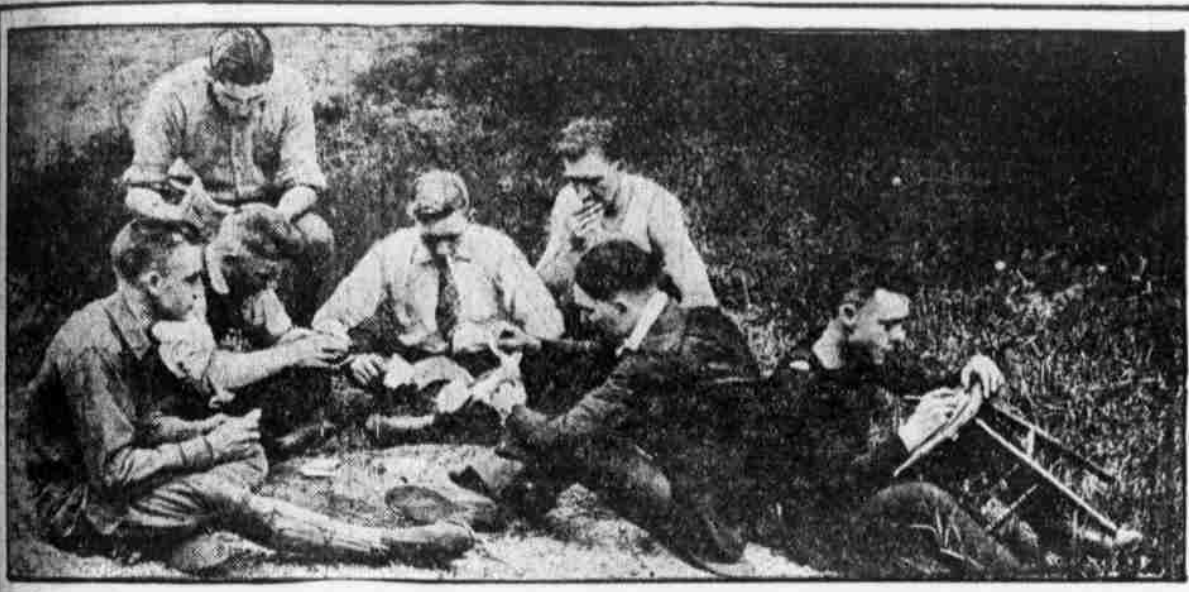
A FRIENDLY GAME IN CAMP AT ALLENTOWN Strategic study and preparation, even in the course of a world war, is not confined to military maneuvers and poring over a map or plan of battle.