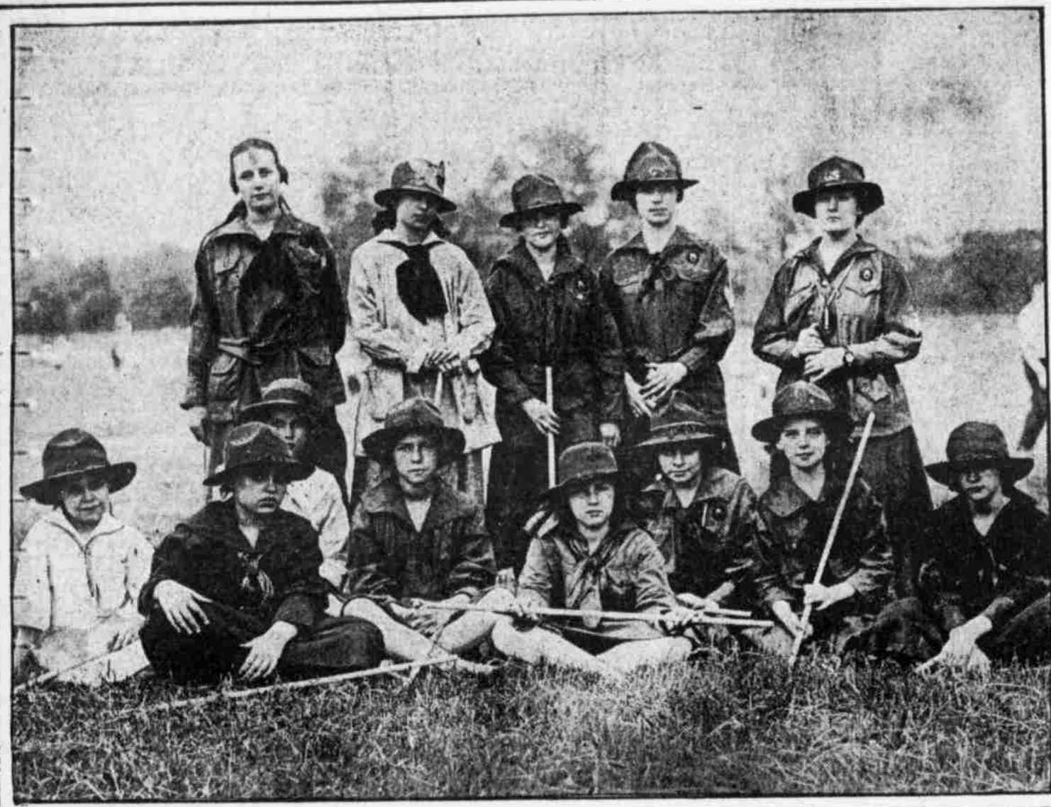
TROOP FOURTEEN, OF THE GIRL SCOUTS, IS AMERICAN TO THE CORE These young patriots pride themselves on their willingness to do their whole duty, whatever sacrifice it may entail. They were photographed at last Saturday's festival in Fairmount Park.