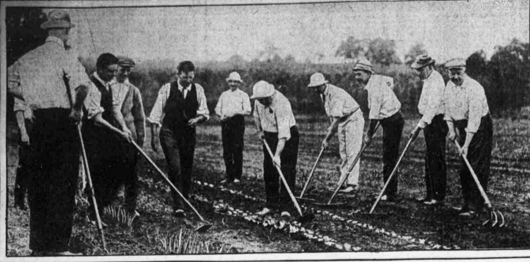
MEMBERS OF THE NORTH HILLS COUNTRY CLUB UPTURN THE GREENSWARD TO MAKE WAR GARDEN Inspired by the patriotic movement begun by several New York golf clubs, the Philadelphia organization is doing its part to relieve the food shortage.