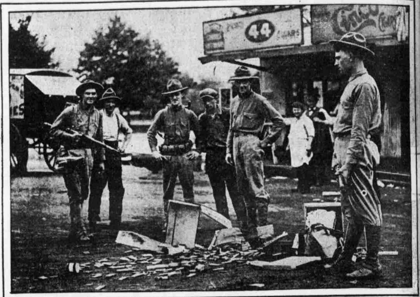
A FEW OF UNCLE SAM'S BELONGINGS COME TO GRIEF Marines from a Virginia training station spill a box of supplies in disembarking at League Island.