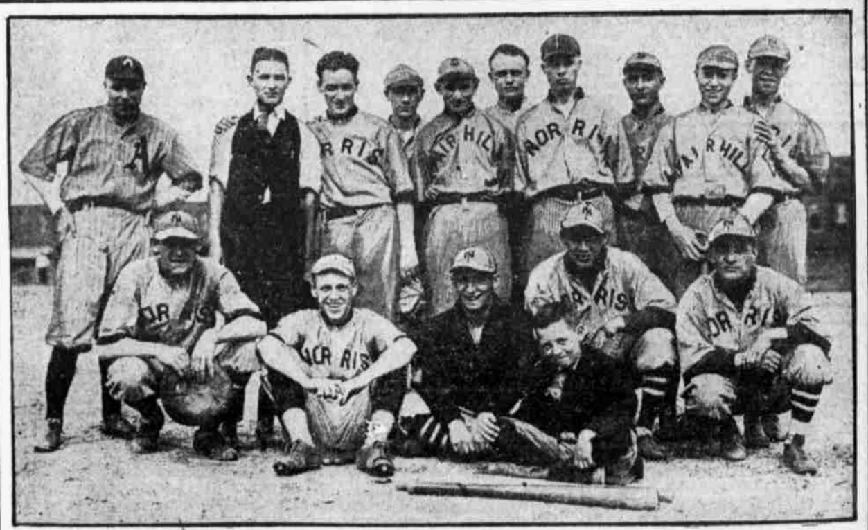
BASEBALL TEAM OF THE NORRIS FIELD CLUB They are ready to meet all comers and promise to give a good account of themselves.