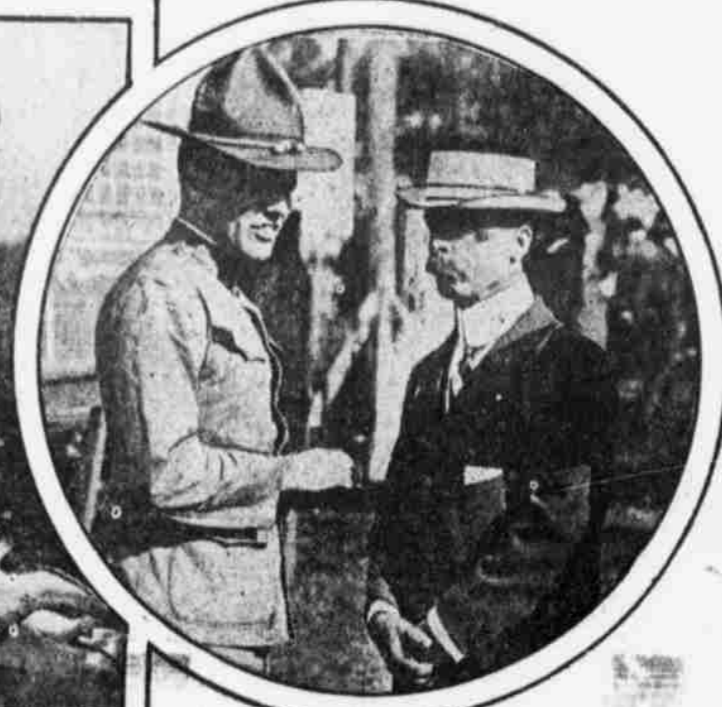
CLARENCE MACKAY, SOCIETY AND SPORTING MAN, DISCUSSES THE RACES WITH QUENTIN ROOSEVELT, WHO IS A MEMBER OF THE ARMY AVIATION CORPS