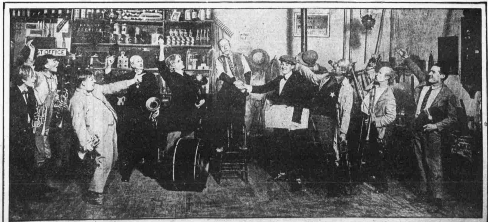
BEING A FOREGLIMPSE OF "RUBEVILLE," A MELANGE OF MIRTH AND MELODY IN WHICH A COMPANY OF TEN PLAYERS APPEAR AT THE B. F. KEITH THEATRE DURING THE CURRENT WEEK