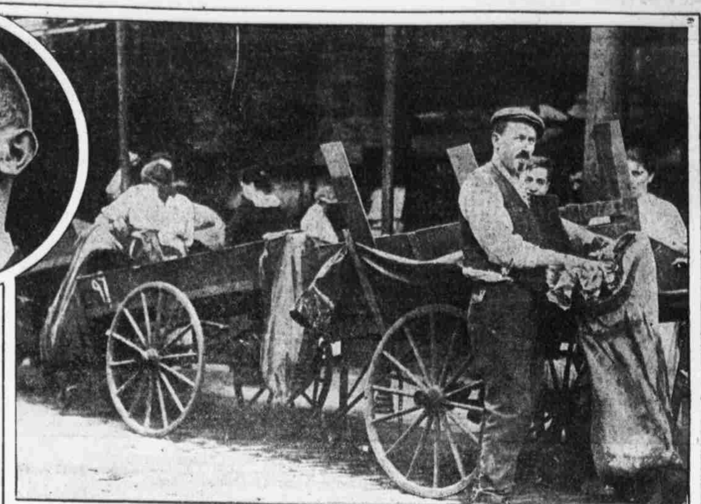
CO-OPERATIVE EFFORTS BY THE CURBSTONE MERCHANTS AND RUBBISH BAGS EMPTIED HALF-HOURLY ARE CREATING A NEW "SPOTLESS TOWN"