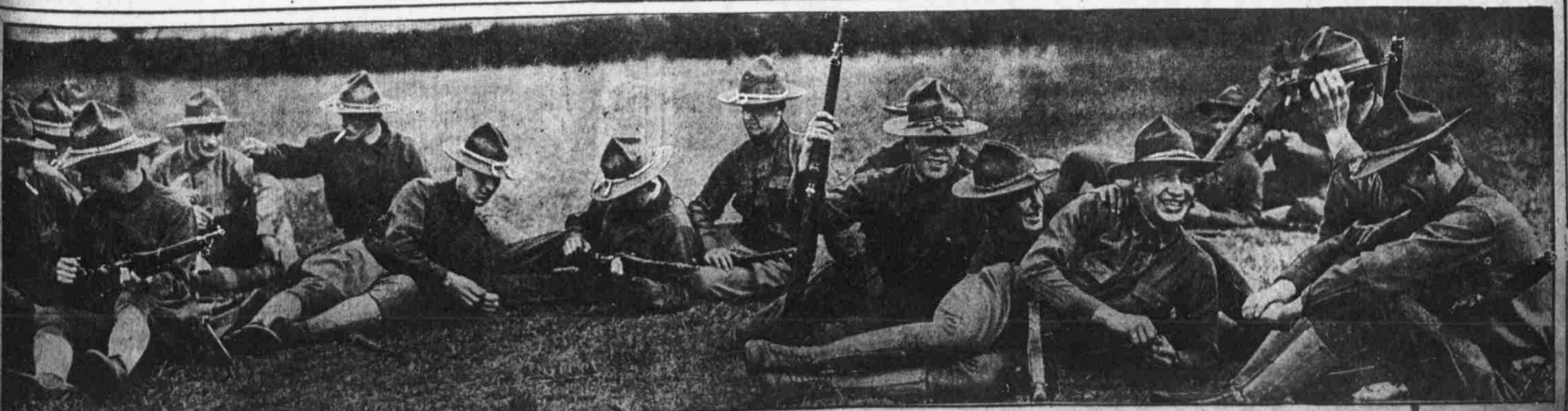
MEMBERS OF THE SECOND REGIMENT, NEW JERSEY NATIONAL GUARD, ENJOY A BREATHING SPELL UPON RETURNING FROM A STRENUOUS HIKE TO THEIR ENCAMPMENT AT THIRTY-SECOND STREET AND WESTFIELD AVENUE, CAMDEN