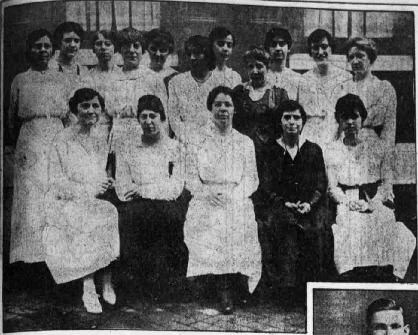
GRADUATING CLASS OF THE PENNSYLVANIA SCHOOL FOR SOCIAL SERVICE AT 1302 PINE STREET