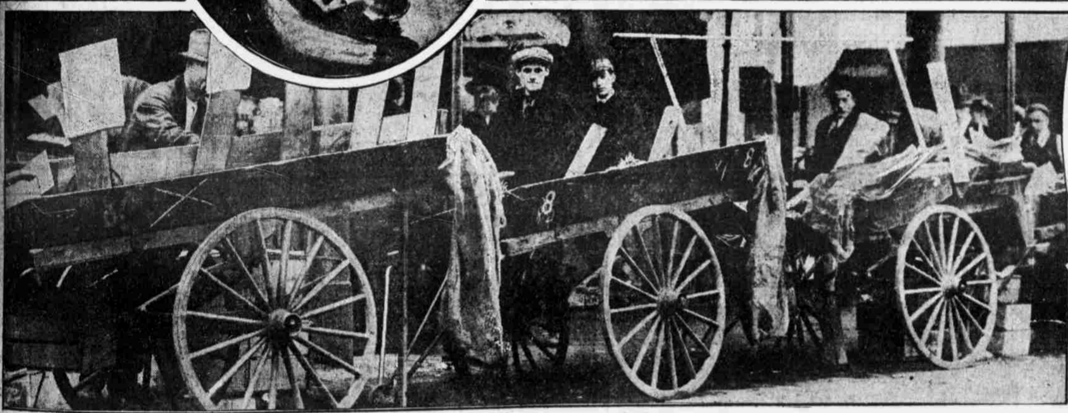
SOUTH STREET'S ARRAY OF PUSHCARTS CLING TO THEIR STANDS DESPITE THE INFLATED WAR PRICES THAT HAVE CURTAILED THEIR SALES OF FOOD