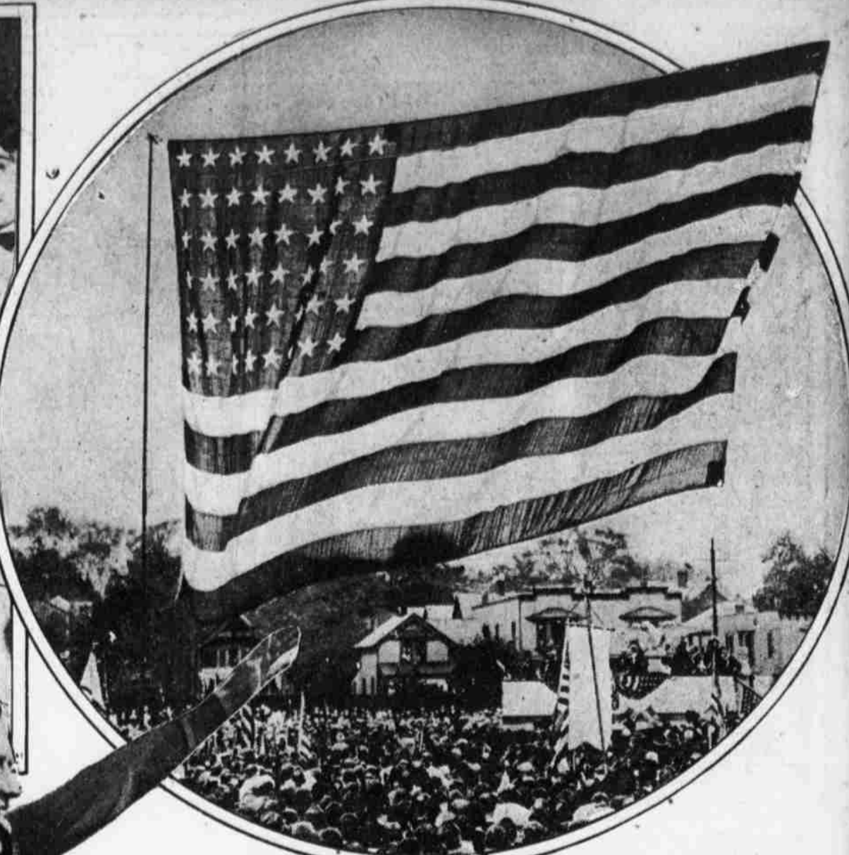
LARGEST FLAG IN THE STATE OF OHIO, MEASURING 75 BY 50 FEET, UNFURLED BY EMPLOYEES OF THE B. F. GOODRICH COMPANY AT AKRON

French jackies, paying their first visit to the United States, learn all the delights of the beloved ice cream soda in a New York "saloon."