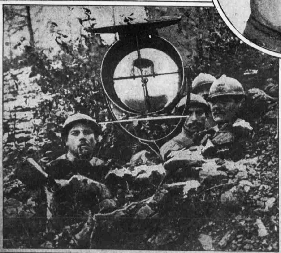
THE EYES OF THE TRENCHES, ON THE LOOKOUT DAY AND NIGHT. During the daytime the soldiers keep a watchful eye on the enemy by means of periscopes or by peering over the parapets. At night the giant searchlights act as sentinels.

Perhaps you can identify the spot, in the very heart of the Philadelphia of today. For the first correct identification mailed to the Pictorial Editor a prize of $2 will be paid.