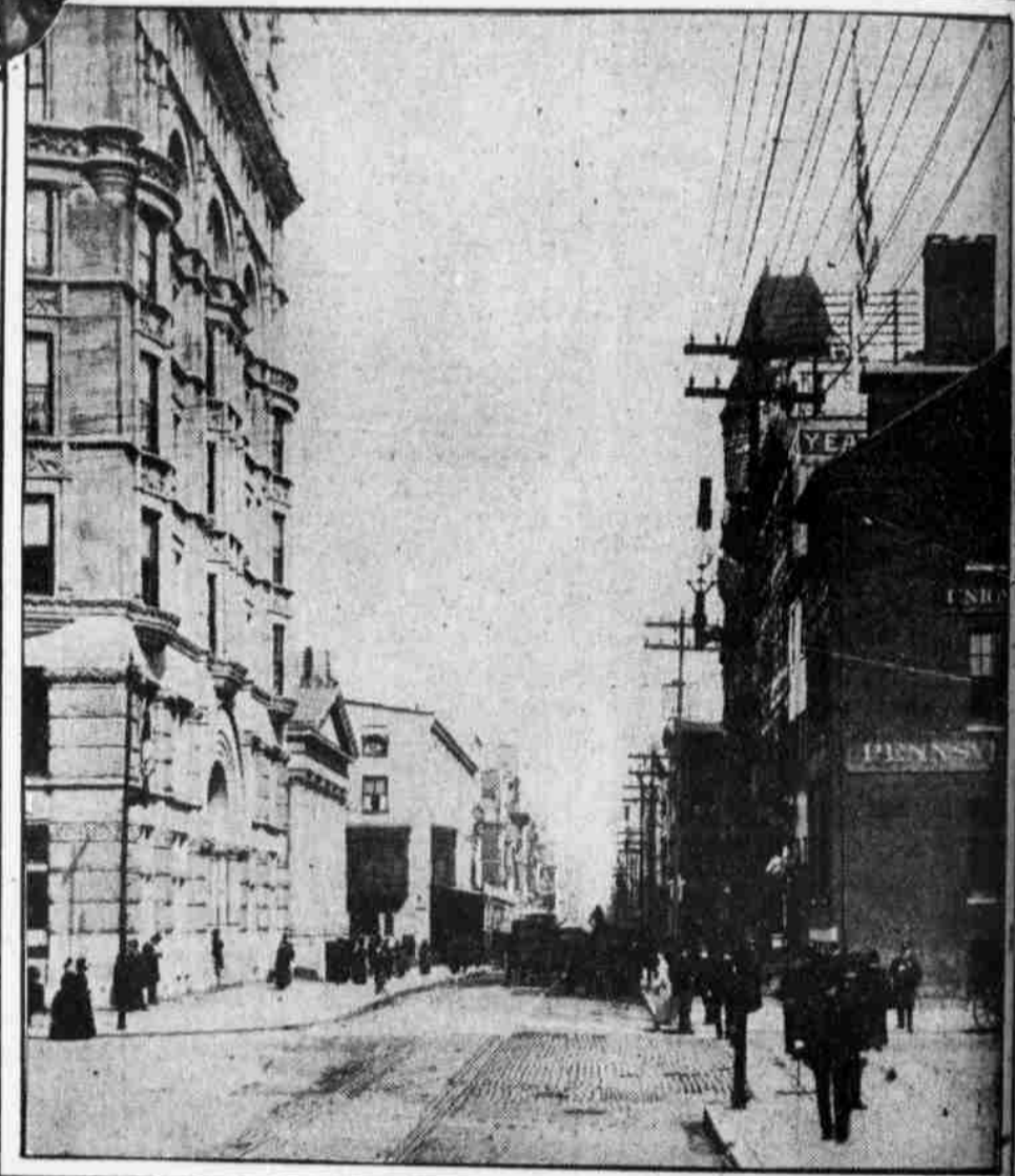
THIS PHOTOGRAPH WAS TAKEN IN THE NINETIES. DO YOU KNOW WHERE?

Perhaps you can identify the spot, in the very heart of the Philadelphia of today. For the first correct identification mailed to the Pictorial Editor a prize of $2 will be paid.